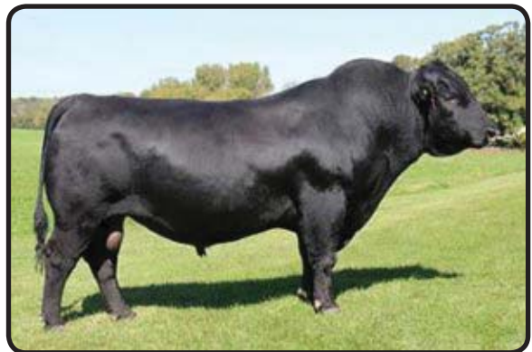
QUAKER HILL RAMPAGE OA36