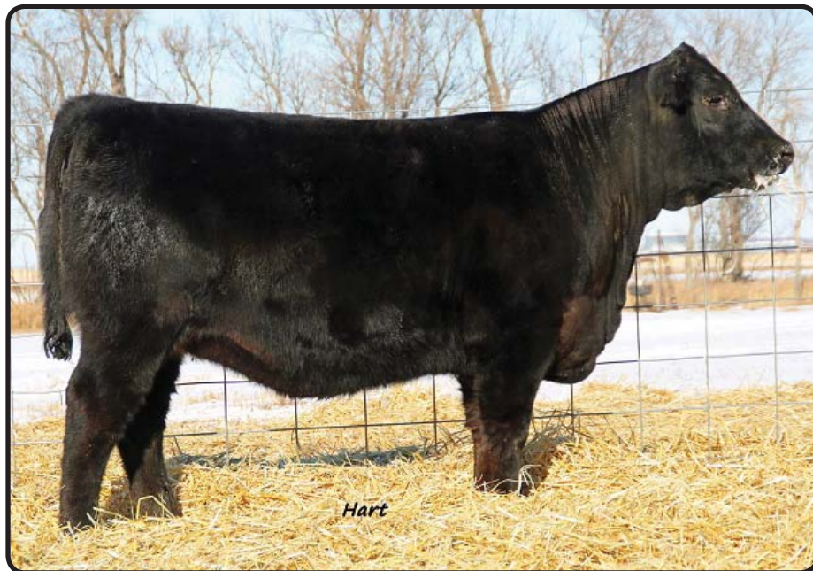
QUEEN OF HARTS 7090 • LOT 98