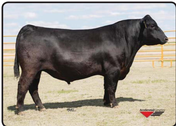
SILVEIRAS CONVERSION 3048