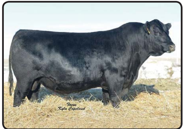
BASIN PAYWEIGHT 1682