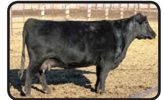
HART MISTI 7017