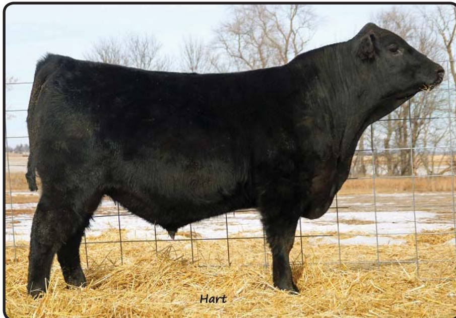
HART PAYWEIGHT ET 7507 • LOT 19