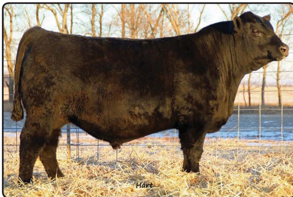
HART TITAN 7051 • LOT 78