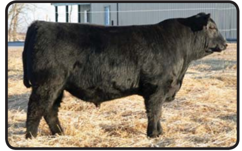
HART MEL 4021

$4750 maternal brother to Lot 38 selected by Craig Malsom, SD