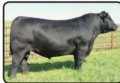
SAV TEN SPEED 3022