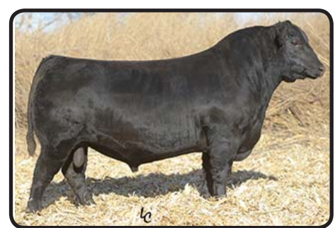
EF COMMANDO 1366

Maternal brother to the dam of lots 9 and 10