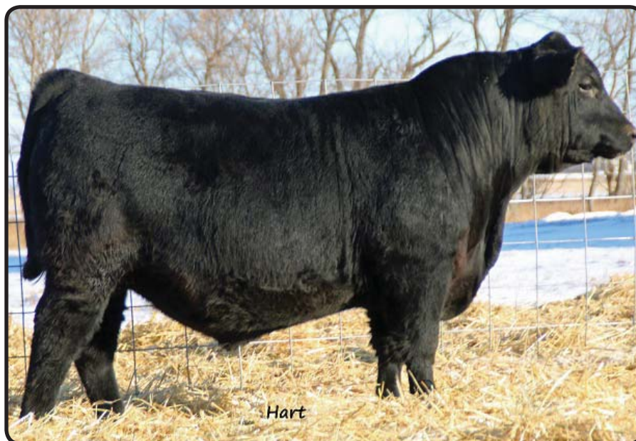
HART PAYEIGHT ET 7519 • LOT 10