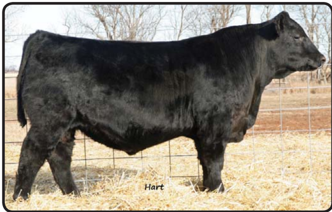
HART RAMPAGE 7213 • LOT 24

24 Hart Rampage 7213 Reg: 18942292 Tattoo: 7213 BD: 02/10/17 Bull Act. BW 92 lbs Adj. WW 856 lbs WW Ratio 116