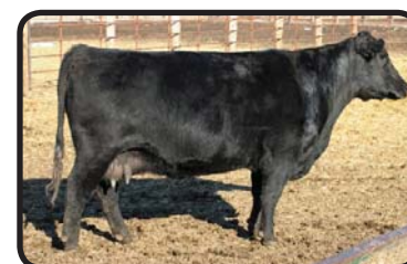
HART MISTI 7017

Pathfinder dam of lot 94 and grandam of lot 95