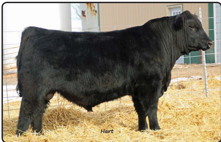
HART PAYWEIGHT ET 7584 • LOT 14