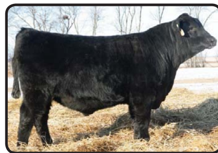
HART PIONEER 4281