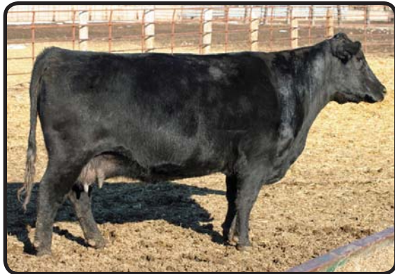
HART MISTI 7017