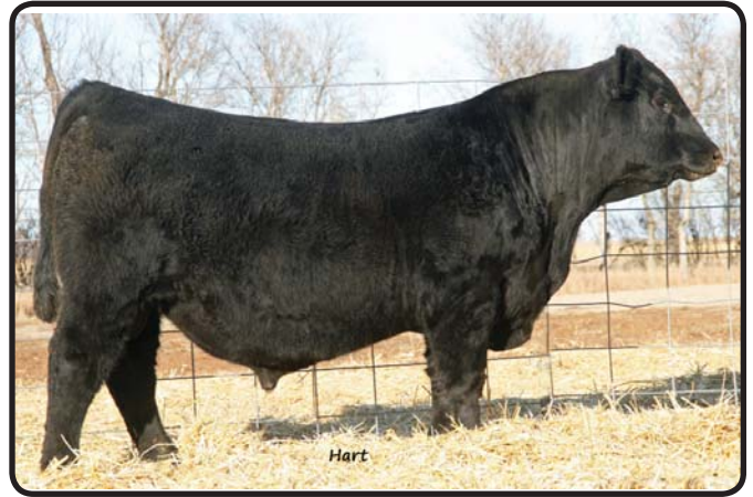
HART INDEX ET 7502 • LOT 42