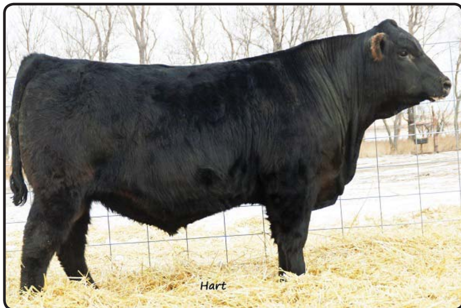
HART CONVERSION 7223 LOT 39