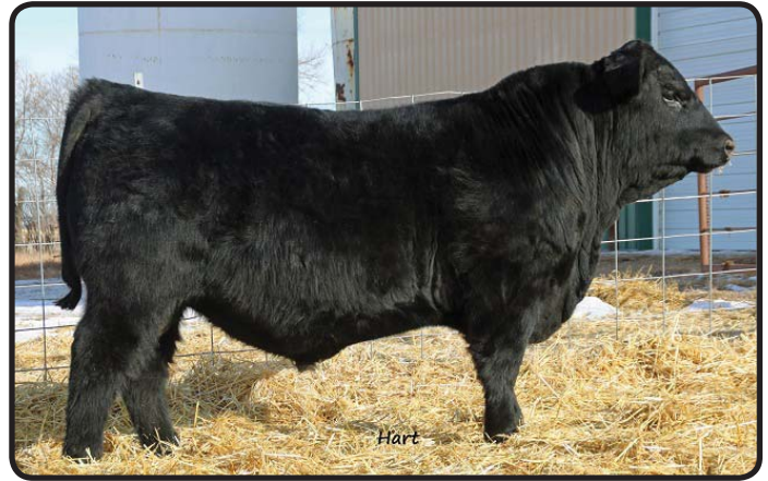
HART BANKROLL 7207 • LOT 5

5 Hart Bankroll 7207 Reg: 18940359 Tattoo: 7207 BD: 02/10/17 Bull Act. BW 80 lbs Adj. WW 765 lbs WW Ratio 104