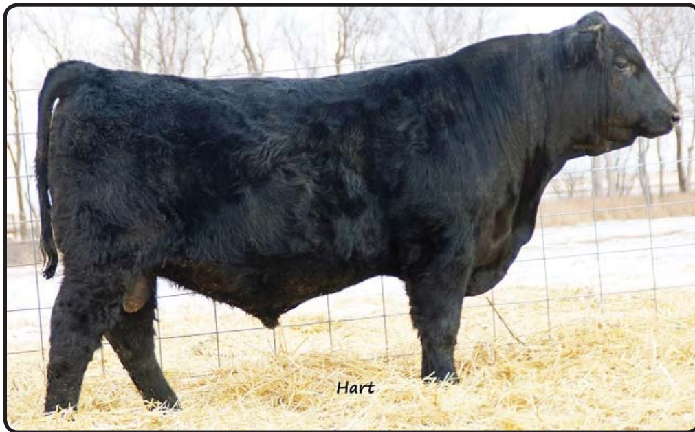
HART PAYWEIGHT ET 7516 LOT 18