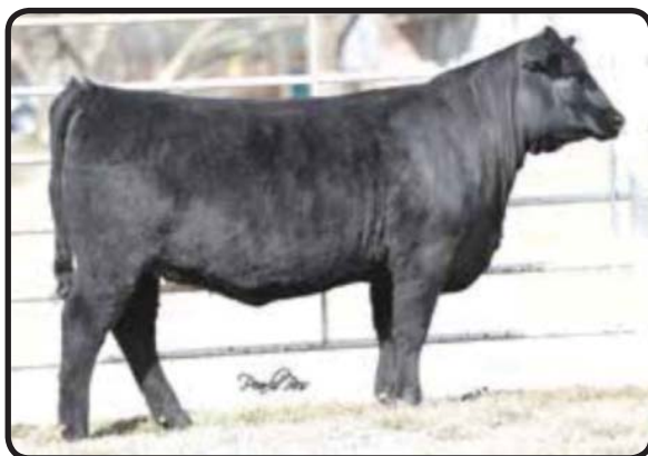
DSA DISCOVERY SJH 2705

Donor dam to Lot 21 as a $17,000 heifer calf.