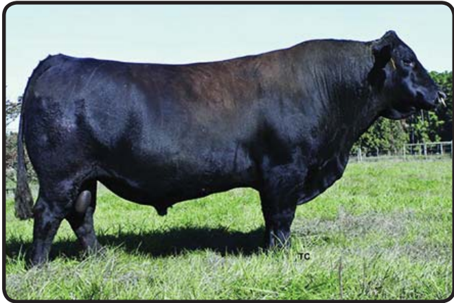
K C F BENNETT FORTRESS