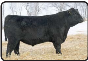
HART CAVALRY ET 3412

$10,000 maternal brother to Lots 52 thru 55