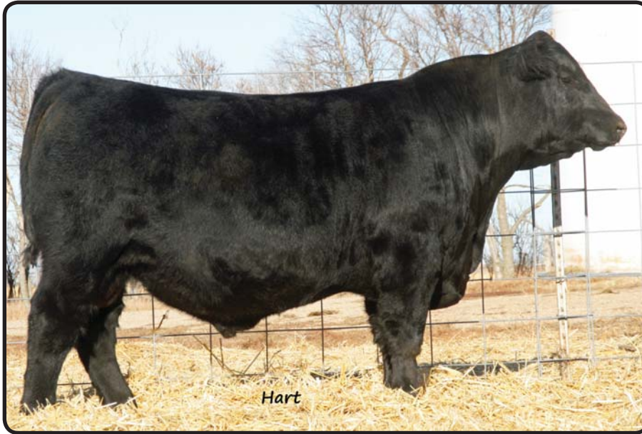
HART PAYEIGHT ET 7506 • LOT 9