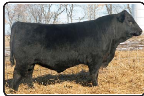
HART OPEN RANGE 6127