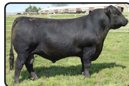
BALDRIDGE TITAN A129