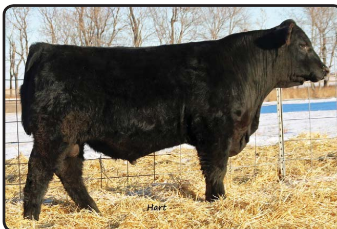
HART WEIGH UP 7072 • LOT 35

35 Hart Weigh Up 7072 Reg: 18940629 Tattoo: 7072 BD: 02/01/17 Bull Act. BW 85 lbs Adj. WW 758 lbs WW Ratio 103