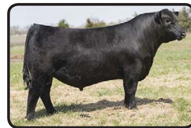
BARSTOW BANKROLL B73