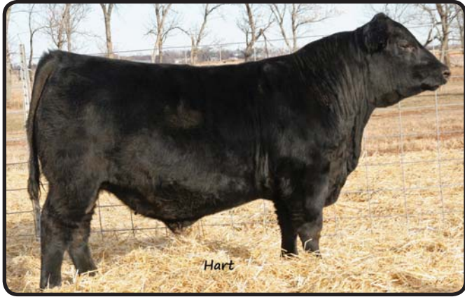
HART COMMANDO 7016 • LOT 64