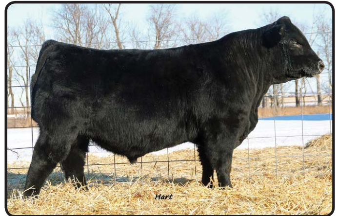
HART TOUR OF DUTY ET 7564 • LOT 55