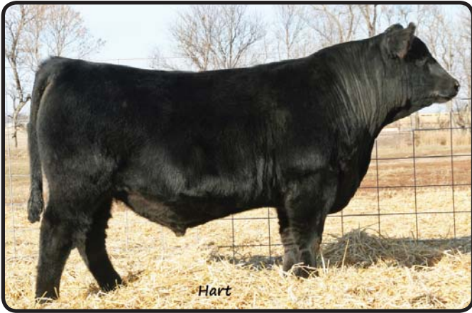
HART BANKROLL 7024 • LOT 3

3 Hart Bankroll 7024 Reg: 18940347 Tattoo: 7024 BD: 01/25/17 Bull Act. BW 67 lbs Adj. WW 830 lbs WW Ratio 113