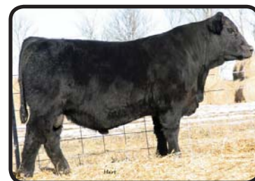
HART TOUR OF DUTY 5091 $9,500 maternal brother to Lot 16 selected by Jeri Jasken, MN