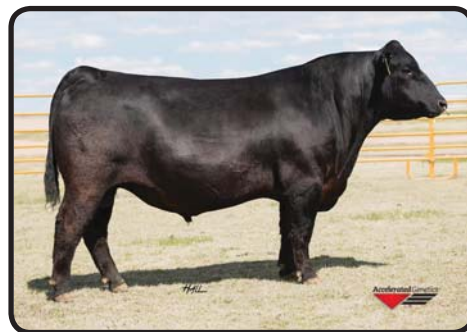
SILVEIRAS CONVERSION 3048