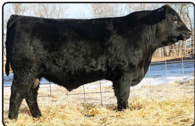
HART WEIGH UP ET 7567 • LOT 33

33 Hart Weigh Up Et 7567 Reg: +18911364 Tattoo: 7567 BD: 03/01/17 Bull Act. BW 71 lbs Adj. WW 832 lbs WW Ratio 100