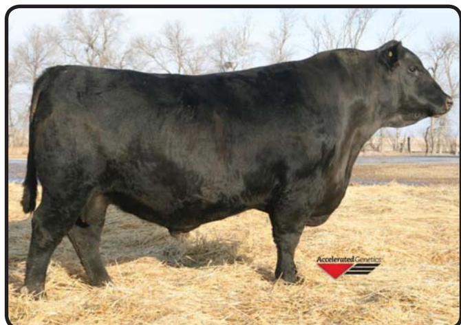
HILLTOP OPEN RANGE 2279