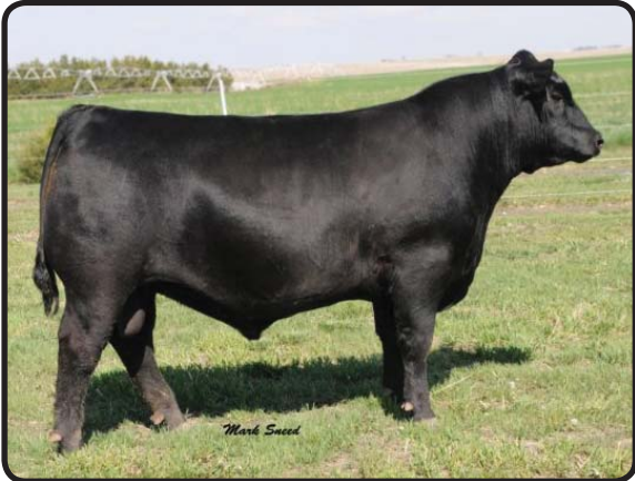
HART MOUNTAINEER 1176 $27,000 Maternal brother to Lots 28, 29, and 30.