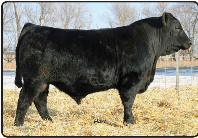
HART COMMANDO 7019 • LOT 69