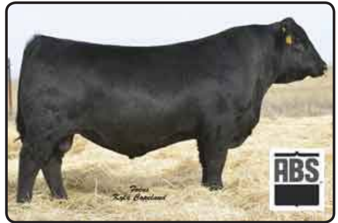
HAYNES OUTRIGHT 452

• Sons sell as lots 56 and 57. HAYNES Outright 452, is an ABS featured sire that gained national recognition as the featured top-selling bull of the 2015 Haynes Cattle sale where he recorded a BW 70 lbs, WW ratio 108, YW ratio 123, IMF ratio 115 and RE ratio 107. Today, he is a high accuracy curve-bending, high docility sire with a $B in the top 10%.