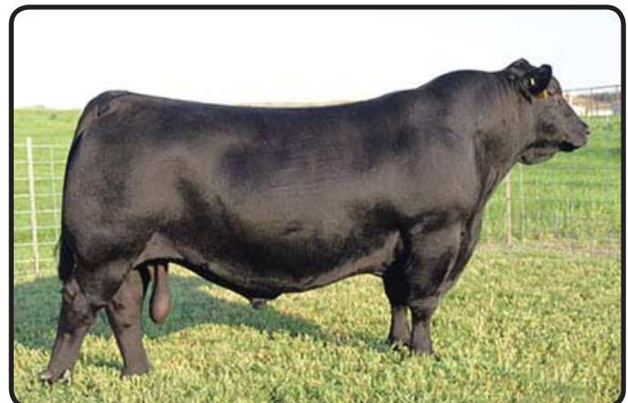
SAV RENOWN 3439

• Sons sell as lots 58 and 59. • SAV Renown 3439 was the $175,000 lead-off bull of the 2014 Schaff Angus Valley Sale and is recognized as a full brother to the equally sought SAV Resource 1441. Each of these is backed by the top-income producing cow in SAV history, SAV Blackcap May 4136 that has produced $8 million in progeny sales.