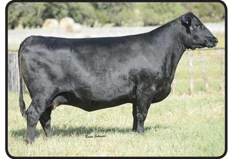
RIVERBEND YOUNG LUCY W1470