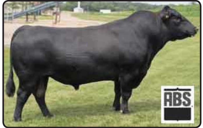
PA SAFEGUARD 021