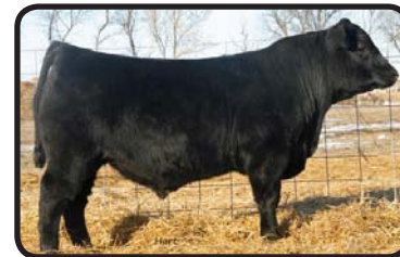
HART COMMANDO 6001

$5,000 maternal brother to Lot 93 selected by Braun Farms, SD