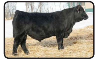
HART COWBOY UP 3350

$8,000 maternal brother to Lot 91 selected by Reuer Farm, SD