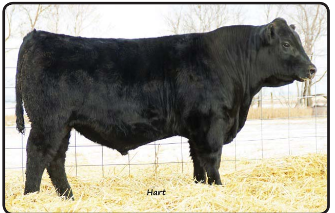
HART RAMPAGE 7232 • LOT 25