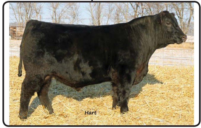
HART TEN SPEED 7215 • LOT 76