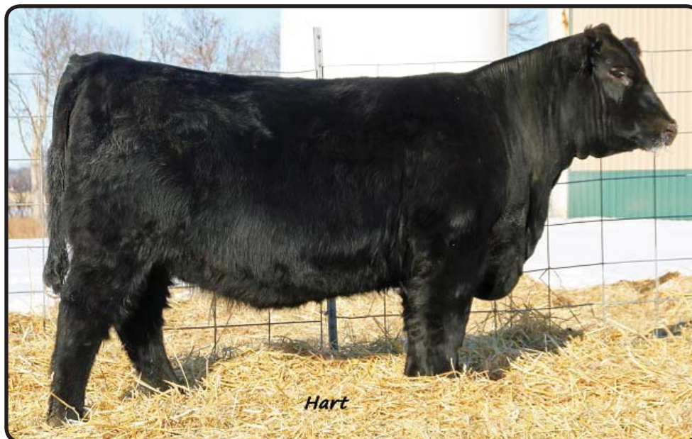
HART EILEENMERE LADY 7204 • LOT 90