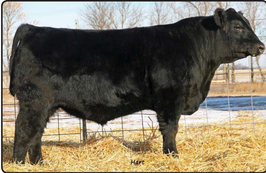
HART CONVERSION 7169 • LOT 38