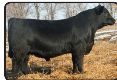
HART 2100 6049