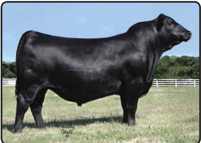
V A R RANGER 3008