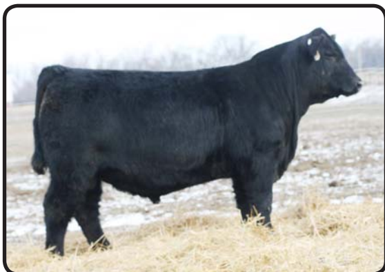
HART BATTLESHIP 9010

$23,000 maternal brother to Lots 33 and 34 at ABS Global