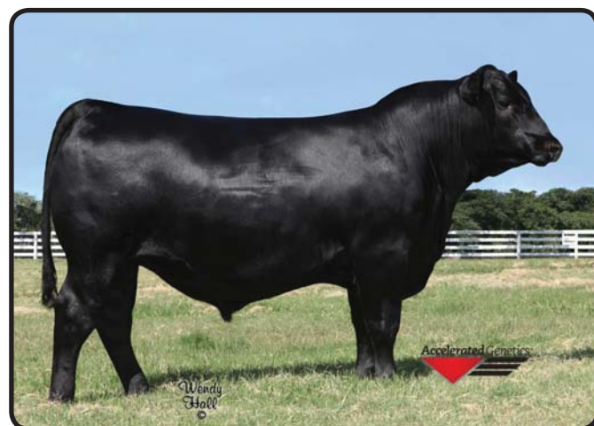
VAR INDEX 3282