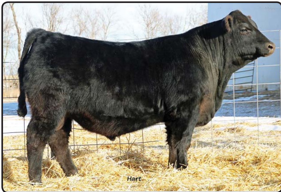
HART TEN X ET 7558 • LOT 77