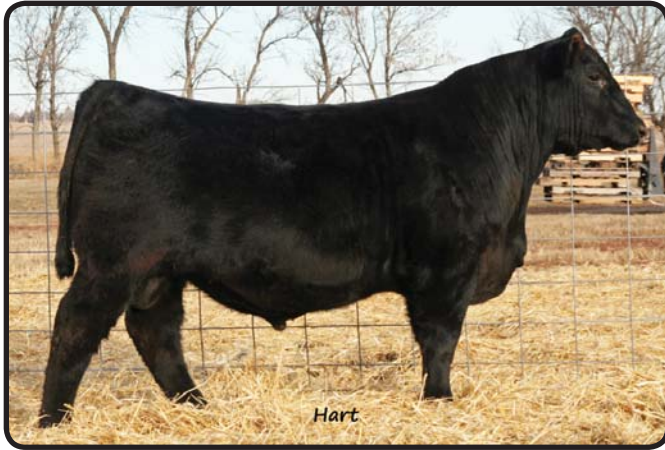
HART OPEN RANGE 7085 • LOT 40