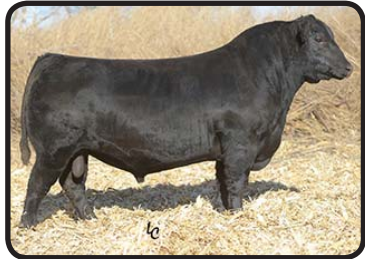
EF COMMANDO 1366 Maternal brother to the dam of lot 42