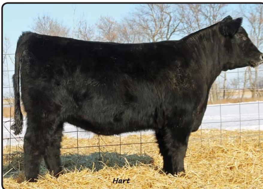
HART MISS ALICE 7021 • LOT 92