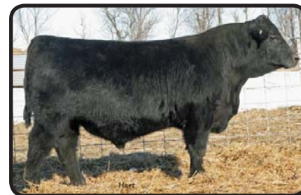
HART TEN X ET 5454

$9,500 full brother to Lot 77 selected Darin Zuehke, Britton, SD