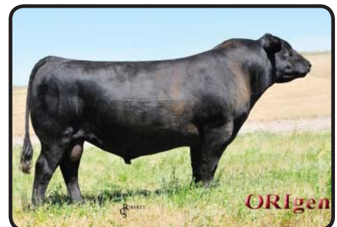
WR JOURNEY 1X74