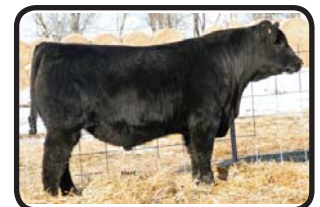
HART WAYLON ET 5462

$7,000 maternal brother to the dam of lot 68 selected by Darin Zuehlke, SD