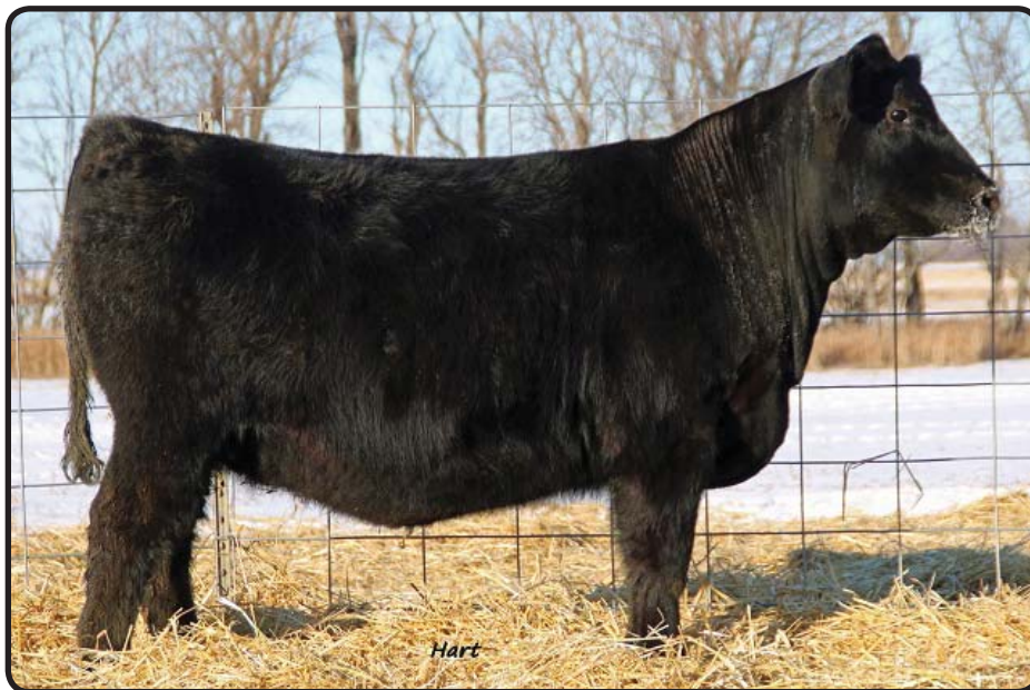
HART MISTI 7082 • LOT 95