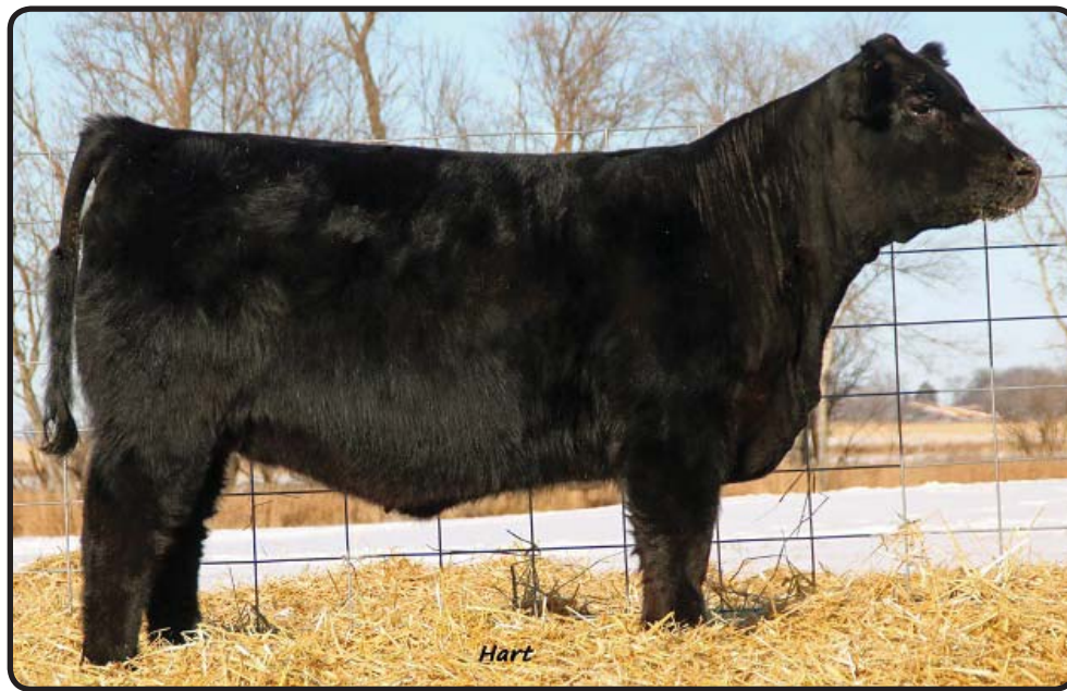
HART SANORA 7206 • LOT 93