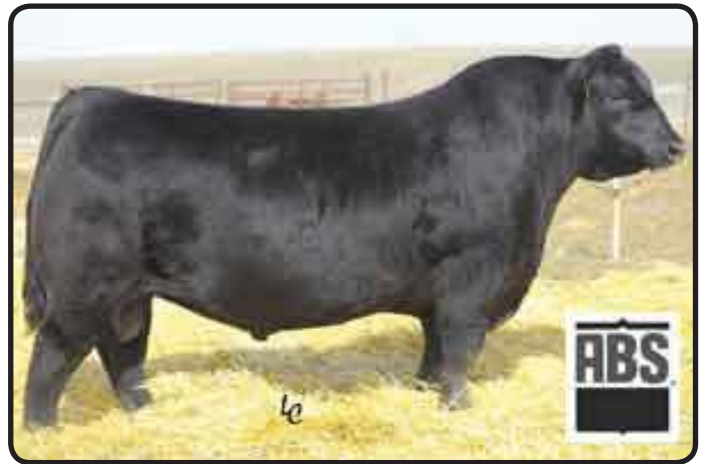
RB TOUR OF DUTY 177

• Sons sell as Lots 52 thru 55. RB Tour Of Duty 177 is the record-selling bull of the Minnesota Bull Test selected by Crouch Angus Valley who became a top-selling bull at ABS and ORigen. He stands among the top sires in the breed for BW to YW spread and may become the dominant descendant of the famed "Lady" cow family that has produced test station winners from Wisconsin to Montana and record selling females.