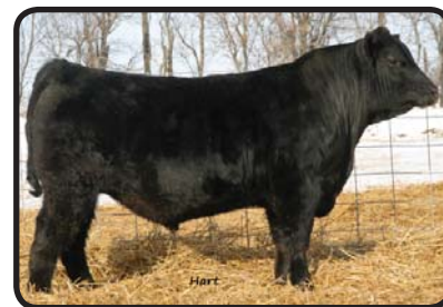
HART CONVERSION 6229 $6,000 maternal brother to Lot 41 selected by Darin Zuehlke, SD