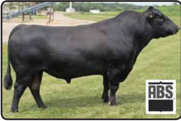
PA SAFEGUARD 021