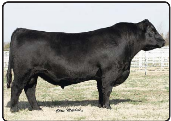
PLATTEMERE WEIGH UP K360