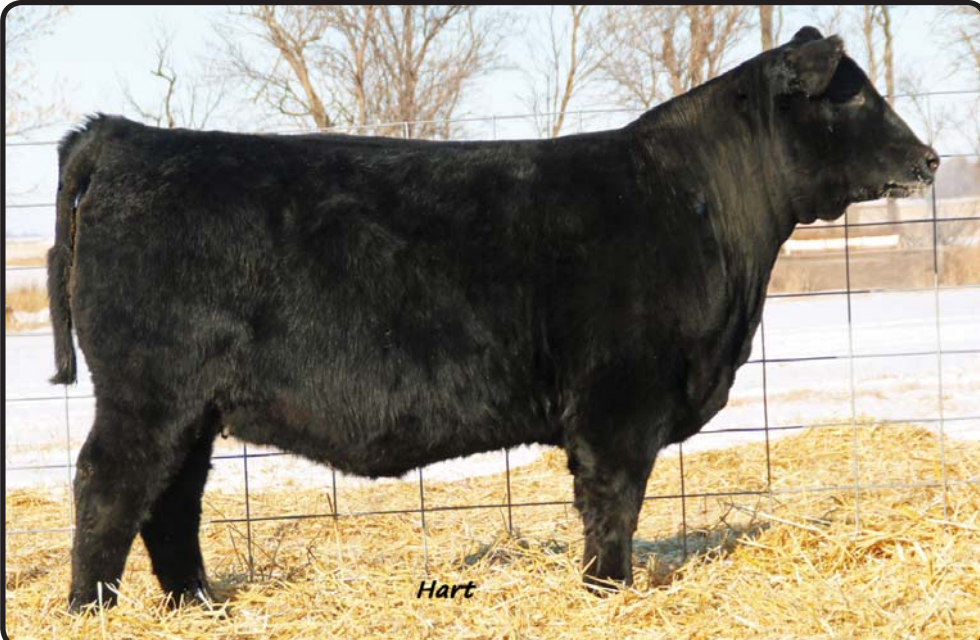
HART MISTI ET 7572 • LOT 94