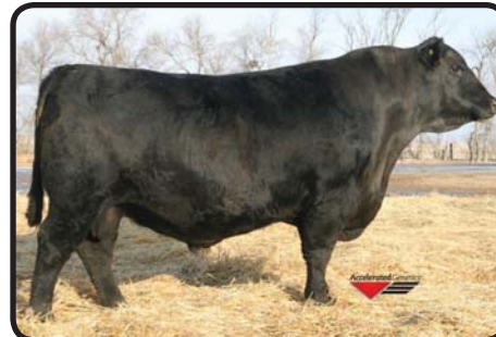
HILLTOP OPEN RANGE Maternal grandsire of lots 18 and 19