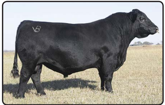
JMB TRACTION 292