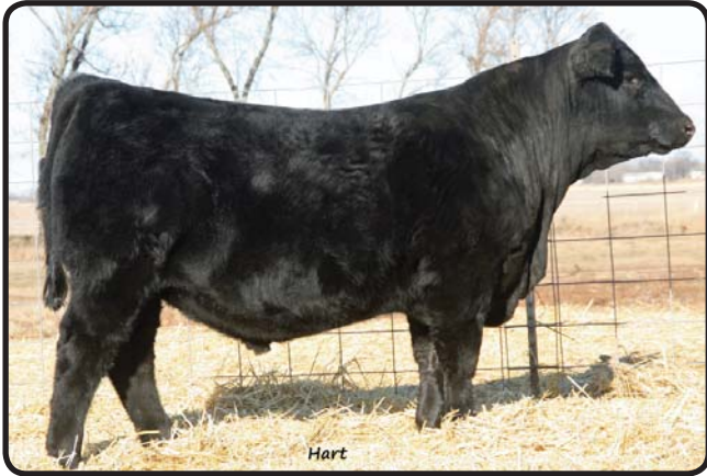
HART TOUR OF DUTY ET 7576 • LOT 52