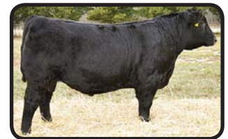
MUSGRAVE MEL Maternal sire of lot 27