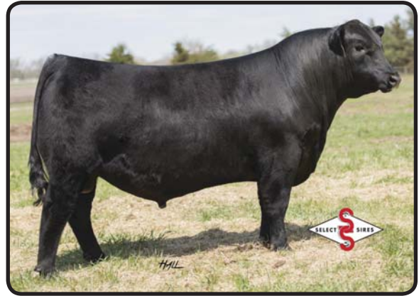
BARSTOW BANKROLL B73