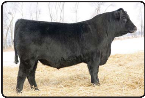
HART TEN X ET 3416

$16,500 Top selling maternal brother to Lot 12 selected by Evans Farms, TX