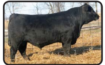
HART COMMANDO 6058

$5,000 Maternal brother to Lot 72 selected by Thor Sand, Ellendale, ND