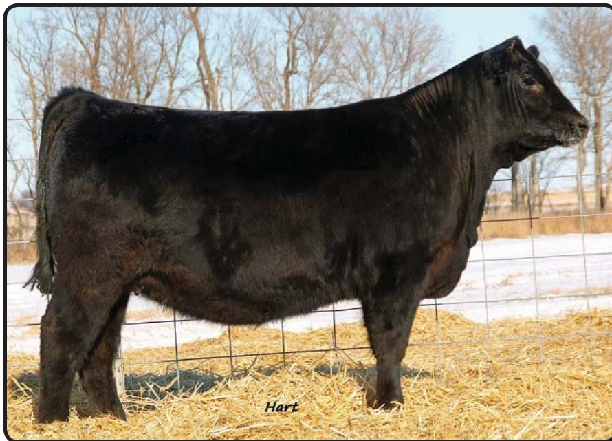
HART BLACKCAP LADY 7161 • LOT 97