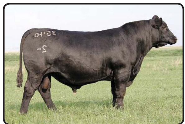
2 BAR PARTNER 3540

Donor dam to Lot 21 as a $17,000 heifer calf.