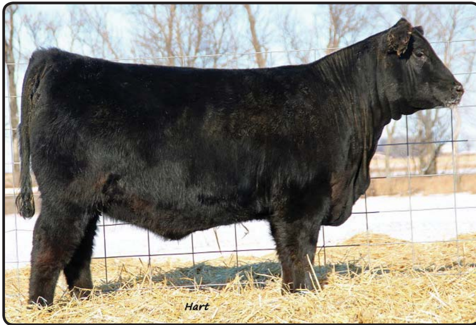
HART MISS ERICA 7203 • LOT 91