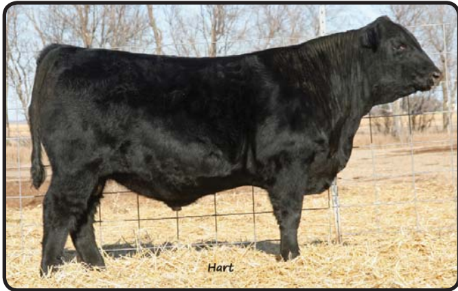
HART GENERATION ET 7568 • LOT 74