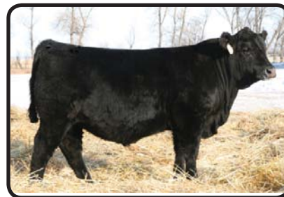
HART ICON 3356 $15,000 Maternal brother to Lots 14 and 15