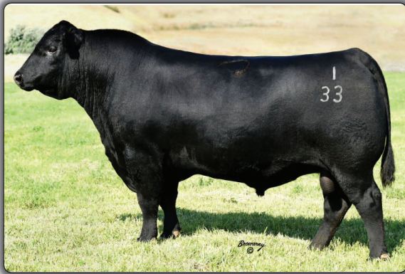
Connealy Black Granite Sire of Lot 32