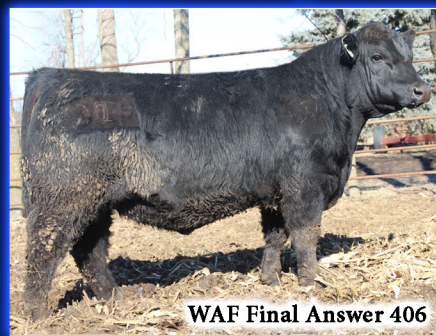
WAF Final Answer 406