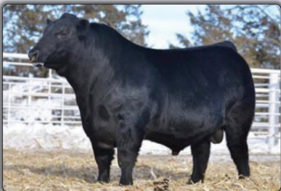
FAR Long Range Sire of Lot 33