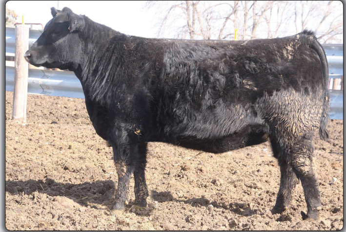
WAF Zara W729 $2300 paternal sister to Lots 29 & 30 Selected by Royal Cattle Co, IA