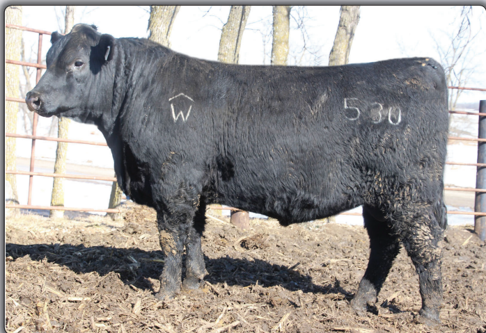
WAF Irish 530

$4800 maternal brother to Lot 24 Selected by Dennis Crall, IA