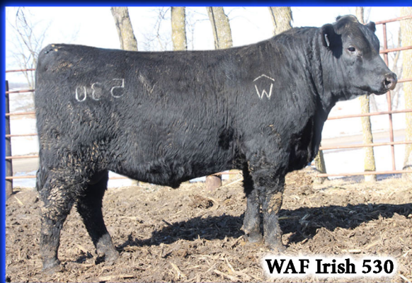
WAF Irish 530