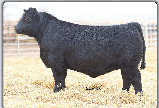
Mohnen General 548

$90,000 paternal brother to Lots 1 - 6 Sold in the 2019 Mohnen Angus Sale