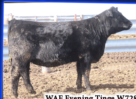
WAF Evening Tinge W728