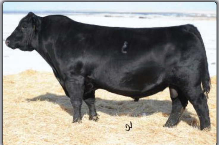
Hoover Dam Maternal grandsire of Lot 21