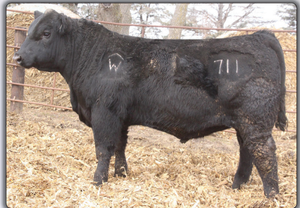
WAF Safeguard 711 $4700 maternal brother to Lot 2 Selected by Brad Wiley, IA