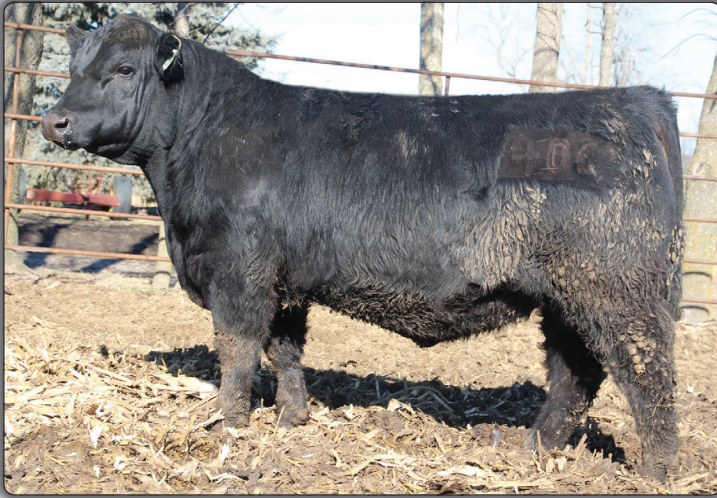
WAF Final Answer 406

Maternal brother to Lot 4 Selected by Duane Bush, IA