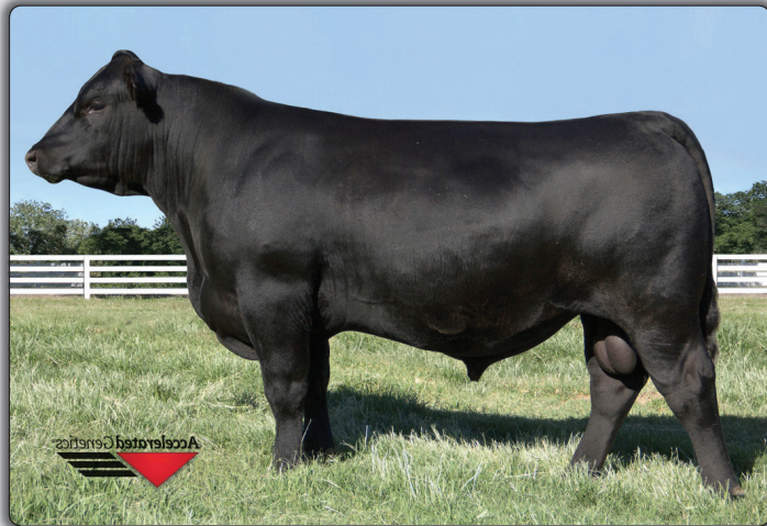
VAR Discovery 2240 Maternal grandsire of Lot 26