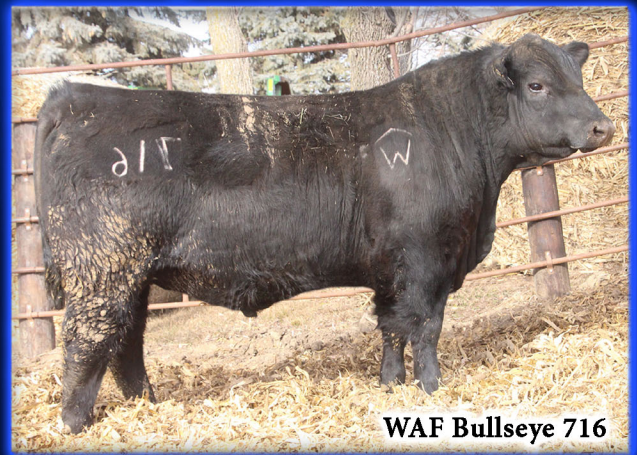
WAF Bullseye 716