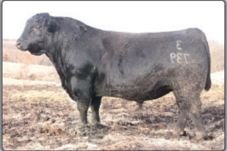
Connealy Power Tool 888A Maternal grandsire of Lot 41