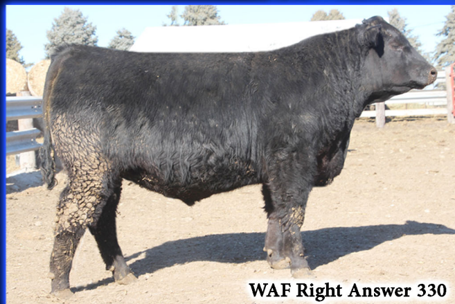
WAF Right Answer 330