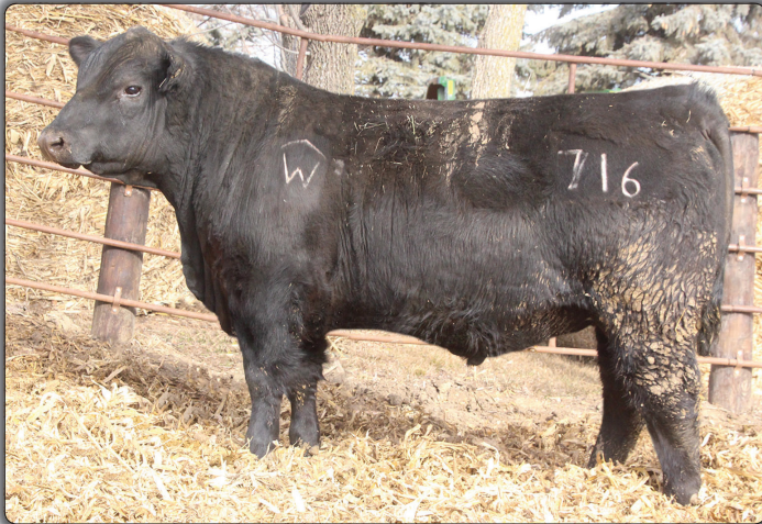
WAF Bullseye 716 $4600 full brother to Lot 29 Selected by Brad Wiley, IA