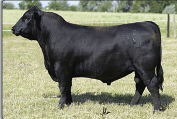
Baldrige Colonel C251