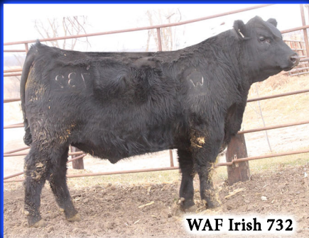
WAF Irish 732