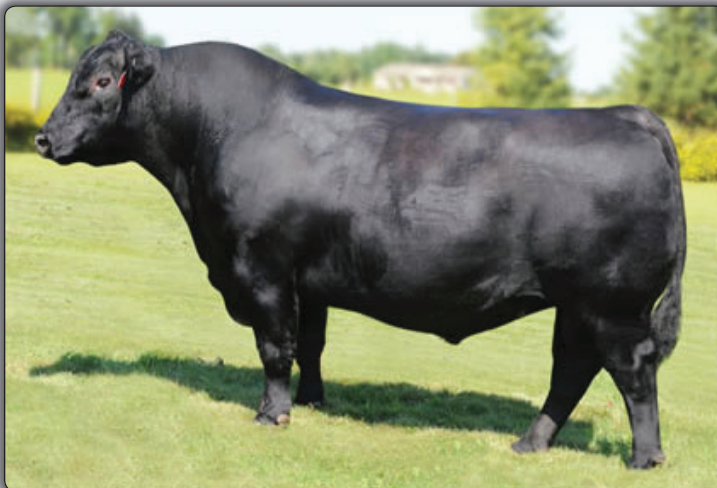
Connealy Right Answer 746 Maternal grandsire of Lot 19