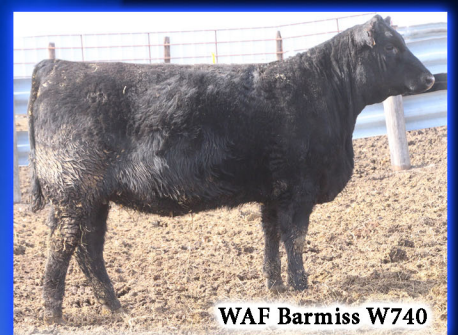
WAF Barmiss W740