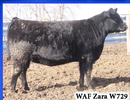
WAF Zara W729