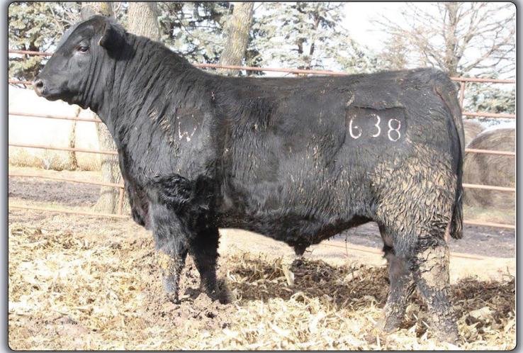
WAF Magnus 638

Maternal brother to Lot 4 Selected by Duane Bush, IA