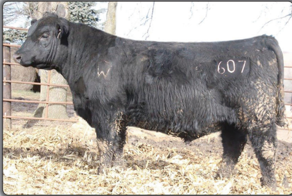
WAF Discovery 607 $4900 second-top selling maternal brother to Lot 32 Selected by David Robinson, IA