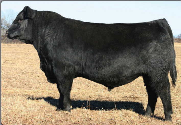
Mogck Bullseye Sire of Reference sire G