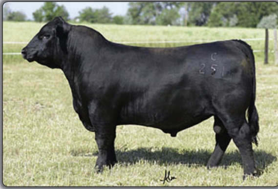
Baldridge Colonel C251 Sire of Lot 31