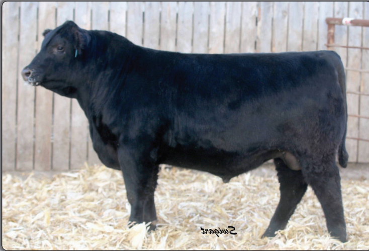
PA Commando 684 Sire of Lots 39 - 41