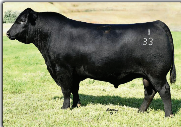
Connealy Black Granite