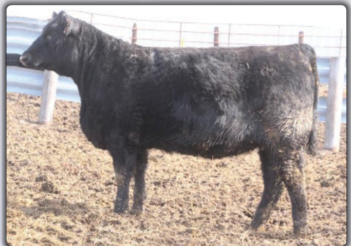
WAF Barmiss W740 Lead-off heifer in the 2018 sale. Heifers of this quality sell again.