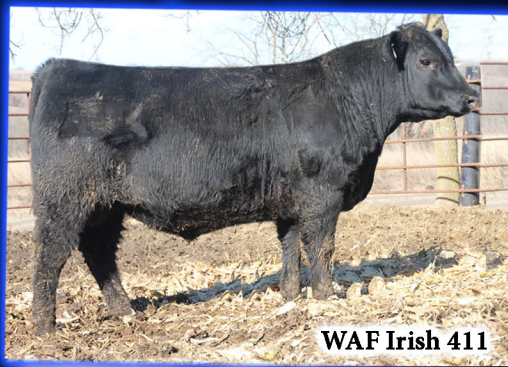
WAF Irish 411