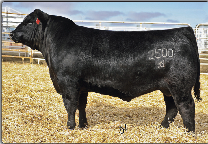
PA Fortitude 2500