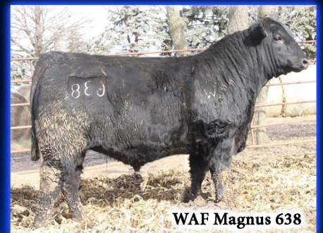
WAF Magnus 638