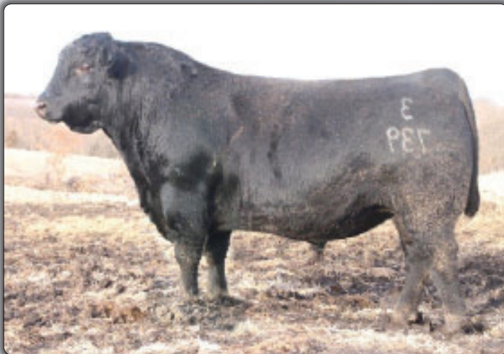
Connealy Power Tool 888A