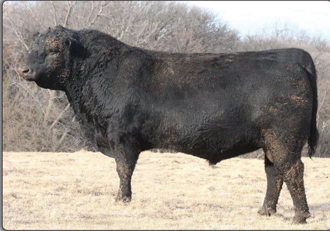
TC Irish 2117