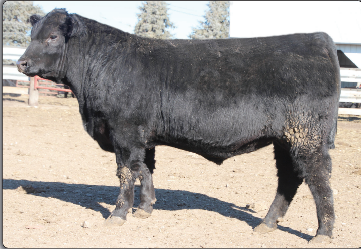
WAF Hoover Dam 334 $6000 maternal brother to Lot 7 Selected by Oswald Ranch, IA