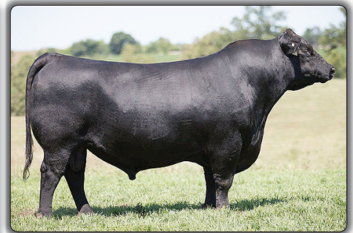
GAFFNEY GAME CHANGER 371 Sire of Lot 40