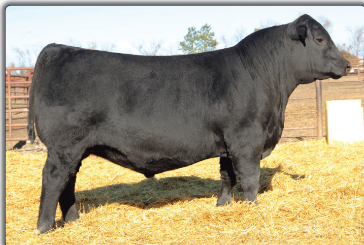
S A V RUSTLER 2891 Reference Sire B