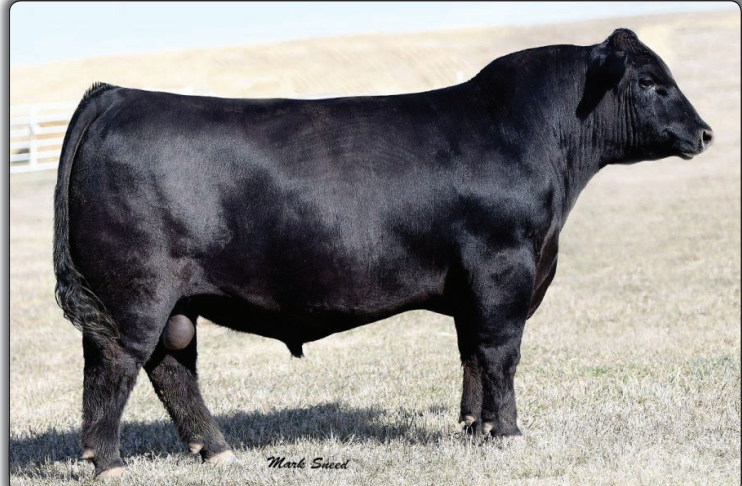
KR ABUNDANT 4948 Reference Sire F

KR Abundant 4948 was the $50,000 top-selling bull of the 2016 Krebs Ranch Bull Sale. He is regarded as the first son of the rare and valuable Barstow Cash to surpass his sire in quality and eye appeal. Abundant bested his contemporaries with individual performance featuring a BWR 98, WWR 112 and YWR 114.