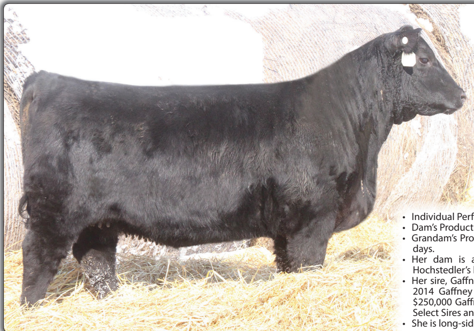
TRAILS END EPPONIA 852 • LOT 40