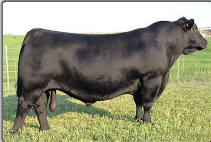
S A V RENOWN 3439 Reference Sire C