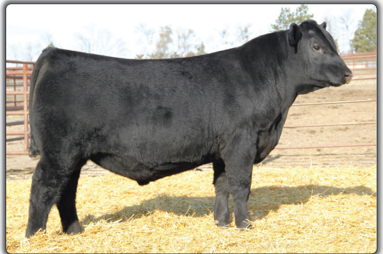
SAV STRATTON 1469 Sire of Lot 58