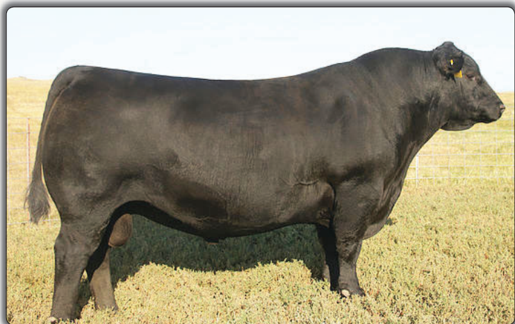
SAV SEEDSTOCK 4838 Sire of Lot 23