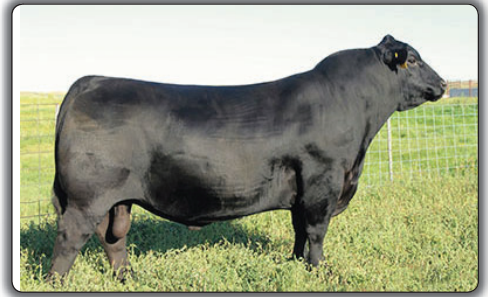
SAV CUTTING EDGE 4857 Sire of Lots 32 & 33