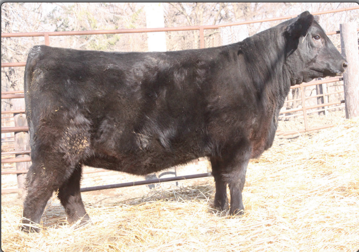
TRAILS END ERICA ENERGY 762 $3250 maternal sister to the dam of lot 18