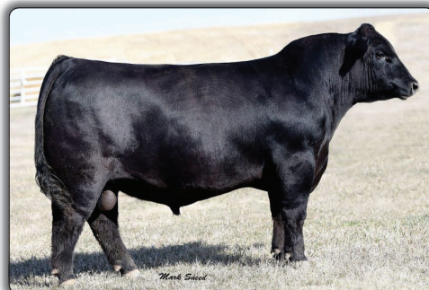
KR ABUNDANT 4948 Sire of Lots 28 & 30