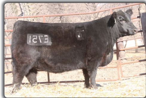
TRAILS END LUCY E751 $9000 full sister to lots 32 and 33 selected by Zeb Evans, IA