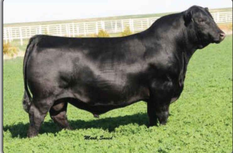
PRAIRIE PRIDE NEXT STEP 2036 Reference Sire E

Prairie Pride Next Step 2036 garnered national attention when he topped the 2013 Prairie Pride Sale at $37,000 2/3 interest where he posted individual performance of BW 81 lbs, BWR 99, 205 day wt 1006 lbs, WWR119, 365 day wt 1600 lbs, YWR 118 and a yearling REA 17.3, RE ratio 115. Next Step may well be the dominant and logical substitution for the deceased sire, SydGen 928 Destination 5420 "Whiskey" in captivity.