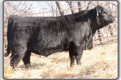
TRAILS END VISION 757 $4000 maternal brother to lot 26 selected by Hershcel & Rachel Yoder, Kalona, IA