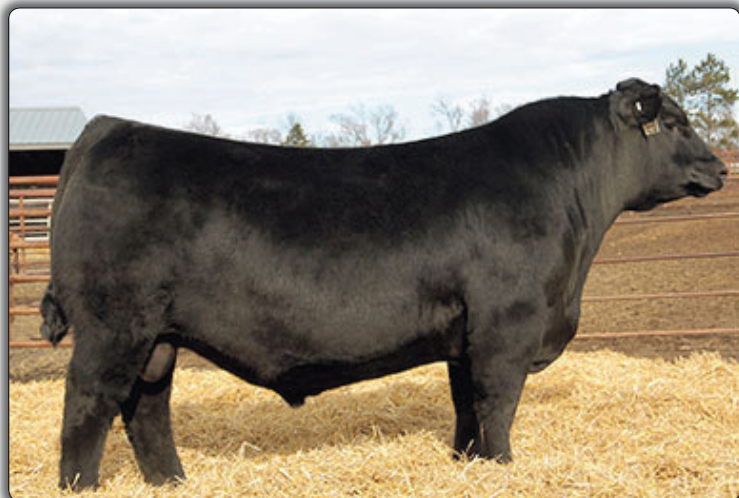
S A V SENSATION 5615 Reference Sire A