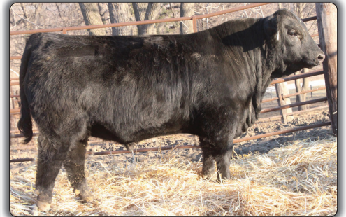
TRAILS END SENSATION 729 Maternal brother to lot 27 selected by Brown's Angus Farm, IA