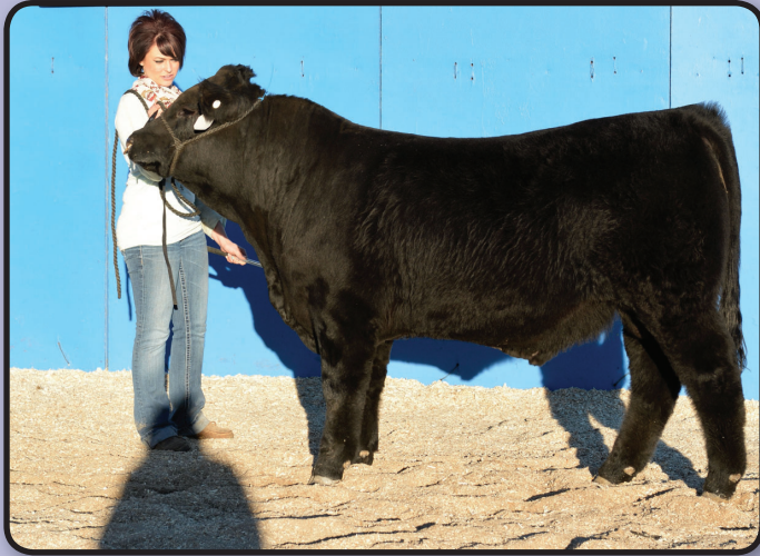
PCSL ALADDIN Sire of reference sire I