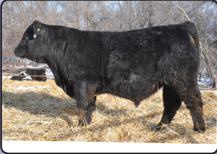
BODINES WESTSTAR C120