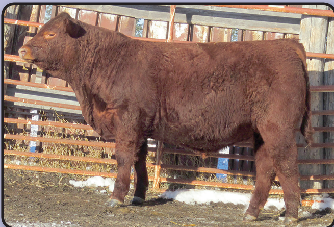
KEYS CRUISER 105C