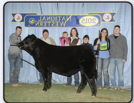
SKF BLK PLD SUIT 'N TIE Maternal grandsire of Lot 1