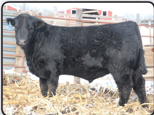
TSB BOOMER 97B $5500 Maternal brother to Lot 32 Selected by Jeff Tolsma, SD