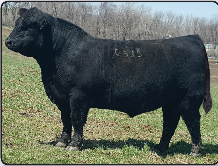
WARD CHISUM C535 Sire of Lots 57 & 58