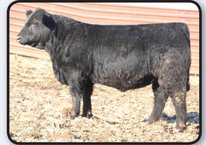
TSB BARTENDER 10D $3500 Maternal brother to Lot 8 selected by J&D Cattle, WY