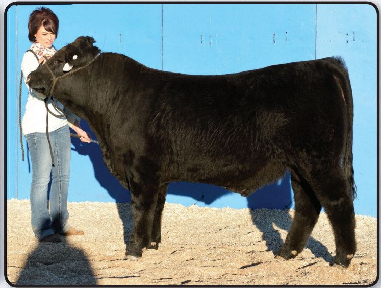
PCSL ALADDIN Grandsire of Lots 55 - 56