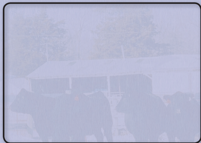
BIG SKY DOCUMENT 14D