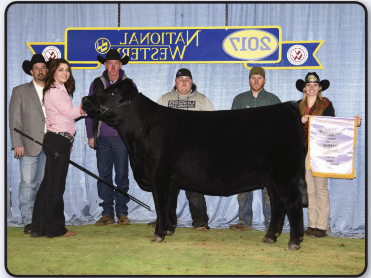
TSB MADISON 115 C Reserve Junior Show Champion Heifer at the 2017 NWSS - selected at the 2016 TB Salers Sale