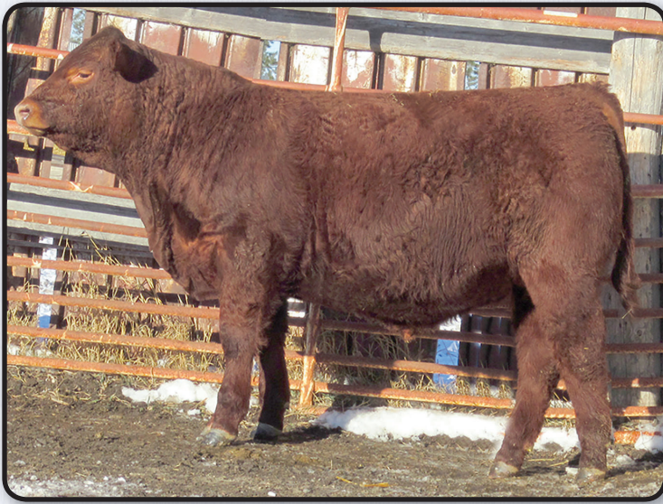
KEYS CRUISER 105C Sire of Lots 52 - 53