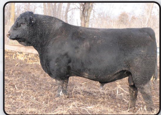
KEYS LONGSHOT 1Z Sire of Lots 46 - 48