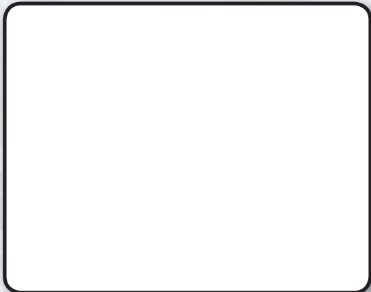
BIG SKY DOCUMENT 14D Sire of Lots 49 and 50