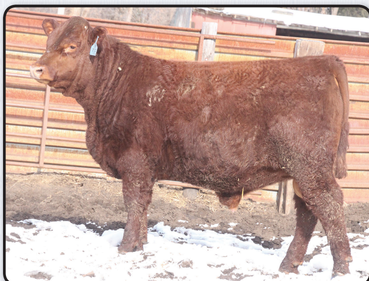
TSB RED MAN 3F • Lot 28