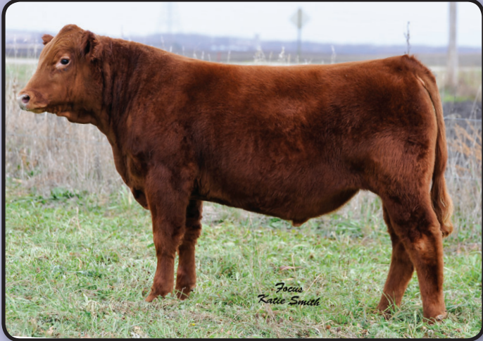
KKCC REVELATION 401B