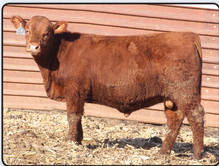
TSB FABULOUS 45F • LOT 26