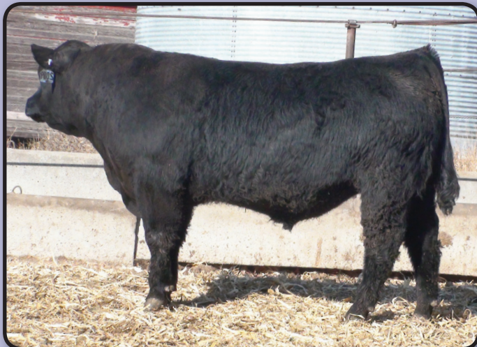
MAC F1 BARRY 36B