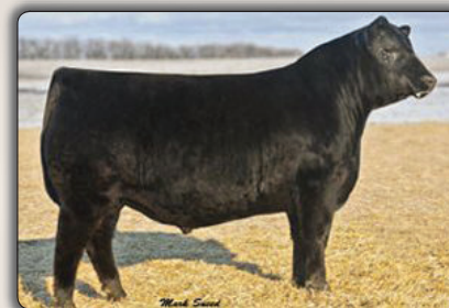
EATHINGTON SUB-ZERO Sire of Lot 18