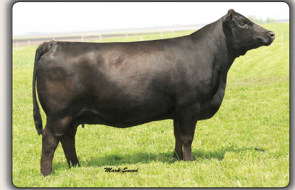
YON HAZEL T154 Grandam of Lots 31A and 31B