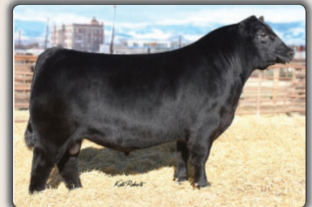
MUSGRAVE SKY HIGH 1535 Sire of Lots 31A and 31B