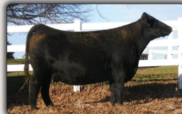
JAF ERICA OF FAF 1120 Dam of Lot 1A, 1B and 2