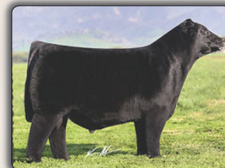
COLBURN PRIMO 5153 Sire of Lots 1A and 1B