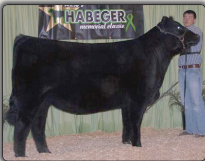
SCC ECHO DELL NELLIE 810 Donor dam of Lots 26A, 26B, and 26C