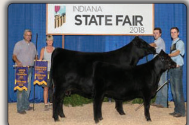
HENDERSONS PATTON QUEEN 6044 Maternal sister to Lots 20A and 20B