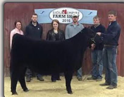
GREIMANS ROYAL BLACKBIRD 15 $15,000 dam of Lot 28 Selected by Jorli Hauge, MN