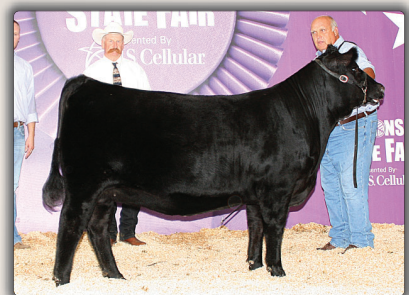
WAF BARBARA 101 $23,000 Maternal sister to Lots 7, 8 and 9