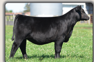
GREIMANS PROVEN QUEEN 175 $25,000 full sister to the dam of lots 20A and 20B and a full sister to lots 23A to 23C Selected by Belle Point Ranch, AR