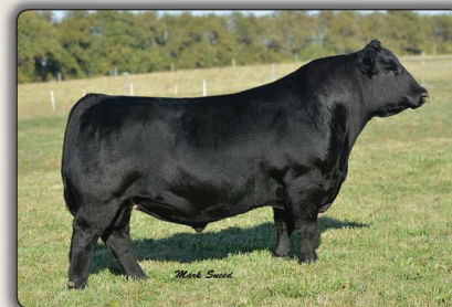
PVF INSIGHT 0129 Service sire of Lots 17 and 18