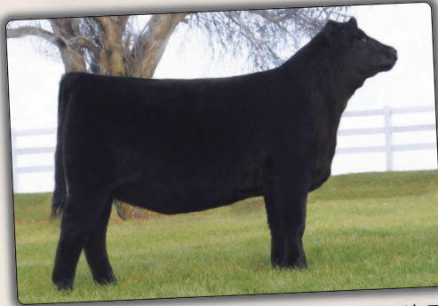
JENSEN GEORGINA 1569 OF FAF Past Sale Highlight. Purchased by South River Genetics, OK