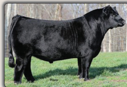
HB GUYMAN 485 Sire of Lot 6