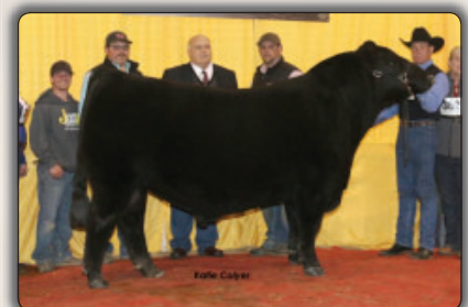
DAJS SPECIAL EFFECTS 044 Sire of Lot 16