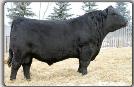
BSF HOT LOTTO 1401 Sire of Lot 15