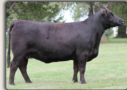
CHAMPION HILL GEORGINA 7229 Donor dam of Lots 11 and 12