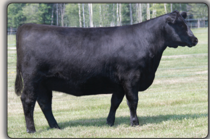
LCCC ANNIE K 1444 ET Maternal sister to Lots 13 and 14 at Little Cedar Cattle Co