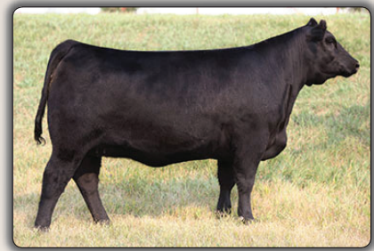
SOO LINE ANNIE K 1008 Donor dam of Lots 13 and 14