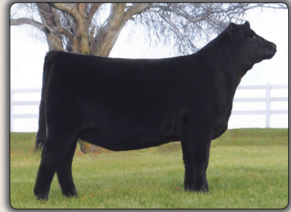
JENSEN GEORGINA 1569 OF FAF $35,000 Maternal sister to Lots 11 and 12