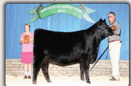
CHAMPION HILL GEORGINA 8028 Donor dam of Lots 10A and 10B