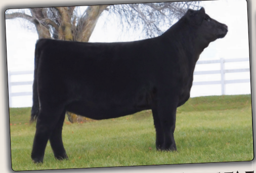
JENSEN GEORGINA 1569 OF FAF Past Sale Highlight. Purchased by South River Genetics, OK