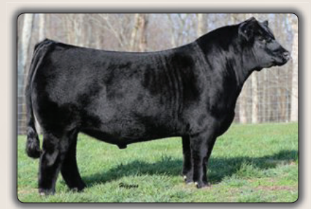
HB GUYMAN 485 Sire of Lot 6