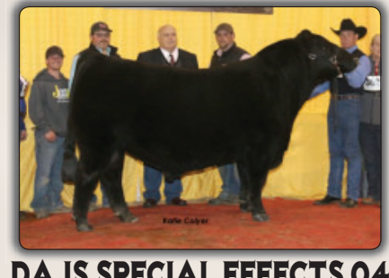
DAJS SPECIAL EFFECTS 044 Sire of Lot 16