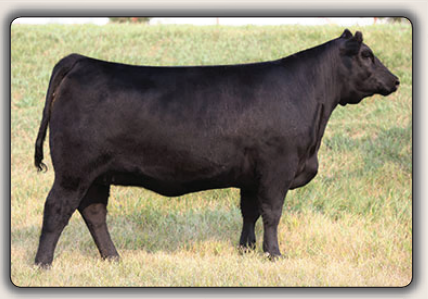
SOO LINE ANNIE K 1008 Donor dam of Lots 13 and 14