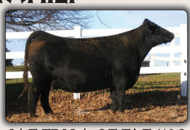
JAF ERICA OF FAF 1120 Dam of Lot 1A, 1B and 2