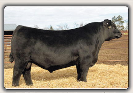
SAV SENSATION 5615 Service sire of Lot 8