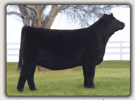
JENSEN GEORGINA 1569 OF FAF $35,000 Maternal sister to Lots 11 and 12

Individual Performance: BW 78 lbs, 205 Wt. 679 lbs, (ET) with 15 contemporaries.