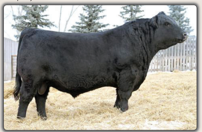
BSF HOT LOTTO 1401 Sire of Lot 36 and Service sire of Lots 37, 38, and 40.

Service sire, Marda Blacksmith 683 was the $24,000 sensation of the 2017 National Western Angus Bull Sale now featured in the ORIgen directory. Blacksmith combines a double-digit CED with WW, EPD, YW EPD, RE EPD, $W and $F values in the elite top 1% of Angus sires. His grandam, SAV Blackcap May 1443 is a full sister to SAV Resource and SAV Renown descending from the $6 million producing Blackcap may 4136