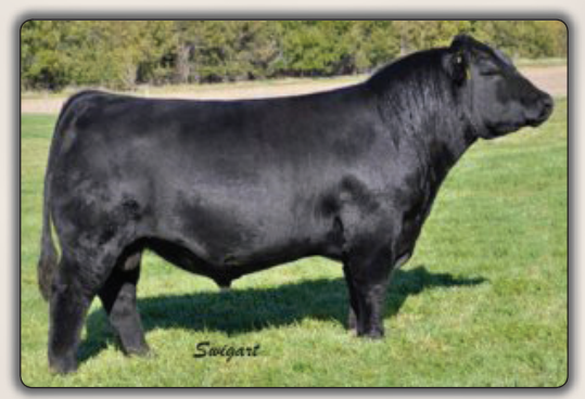
SCC FIRST-N-GOAL GAF 114 Full brother to SCC Royal Blackbird GAF 112

SCC TRADITION OF 24 Grand Champion Bull of the 2016 NJAS and maternal brother to Lots 29 and 30.