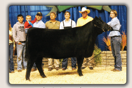
JAF ERICA 819 Grandam of Lots 1A, 1B and 2

Individual Performance: BW 84 lbs, 205 Wt. 649 lbs, (ET) with 1 contemporary. Dam's Production: NR 4@108, YR 1@111.