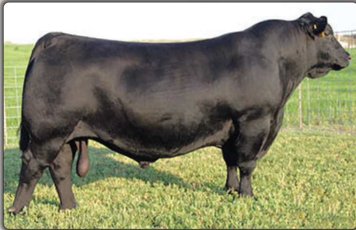
SAV Renown 3439 Sire of Lots 15&16