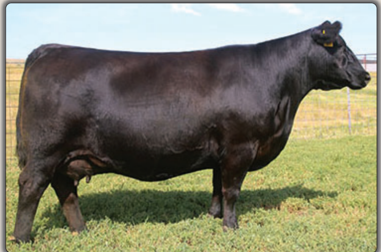
SAV Madame Pride 1134 Paternal grandam of Lots 12&14