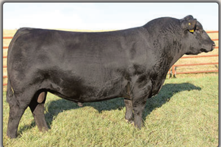
SAV International 2020 Maternal grandsire of Lot 10