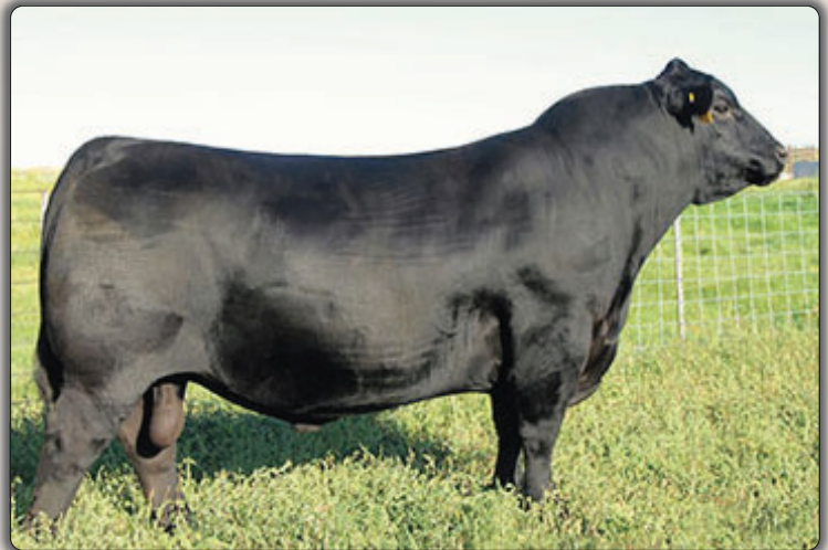
SAV Cutting Edge 4857 Sire of Lot 7