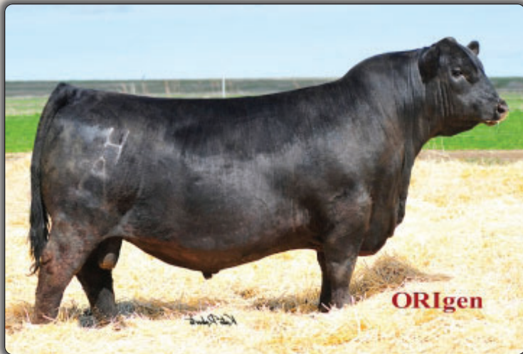
HA Cowboy Up 5405 Sire of Lot 4