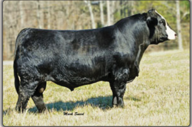
SAV Allegiance Y802 Sire of Lot 13, maternal grandsire of Lots 12 & 14