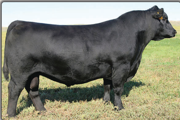
SAV Seedstock 4838 Sire of Lot 3