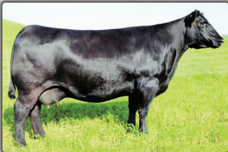
SAV Blackcap May 4136 Paternal grandam of Lots 1,3,5,6,15 & 16