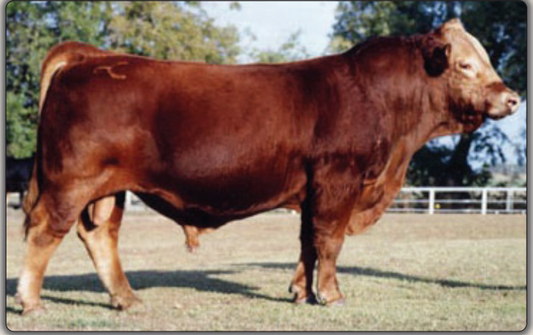
Fosters L017 ET Maternal great grandsire of Lots 15&16