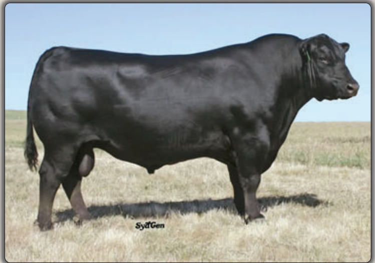
SydGen CC&7 Sire of Lot 11