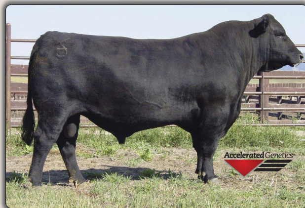
AAR Ten X 7008 SA Sire of Lot 2