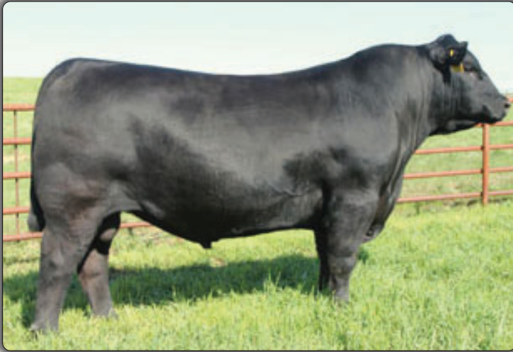
SAV Ten Speed 3022 Sire of Lots 12 & 14