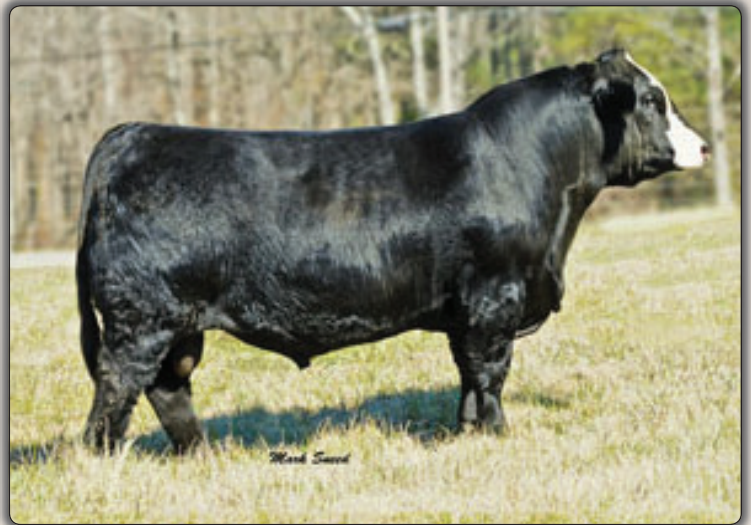
SVF Allegiance Y802 Sire of Lots 10, 11 and 12