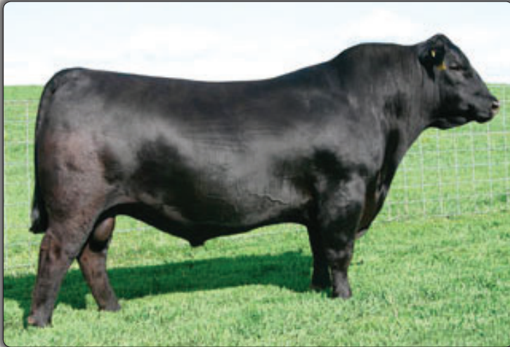
SAV Bismarck 5682 Grandsire of Lot 14 and Sire of Lot 15