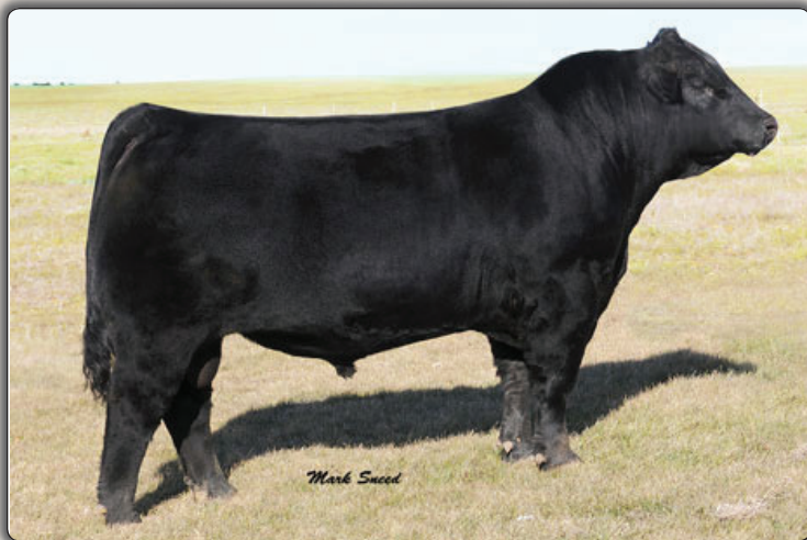
Koupals B&B Identity Sire of Lot 1