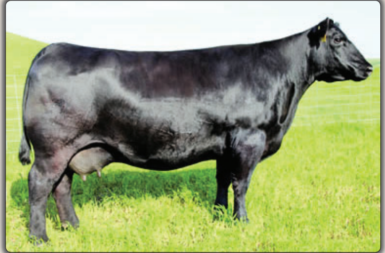
SAV Blackcap May 4136 Paternal grandam of Lots 2, 3, 4, 9 and 16