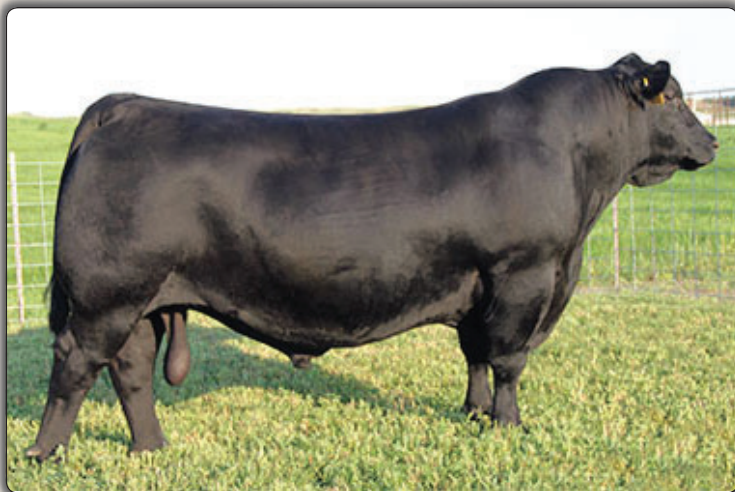
SAV Renown 3439 Sire of Lots 2, 3, 4, 9, 9A and 16