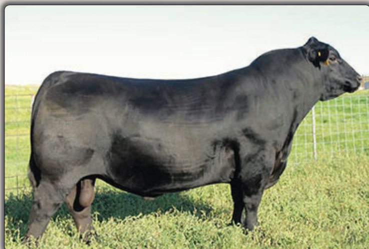
SAV Cutting Edge 4857 Sire of Lots 5 and 8