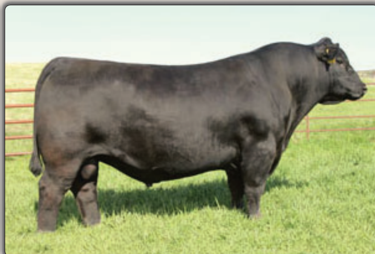
SAV West River 2066 Sire of Lot 7