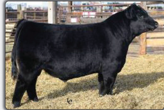
BSF Hot Lotto 1401 Reference Sire M