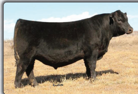
DL Dually Sire of Lot 53