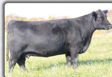
MM Rita 9412 Dam of lot 28