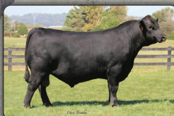
EXEC Mr Crossfire 6P01 Sire of Lot 26