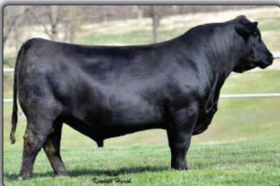
Jacs Rare Find 6503 Sire of lots 105A and 116A