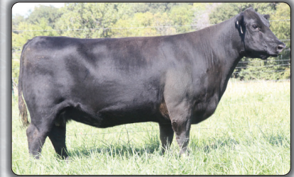
Panther Cr Esther 3137 Grandam of lots 45 to 48