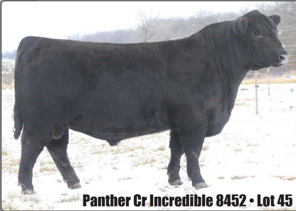
Panther Cr Incredible 8452 • Lot 45