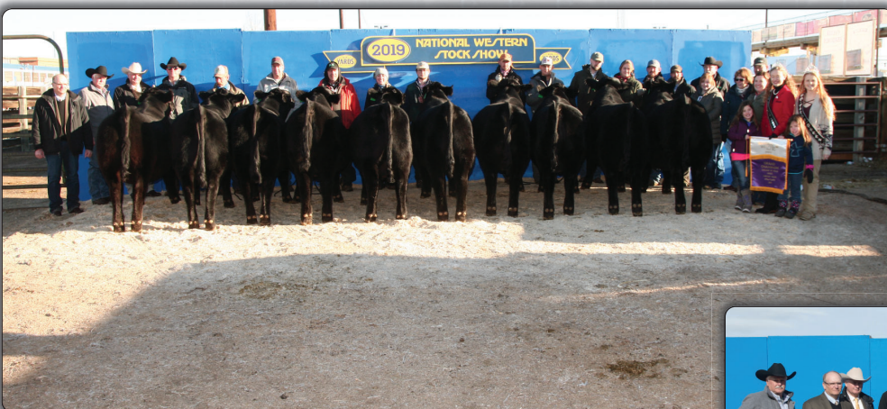
2019 NWSS Grand Champion Carload Krebs Ranch, NE