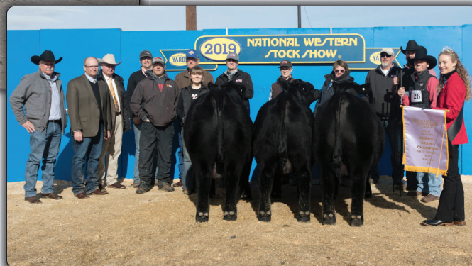
2019 NWSS Reserve Grand Champion Pen of 3 Bush Angus, SD