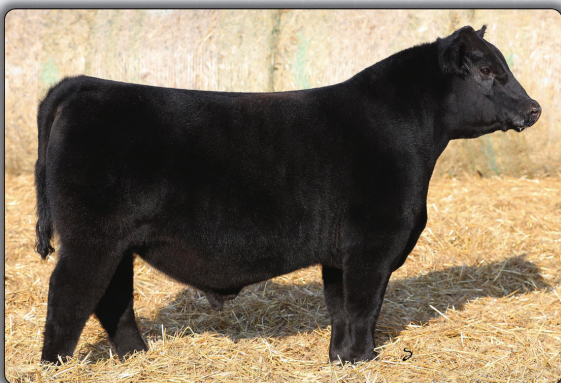
HB Identified 876 Reference Sire E