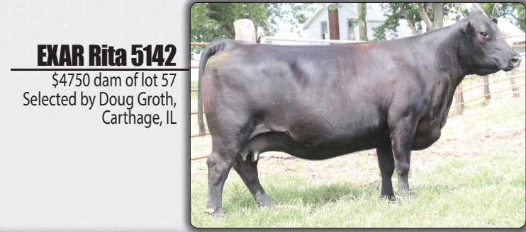
EXAR Rita 5142 $4750 dam of lot 57 Selected by Doug Groth, Carthage, IL