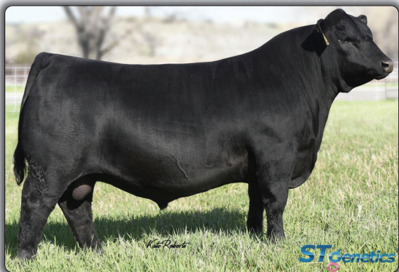
SAV Raindance 6848 Reference Sire G