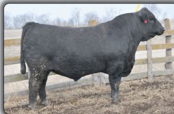
Peterson Final Product 2403 Sire of Lot 33