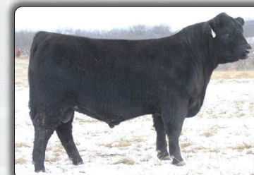
Panther Cr Incredible 9088 Son of Reference Sire A that sells as Lot 2