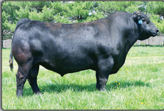
LD Capitalist 316 Reference Sire L