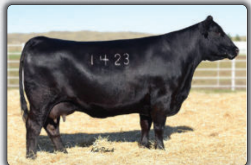
WK Queen 1423 Paternal grandam of Reference Sire C