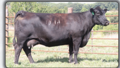
KR Lady Trend 6101 $4500 dam of Lot 56 Selected by Jim Schlager, Canton, MO