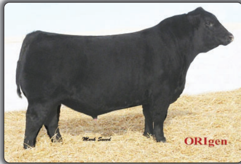
RB Active Duty 010 Sire of BSF Deployed 1706 The service sire of numerous cows selling