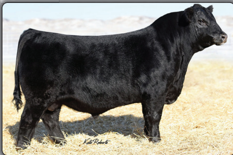
KR Leader Sire of Lot 32