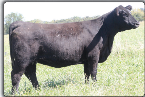
Panther Cr Miss 825 $5000 maternal siter to lot 132 Selected by Cody Zeek, Havanna IL