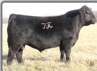
Panther Cr Incredible 8214 $19,000 maternal brother to Lot 31 Selected by RJ Petersek, Colombe SD