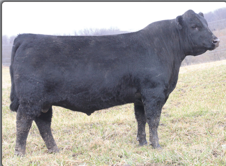
Panther Cr Synergy 9025 • Lot 24