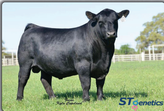
MGR Treasure Reference Sire N