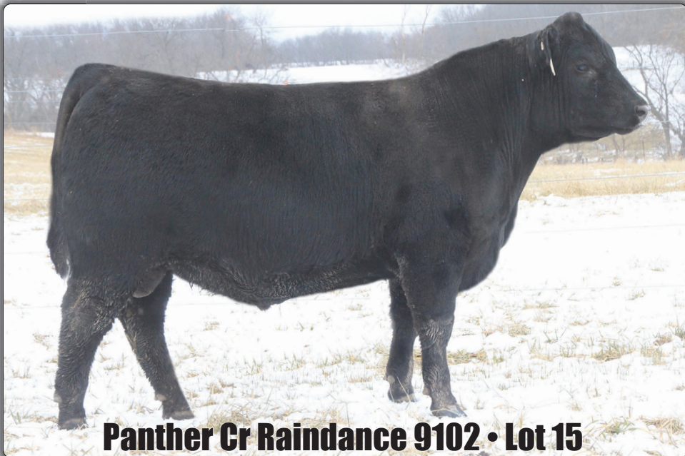
Panther Cr Raindance 9102 • Lot 15