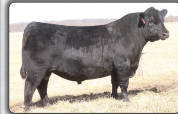
Panther Cr Invision 7536 $6500 maternal brother to lot 50 Selected by Leland Ragan, Barry IL