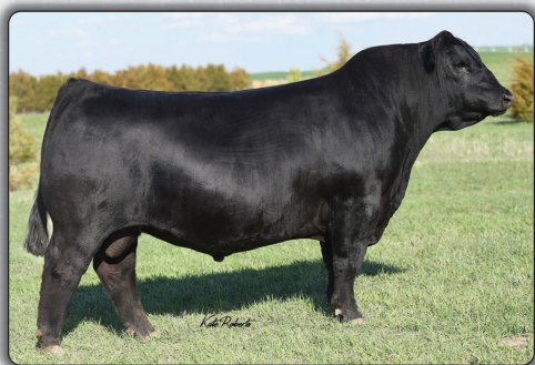
7/S Splash 415 Sire of Lot 56