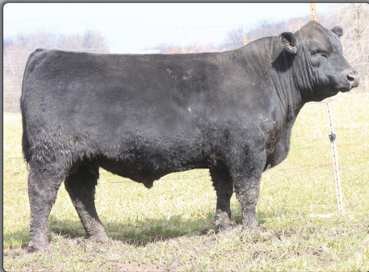
Panther Cr Synergy 9037 • Lot 23