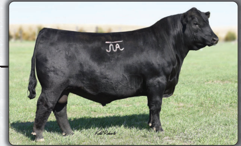
Panther Cr Incredible 6704 $70,000 full brother to lot 30