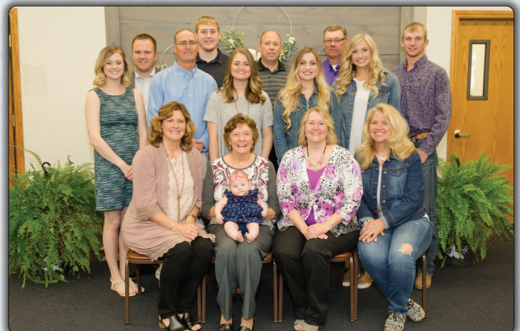
The whole family together on Mothers Day