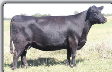
Panther Cr JH Blackbird 409