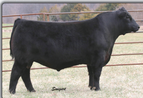
Musgrave Top Gun 1551 Reference Sire K

The $33,000 overwhelmingly popular high-selling bull of the 2015 Musgrave Angus Sale. Selected by Panther Creek Ranch after he posted a WWR 117 and YWR 111 with calving ease credentials. Semen available through Cattle Visions.