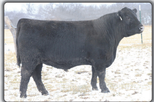
Panther Cr Synergy 9036 Son of Reference Sire B that sells as Lot 22