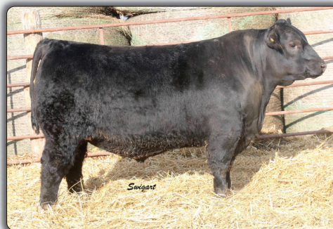
Hobbs Comrade 87Y-31D Sire of lots 108A and 113A