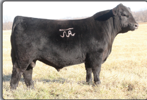
Panther Cr Incredible 8214 $19,000 service sire of lots 133 and 136