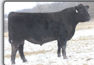
Panther Cr Incredible 9027 Son of Reference Sire A that sells as Lot 1