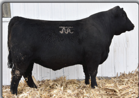
Peteron F Product 6728 $7000 maternal brother to lot 101