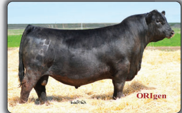
HA Cowboy Up 5405 Sire of Lot 57