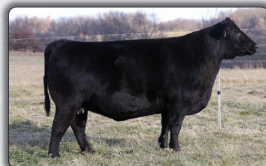
Panther Cr JH Blackbird 221