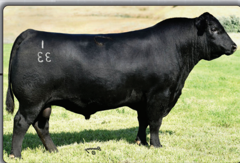
Connealy Black Granite Sire of Lot 35