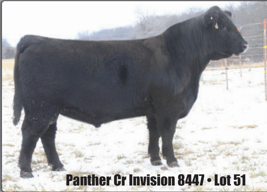
Panther Cr Invision 8447 • Lot 51