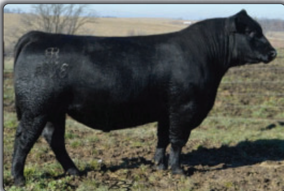
RB Night Prowler 3288 Sire of Reference Sire O