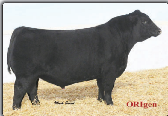
RB Active Duty 010 Sire of reference Sire D