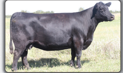
Panther Cr JH Blackbird 409 $10,000 1/2 interest dam of lot 51