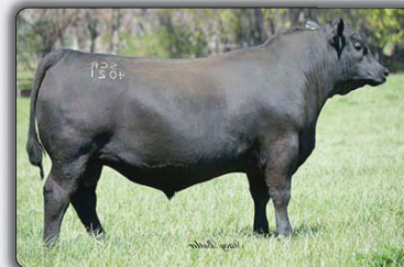
Spring Cove Reno 4021 Sire of lot 27