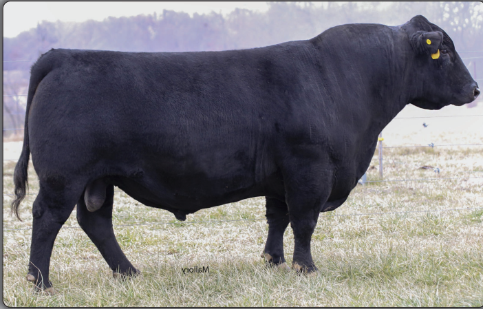
Musgrave Invision Sire of Lots 30 & 31