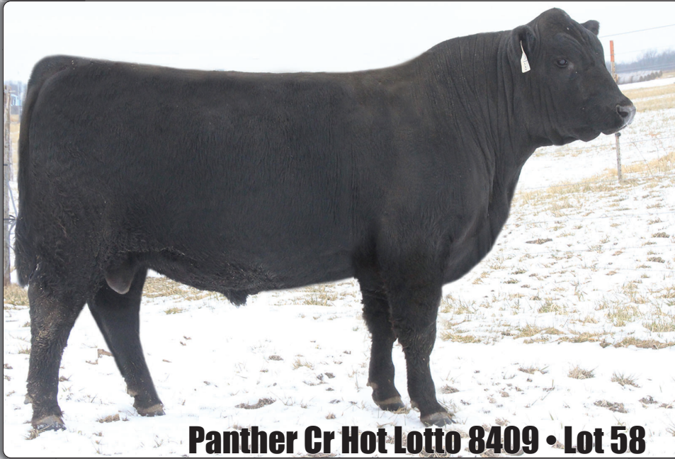
Panther Cr Hot Lotto 8409 • Lot 58