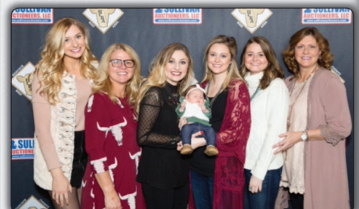
All of the PCR women at the Hancock County Cattlemen's Ball