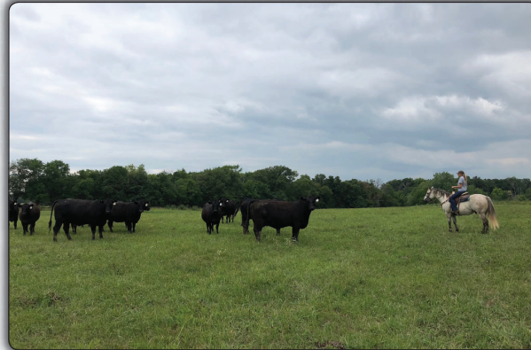
Kolby and JJ checking cattle