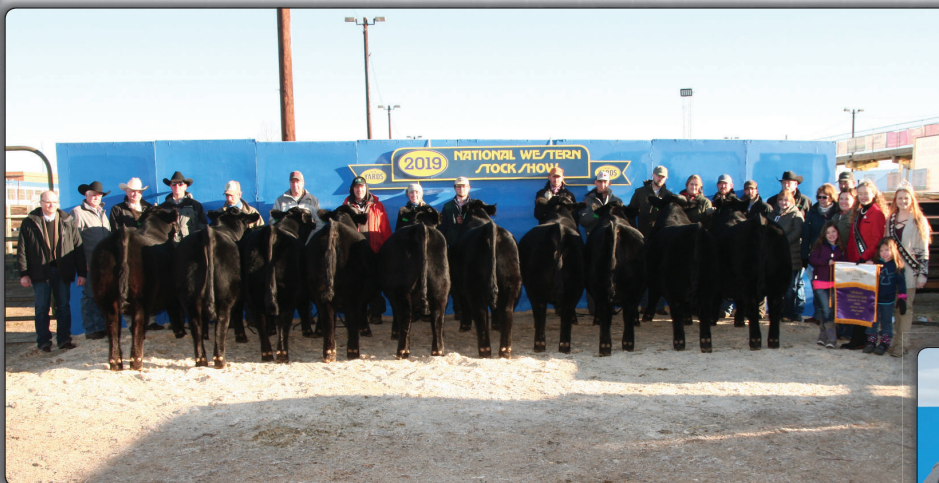
2019 NWSS Grand Champion Carload - Krebs Ranch