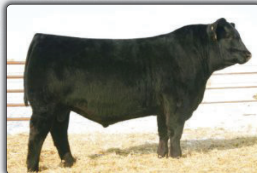
SAV Thunderbird 9061