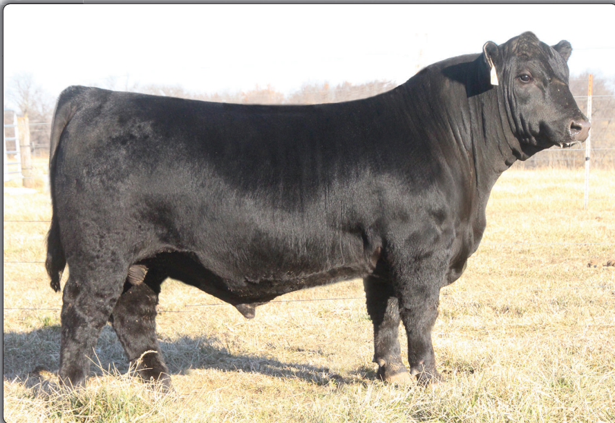
Panther Cr Armory 8203 • Lot 20