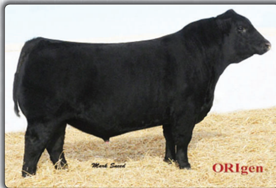
RB Active Duty 010 Sire of Reference Sire K

Deployed was selected by Panther Creek Ranch as the $12,000 feature of the 2018 North Dakota Angus association Bull & Female Sale offered by Becker Stock Farm where he posted a BW 83 lbs, BWR 94, WW 902 lbs and WWR 112. His mother is a full sister to BSF Hot Lotto and he is sired by the now-deceased Active Duty. He ranks in the elite top 1% for WW and YW EPDs, as well as $W index.