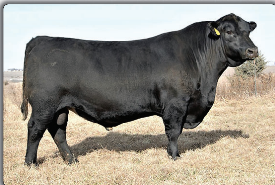
Connealy Armory Reference Sire I