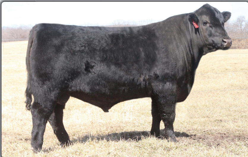
Panther Cr Invision 8292 • Lot 37