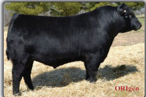
Musgrave Aviator Maternal grandsire of lot 13