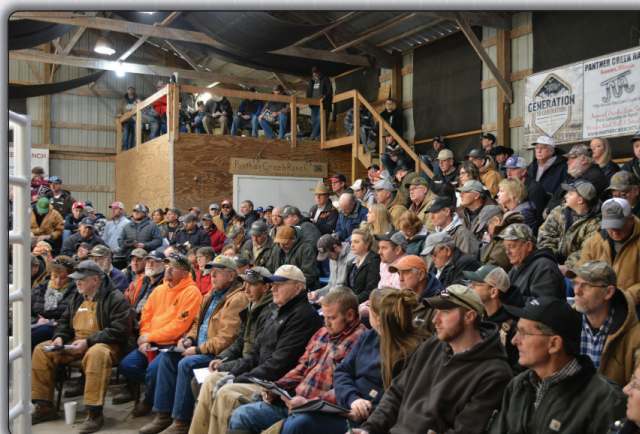
Thanks for showing up in 2018 and hope to see you April 6th