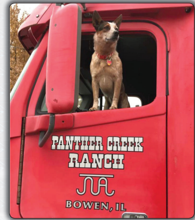
"Hoyt" is on duty!