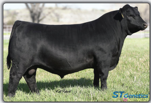
SAV Raindance 6848 Reference Sire R

• SAV Raindance 6848 stems from one of the most dynamic flushes in SAV history when the outcross maternal sire, Coleman Charlo 0256 was mated to the immortal SAV Blackcap May 4136 dam of SAV Resource. This mating yielded the four high-selling bulls of the 2017 SAV Sale totaling over $2 million and averaging $523,750.