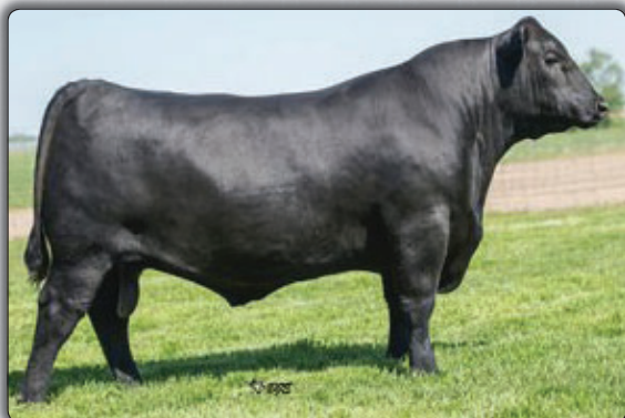
SS Niagara Z29 Reference Sire G