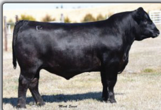
Baldrige 38 Special Reference Sire M

Baldrige 38 Special was the $100,000 selection of Hoover Angus and Alta Genetics from the 2016 Baldrige Bros Sale. He is among the "Great Eight" sons of Baldrige Isabel Y69 who, a year later, produced the $580,000 Baldrige Colonel C251. 38 Special has an incredible 50K profile of CED 8, BW 6, WW 5, YW 16, CW 13, Marb 28, RE 13 and Tend 22.