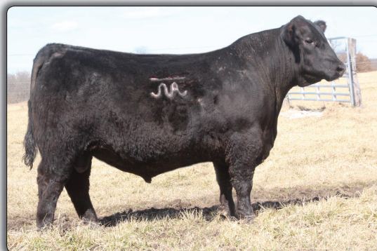
Panther Cr Sky High 8236 Maternal brother to lot 106 that sells as lot 10