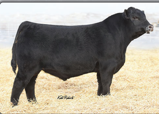
KR Status 7271 Reference Sire D