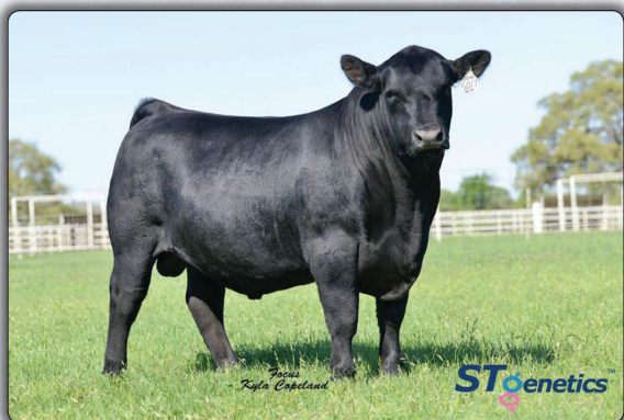
MGR Treasure Reference Sire H