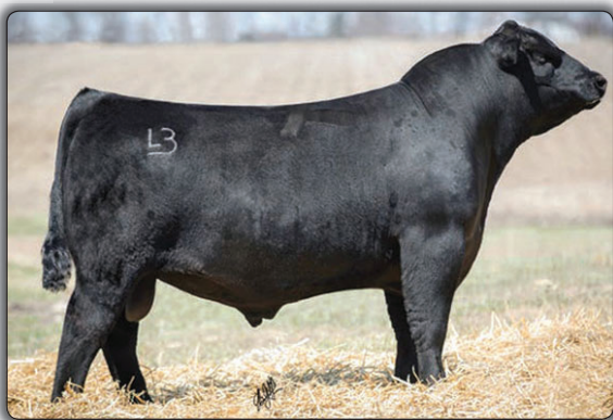
Mill Brae Identified 4031 Reference Sire F