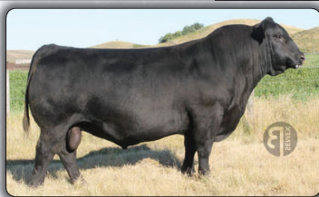
Vision Unanimous 1418 Sire of Lots 55 & 56