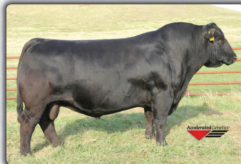
SAV Platinum 0010 Sire of Lot 66