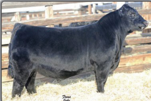
SAC Conversation Sire of Lot 144