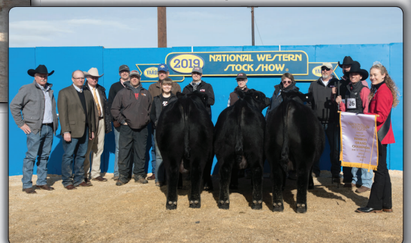
2019 NWSS Reserve Grand Champion Pen of 3 Bush Angus, SD