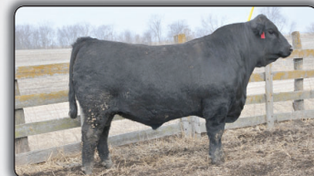
Peterson Final Product 2403 $12,000 top-selling maternal brother to lot 58 selected by Chad Miller, MO