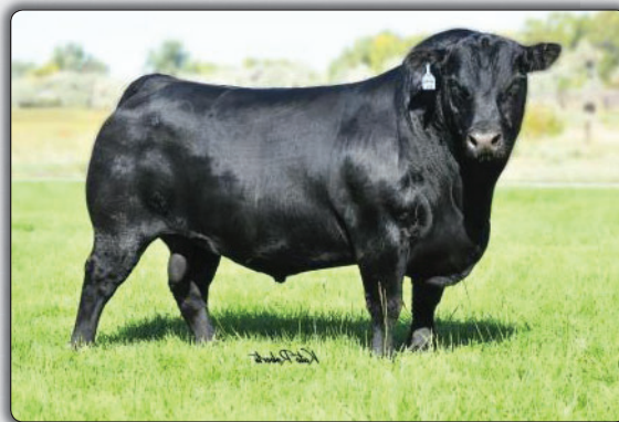
LD Capitalist 316 Reference Sire J

LD Capitalist 316 is a Musgrave Angus and Luddington Cattle acquisition that is proving to be a phenomenal "spread" sire that transmits added muscle, performance and structural perfection. His EPDs rank in the top 15% or better for CED, BW, WW, YW, CEM, Milk, and $W. His most noteworthy son today is perhaps Musgrave 316 Exclusive that returned to Musgrave Angus with exquisite visual appeal and big spread and carcass EPDs culminating in a $B value in the top 2%.