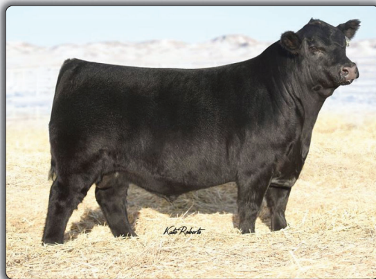
KR Synergy Reference Sire B