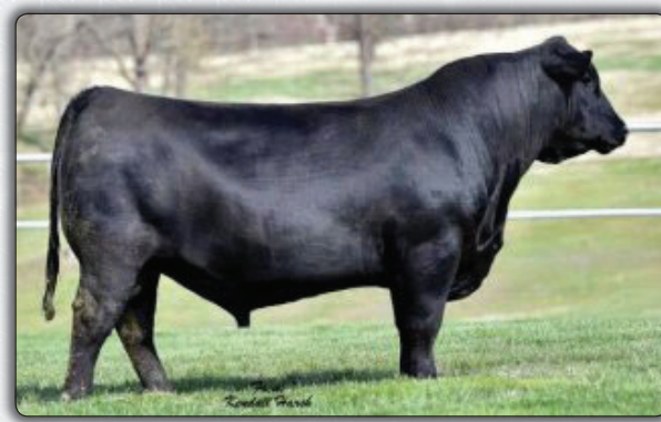
Jacs Rare Find 6503 Reference Sire S

• Rare Find possesses tremendous structure and eye appeal with percentile ranks in most every category. He is the only non-parent son of Payweight 1682 with his combination of CED, WW, YW and MB. Rare Find topped the 2018 Jacs Ranch Sale at $31,000 to Bush Angus, SD.