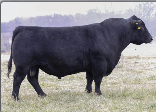
Musgrave Invision Reference Sire C