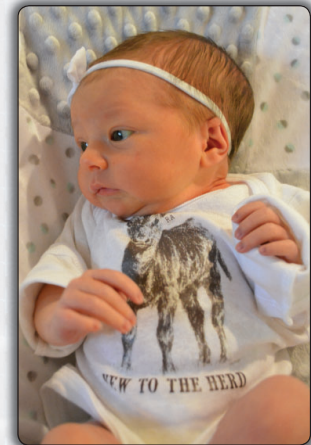
Gotta love Landry's tee shirt