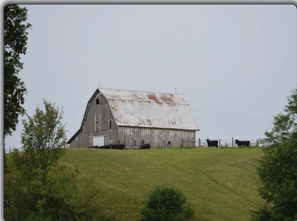
"HE owns the cattle on a thousand hills"