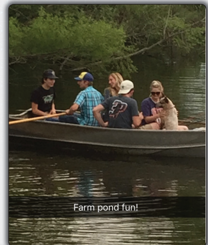
Farm pond fun!