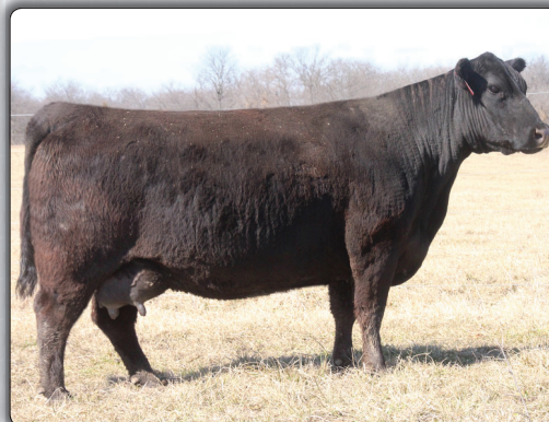
Panther Cr Imp Queen 405 dam of Lot 3 that sells as Lot 126