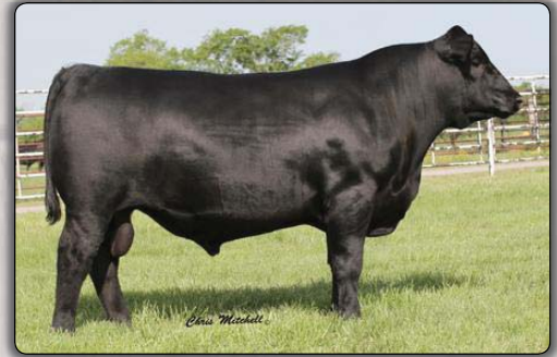
Deer Valley All In Service sire of Lot 22