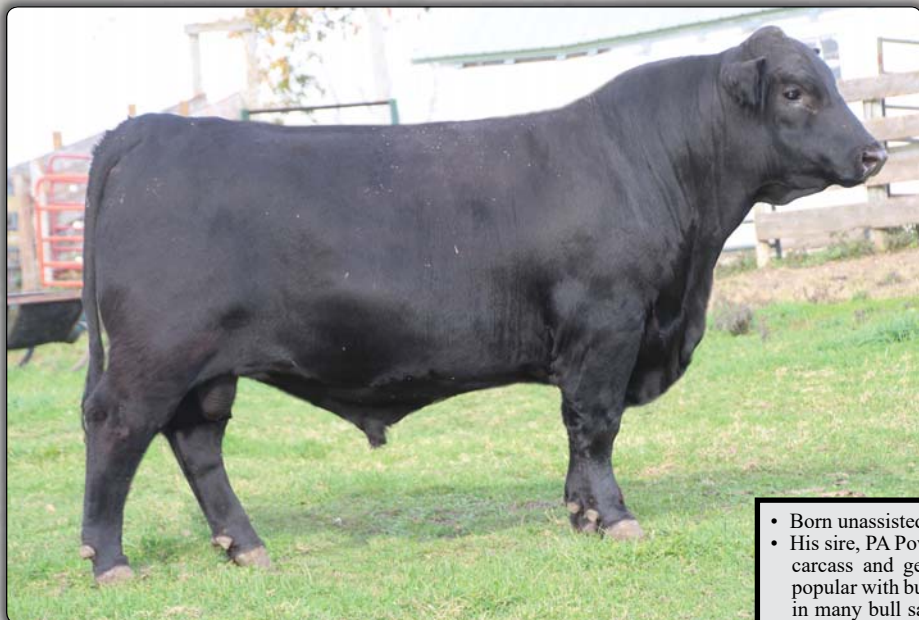
AA Power Tool Supreme • Lot 5B