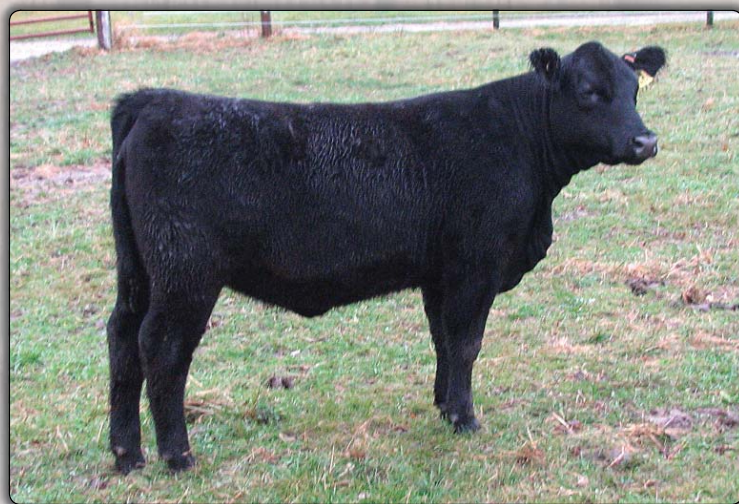
Hartz Blackbird Lass 602 8492 • Lot 46