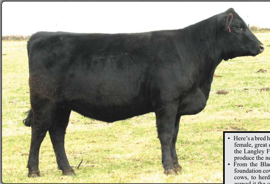
Hartz Blackbird Lass 57 259 • Lot 43