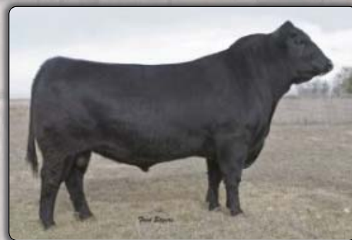
BT Crossover 758T Full brother to Lot 1