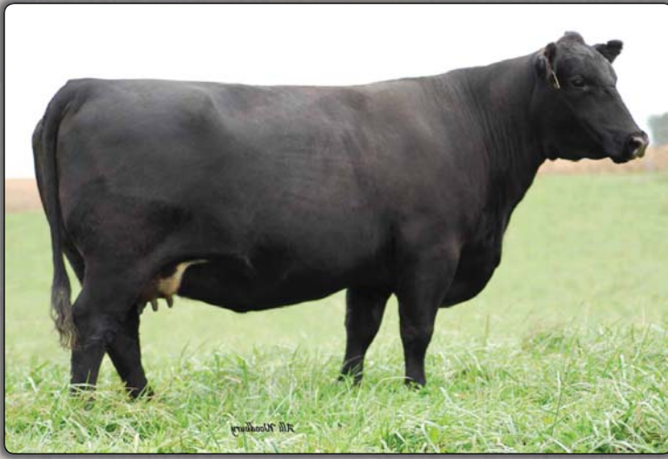
JEM Summit Blackcap 38Y • Lot 28