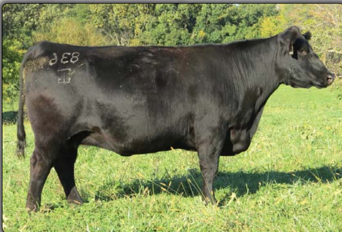
GAR Retail Product 836 Donor dam of Lots 26, 27 and 28