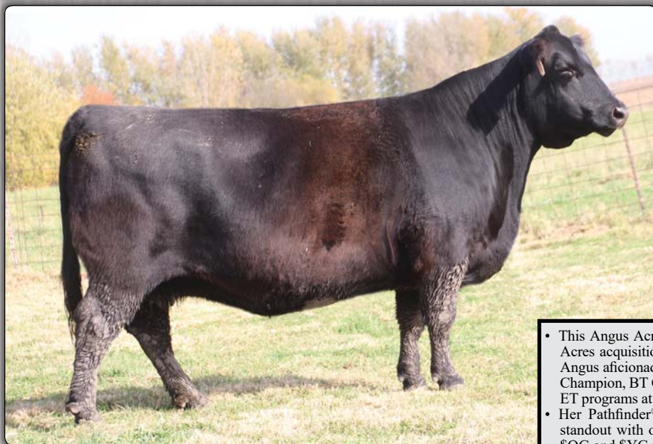
Nueta Royal Pride 735 • Lot 1