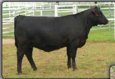
EXAR Stephanie 969 Dam of Lots 7A and 7B