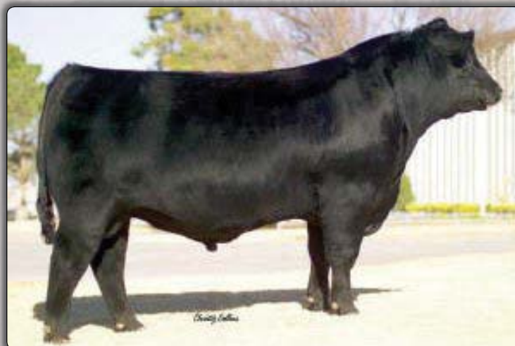
EXAR New Look 2971 Sire of Lot 18A and 18B embryos