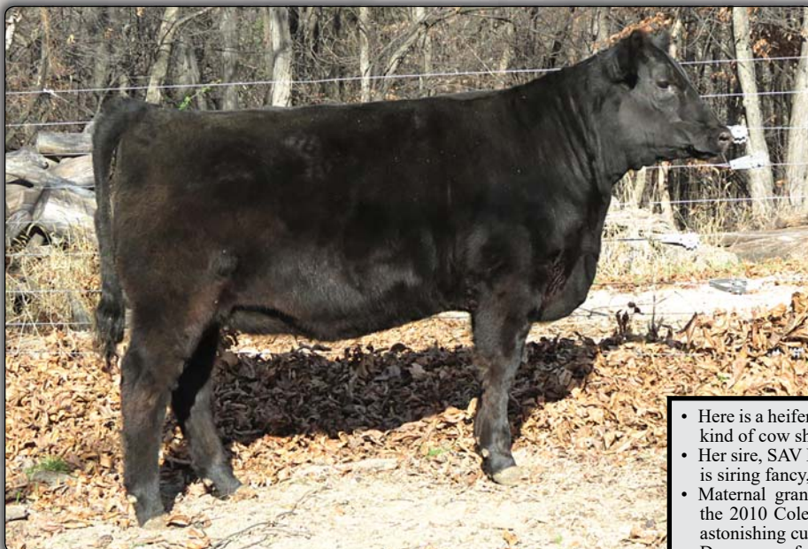
Tri-K Klassy Kondo D53 • Lot 31