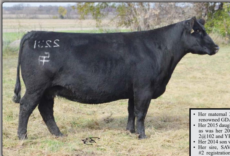
S/A Forever Lady 266-2231 • Lot 24