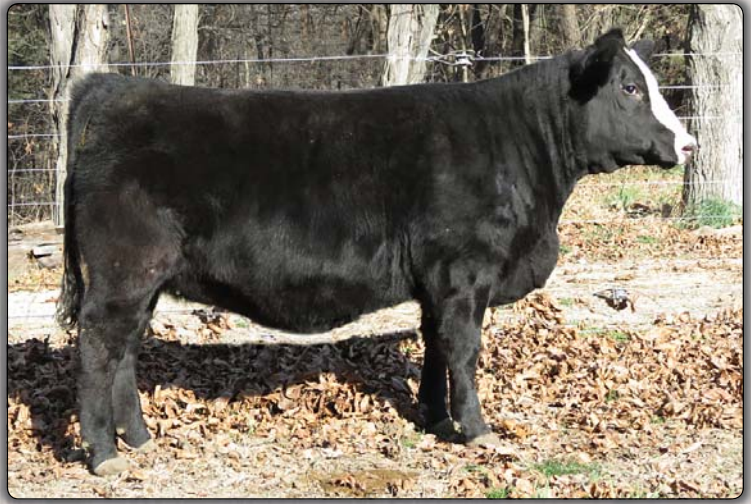
Tri-K Marie D54 • Lot 32