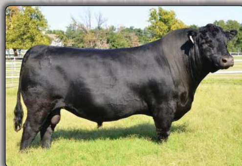
Sitz Top Game 561X Sire of Lot 2B