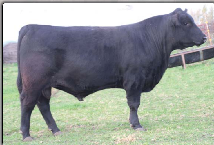
AA EXAR Upshot Focus • Lot 12B