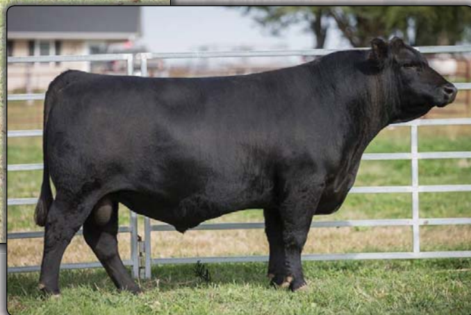
MRCC Synergy 301-9585 Maternal brother to Lot 48

A maternal sister to MRCC Synergy 301-9585