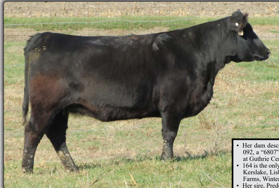
Regal Rose C164 of TNT • Lot 38