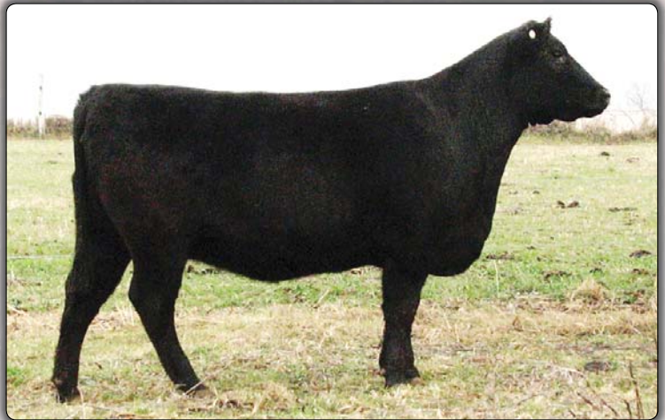
MRCC Forever Lady 507-4022 • Lot 51