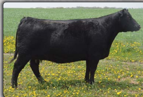
Bear Creek Entense U803 Dam of Lot 20