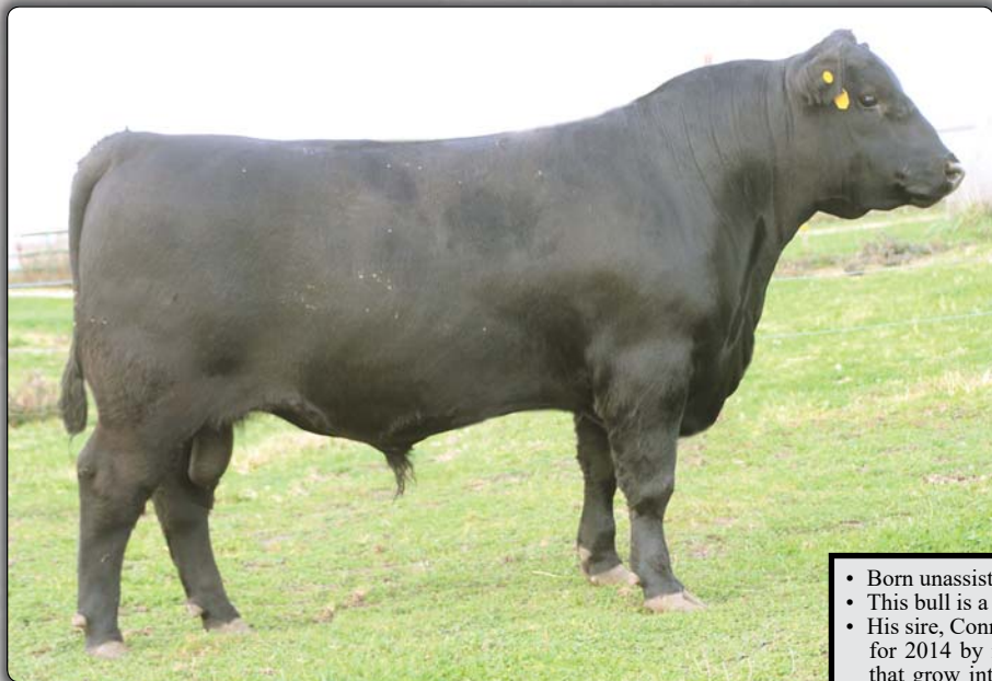
AA Consensus Star • Lot 4