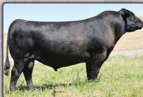
WR Journey-1X74 Service sire of Lot 2