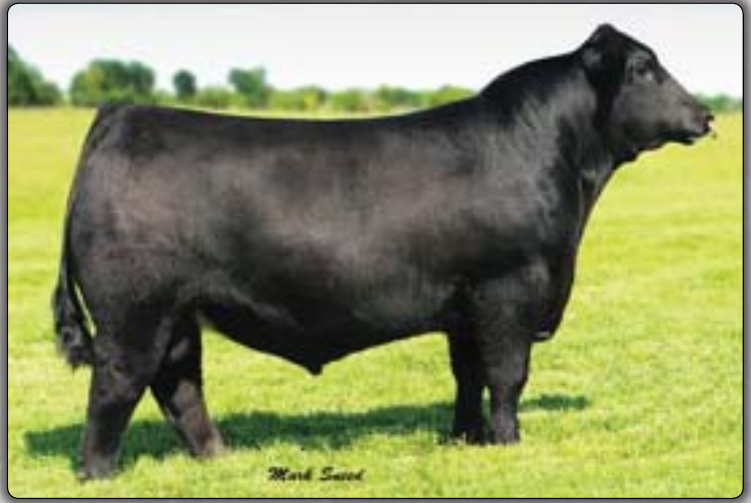
Dameron C-5 American Classic Service sire of Lot 34