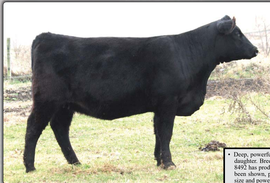
Hartz Blackbird Lass 592 8492 • Lot 44