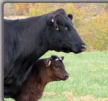
Lot 29 and 29A