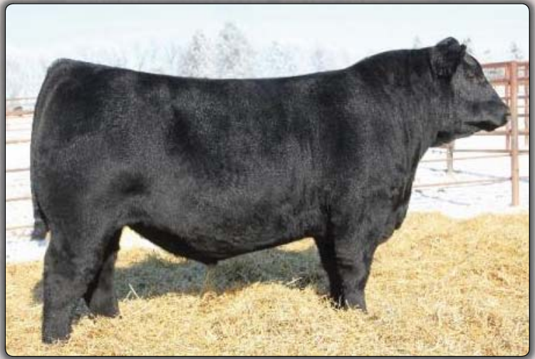
SAV Universal 4038 Service sire of Lot 33