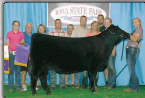
SLL YCC Keymura Katy 0220 Grandam of Lot 41