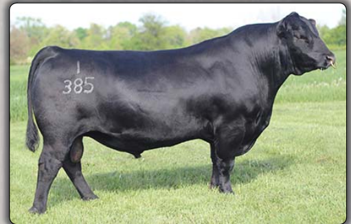
Connealy Comrade 1385 Service sire of Lot 23