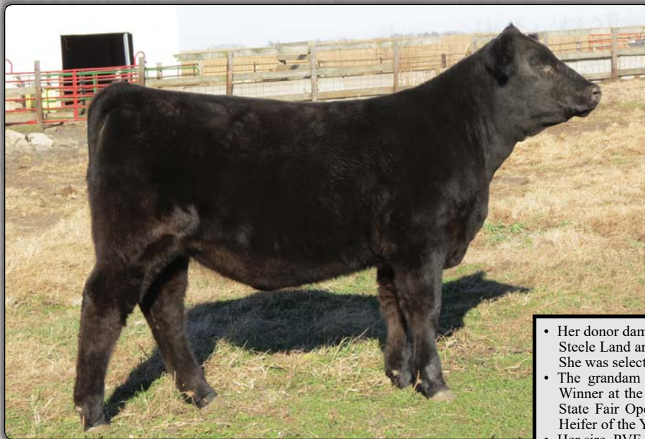
BHA Keymura Katy 315 • Lot 41