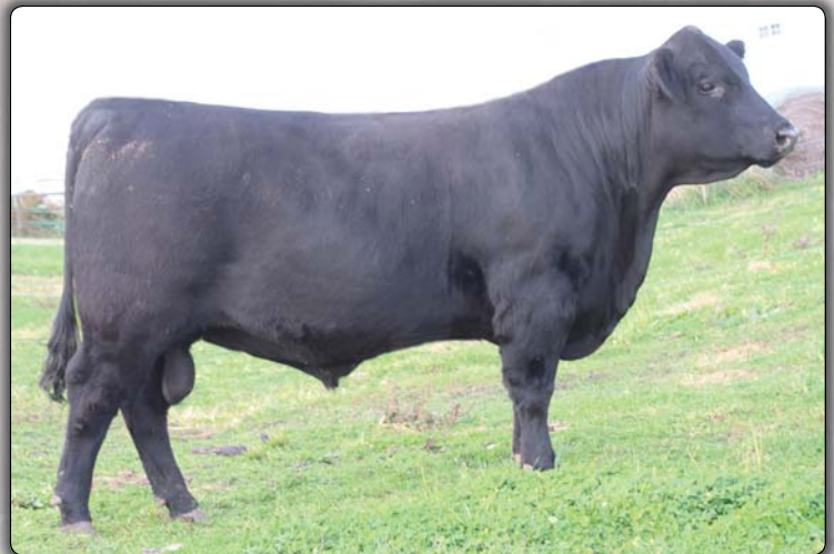
AA EXAR Upshot King • Lot 13B