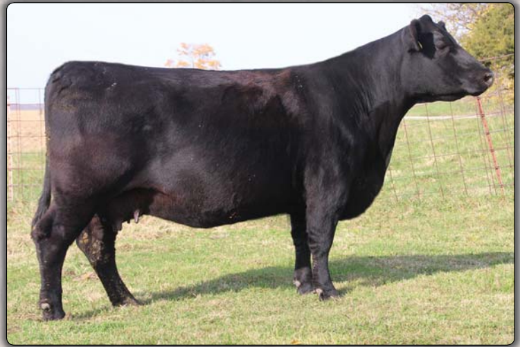
AA Mercer Pride 143 • Lot 13