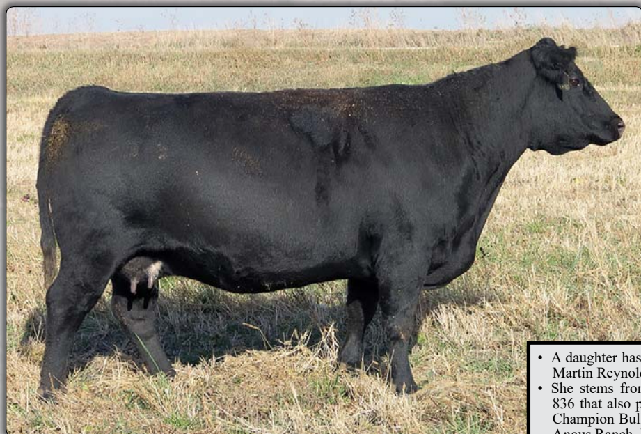
JEM-Summit Blackcap 21X • Lot 27