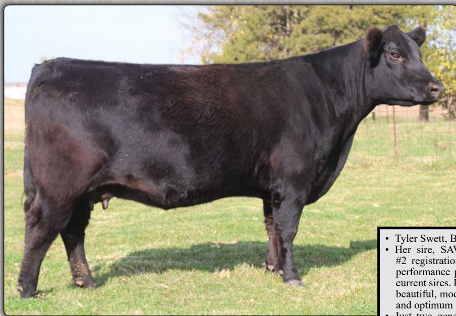
AA Mercer Barbara 582 • Lot 2