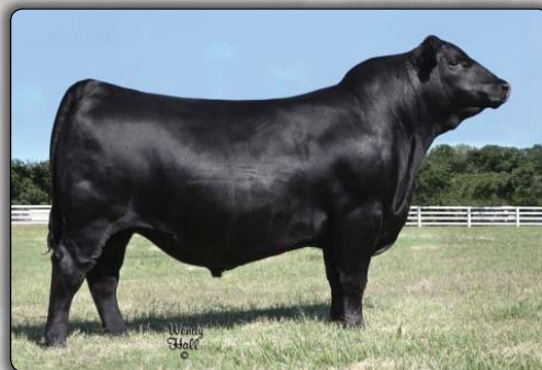
VAR Ranger 3008 Sire of Lot 11A