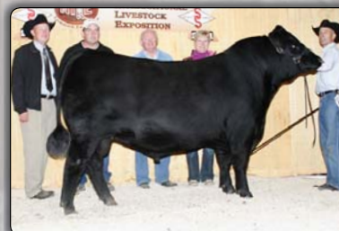
JEM-Summit High Regard 05X Flush brother to Lot 27A