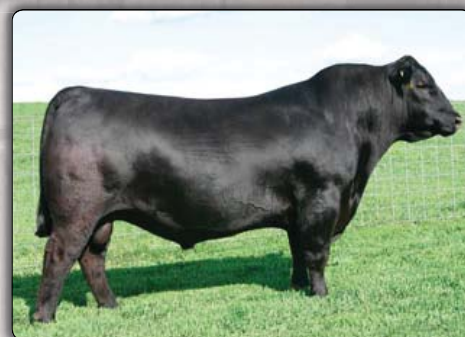
SAV Bismarck 5682 Sire of Lot 24