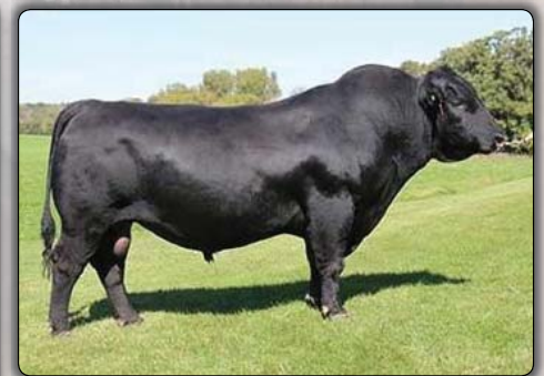
Quaker Hill Rampage 0A36 Sire of Lot 36 embryos