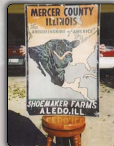
Road sign for Shoemaker Farms