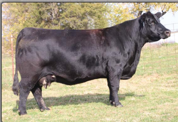
RRR Blackbird X22 • Lot 6