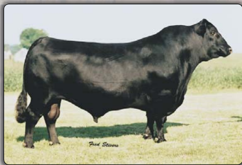
Summitcrest Prime Cut 1G42 The $125,000 maternal brother to the dam of Lot 3