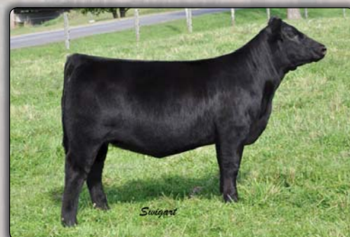
Dameron Royal Queen 418 Dam of Lot 42