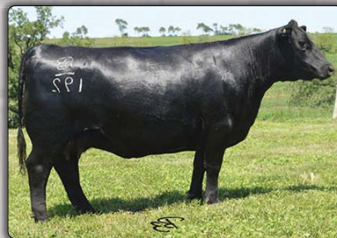
RB Lady Party 192-305 $152,000 paternal half sister to Lot 19