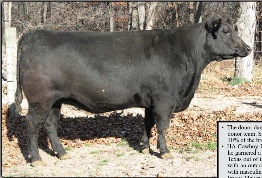
Tri K Karisma Klair A54 Donor dam of Lot 35 embryos