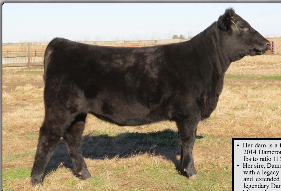
BHA Royal Queen 6904 • Lot 42