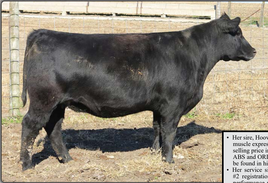
Barbara M55 of TNT • Lot 37