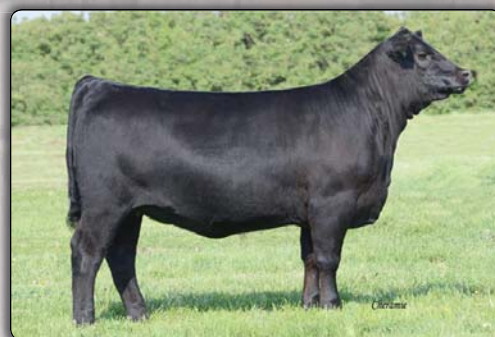
JEM Summit Alice 124A $6700 daughter of Lot 86