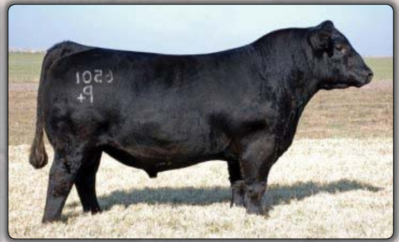
Duff Basic Instinct 6501 Sire of Lot 50