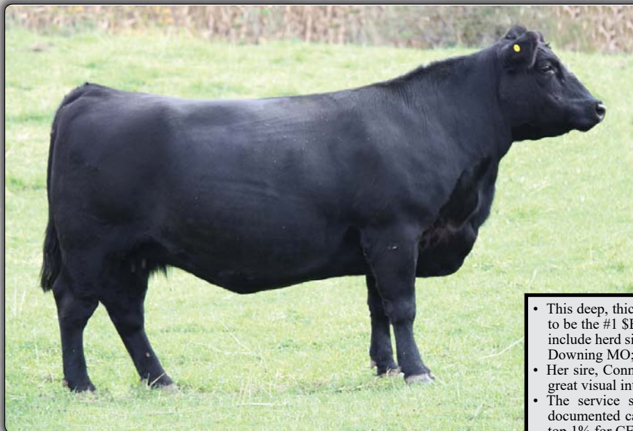
J M Ranch Barb 260 • Lot 23