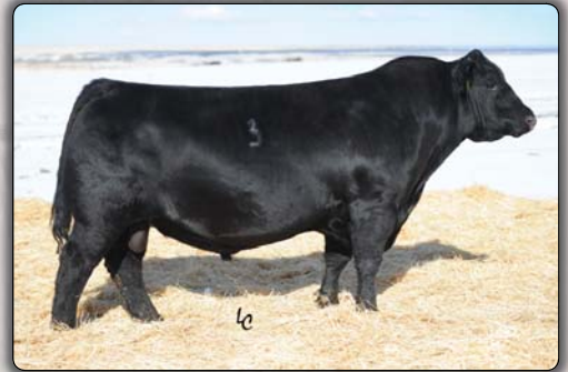
Hoover Dam Sire of Lot 37