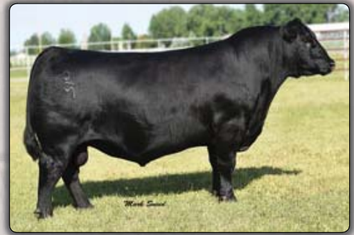
McConnell Altitude 3114 Service sire of Lots 38, 39 and 40