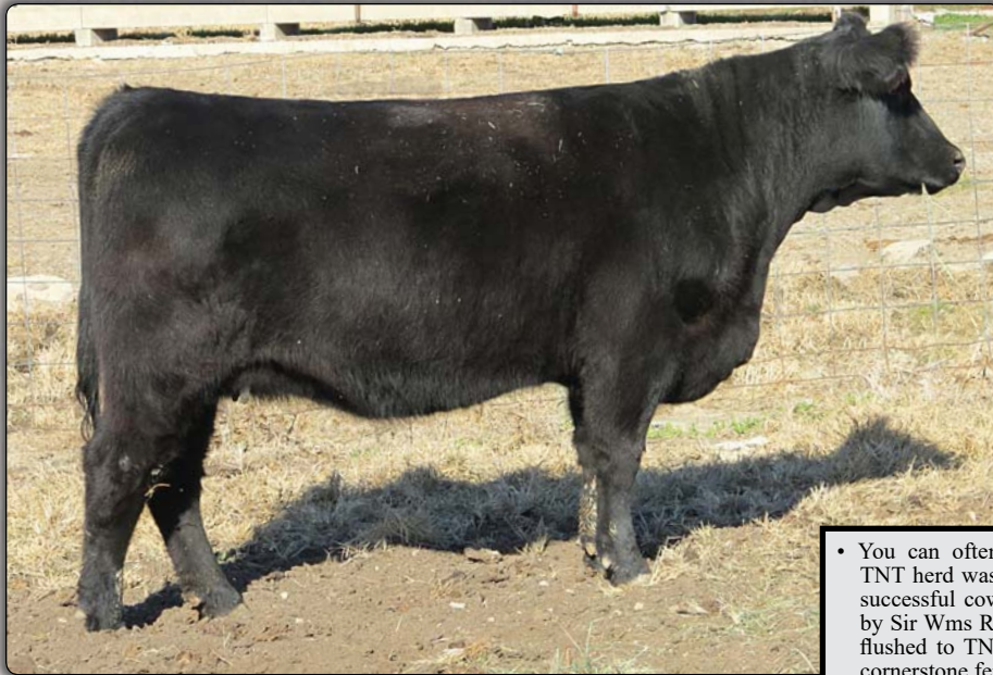
Royal Pride 124 of TNT • Lot 39