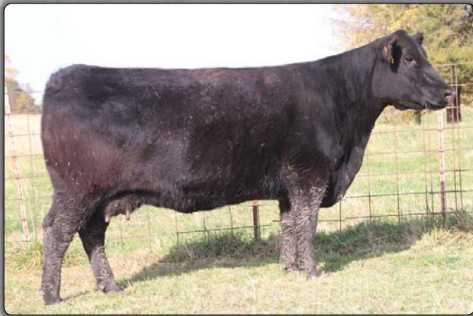
EXAR Blackcap 3856 • Lot 7