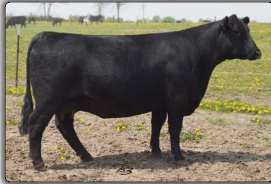
RB Annie Resolute 1183-367 Donor dam of Lot 21 embryos