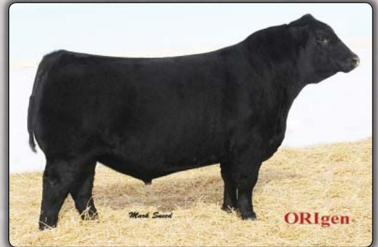
RB Active Duty 010 Sire of Lot 21 embryos