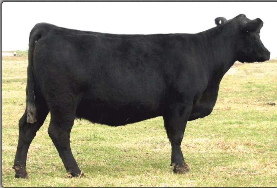
MRCC Forever Lady 382 9410 • Lot 50