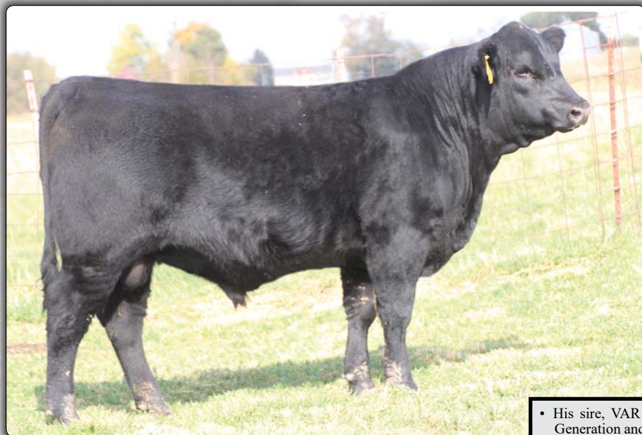
AA VAR Ranger Lad • Lot 11A