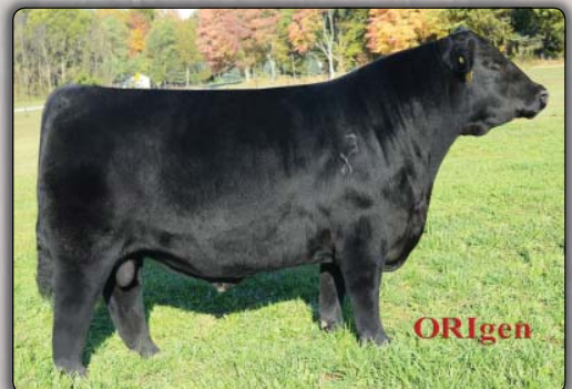
EXAR Classen 1422B Sire of Lot 44