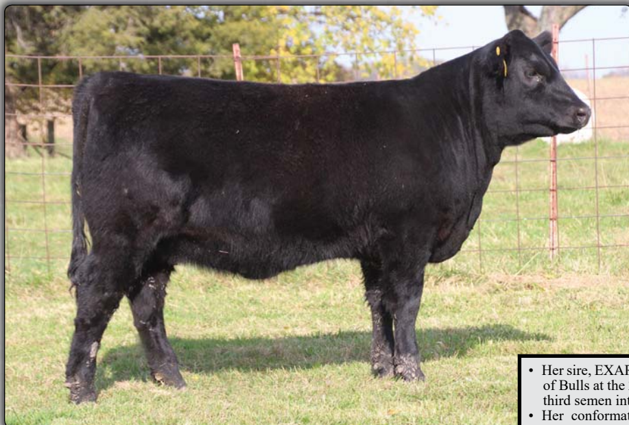
AA Mercer Barbara 106 • Lot 3A