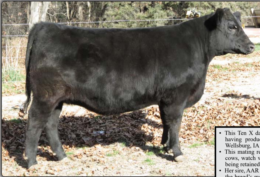
Tri-K Mariel Kalin C80 • Lot 30