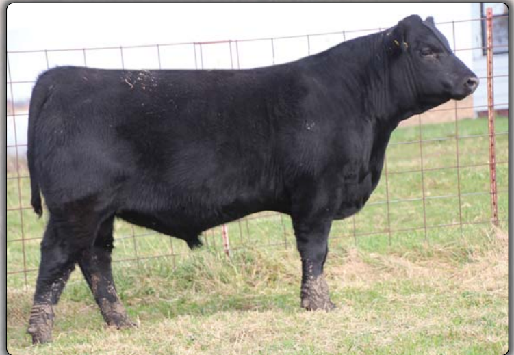
AA VAR Generation Leader • Lot 13A