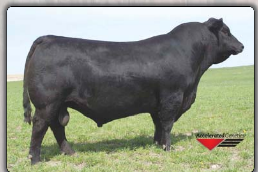
SAV 004 Predominant 4438 Grandsire of Lot 38