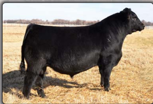
EXAR Denver 2002B Sire of Lot 3A