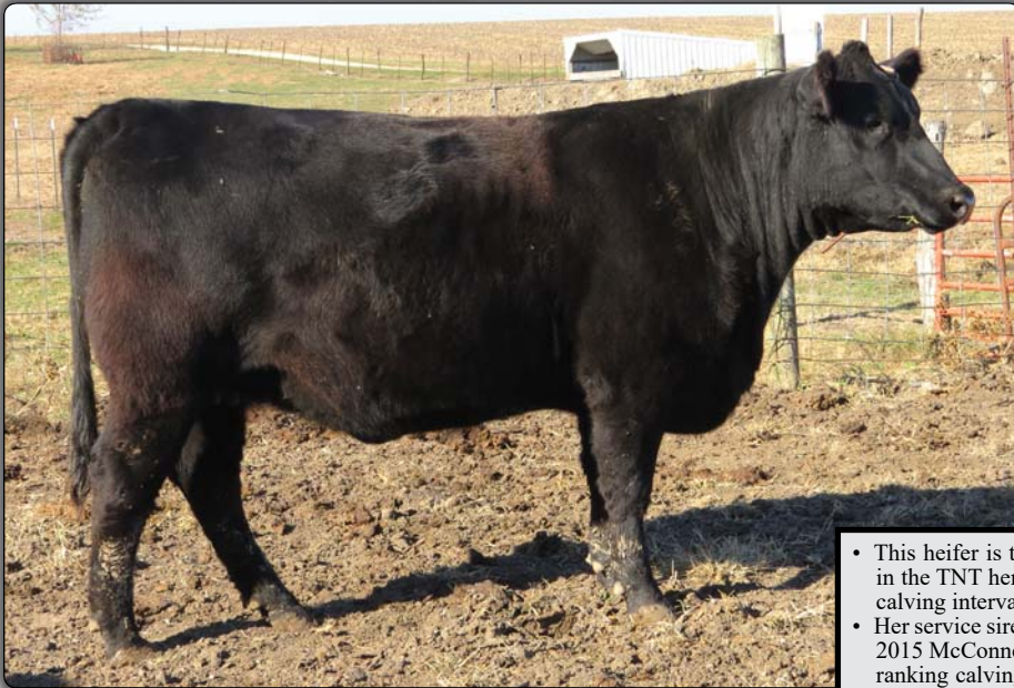
Rose 104 of TNT • Lot 40