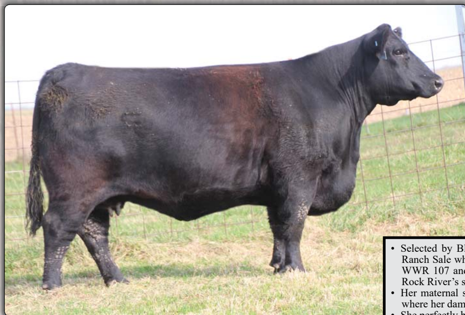
RRR Bashra 3140 • Lot 5