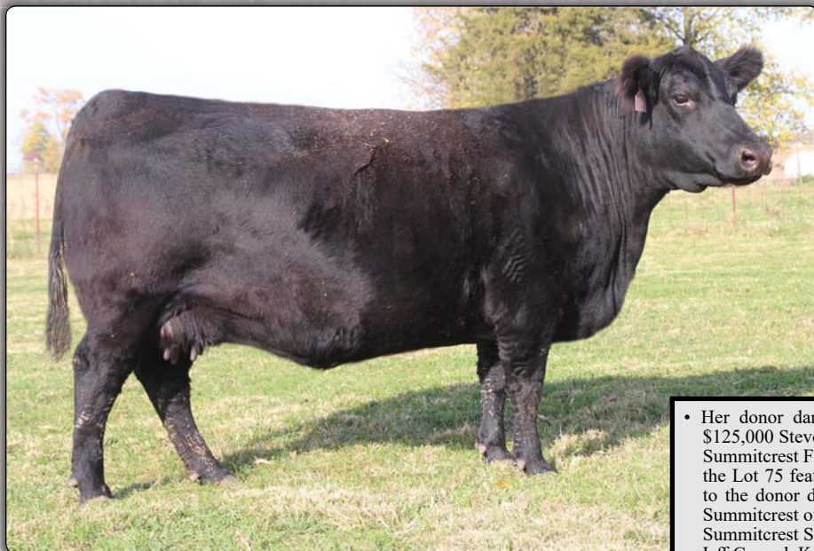
AA Mercer Barbara 1240 • Lot 3