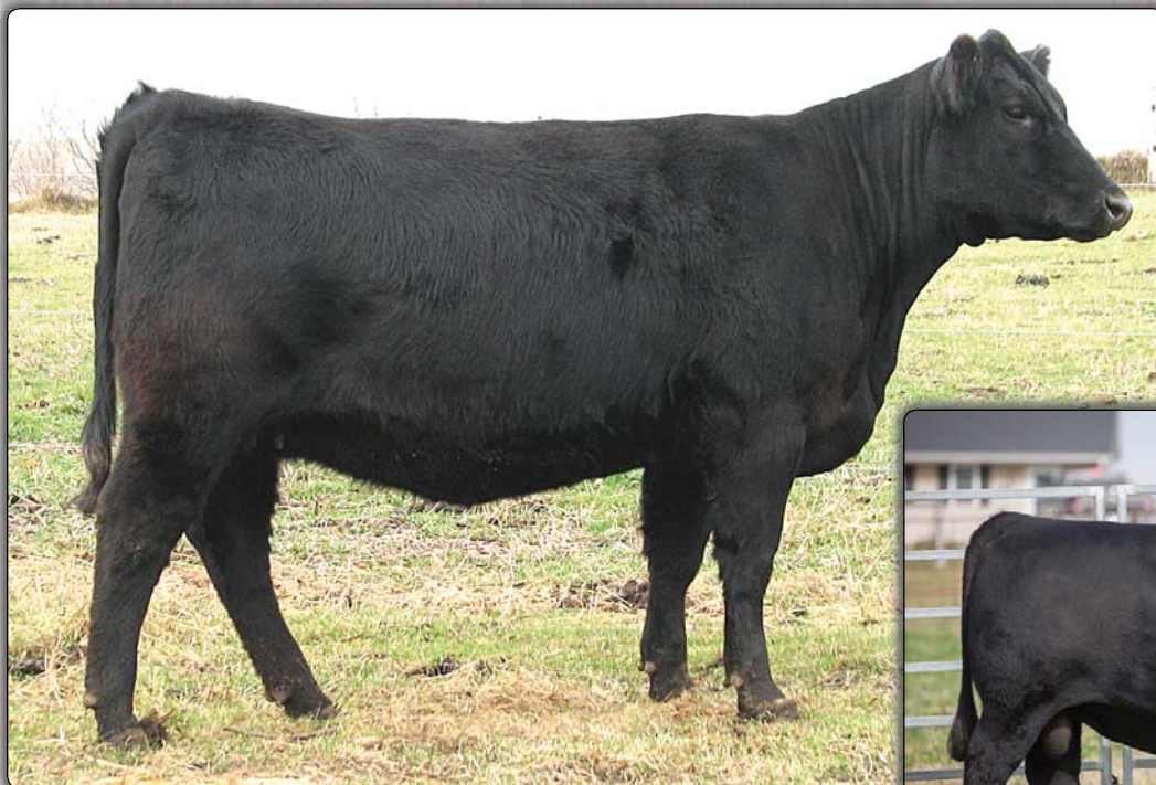
MRCC Kinochtry Beauty 544 • Lot 48