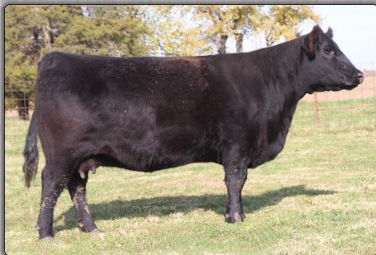
AA Mercer Elba 8793 • Lot 12