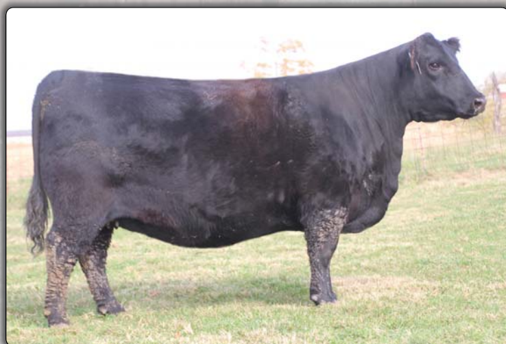
EXAR Princess 2852 • Lot 15