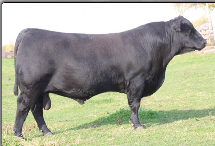
AA Sitz Top Game Chief • Lot 6B