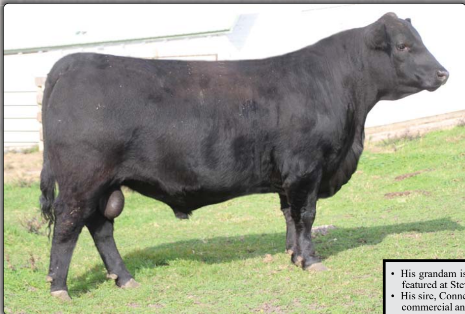
AA Consensus Leader • Lot 3B

ANGUS ACRES BREEDING GUARANTEE Angus Acres will reimburse buyers for a breeding soundness exam prior to turn out and each bull sells with a 90-day breeding guarantee from that day forward.