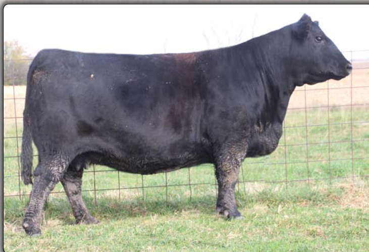
AA Mercer Elba 2879 • Lot 17