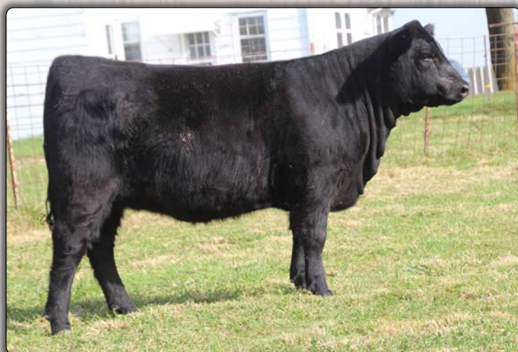
AA Mercer Jilt 1136 • Lot 14A