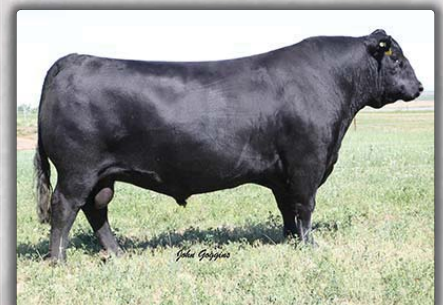
Connealy Consensus 7229 Sire of Lot 28. Service sire of Lot 29A