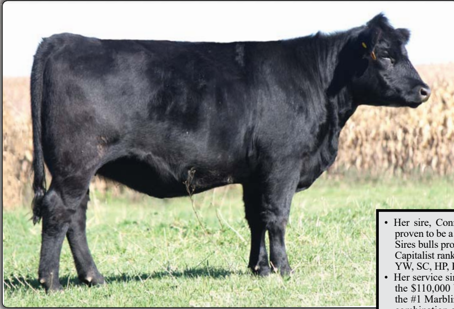
Mill Coulee Pridemere 524 • Lot 22