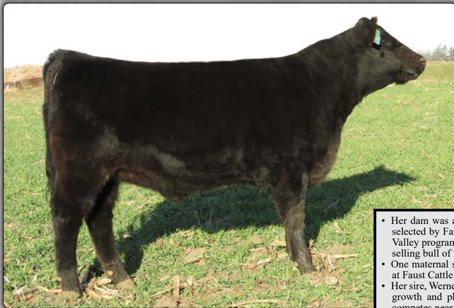
FCC Lassie Party D33 • Lot 19