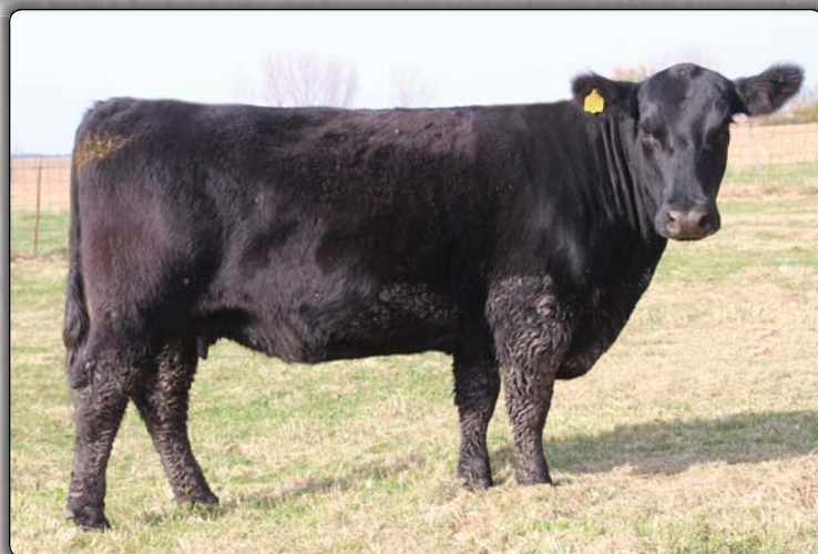
AA Mercer Jilt 113 • Lot 14