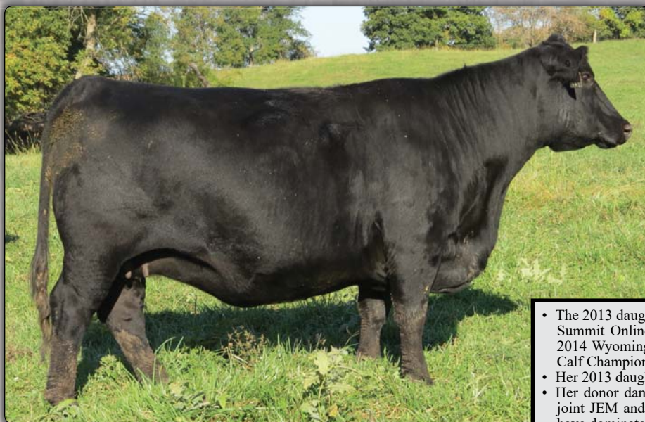
JEM-Summit Blackcap 24X • Lot 26