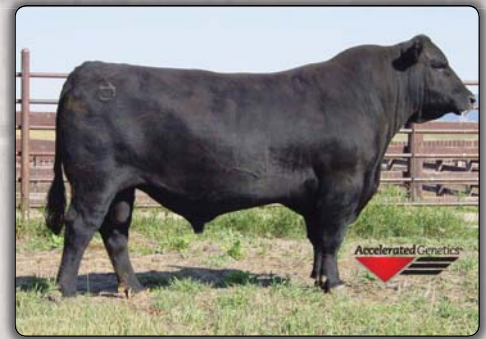
AAR Ten X 7008 SA Sire of Lot 30