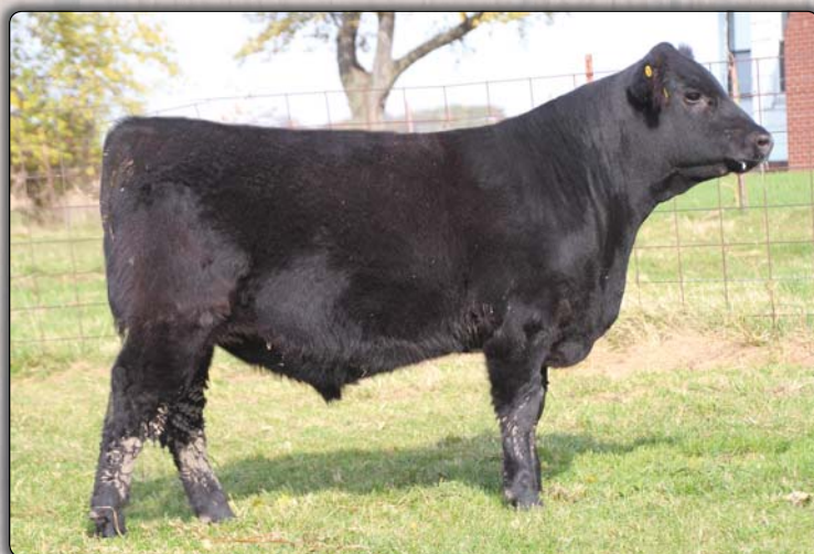
AA Denver Star • Lot 12A