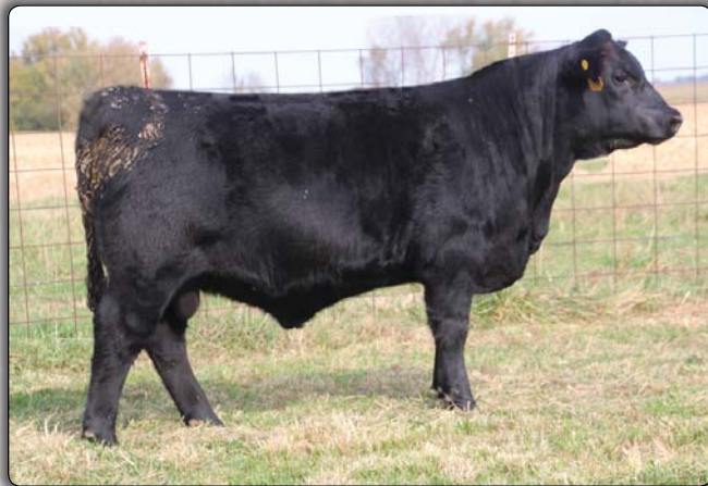
AA RB Tour of Duty 217 • Lot 7A