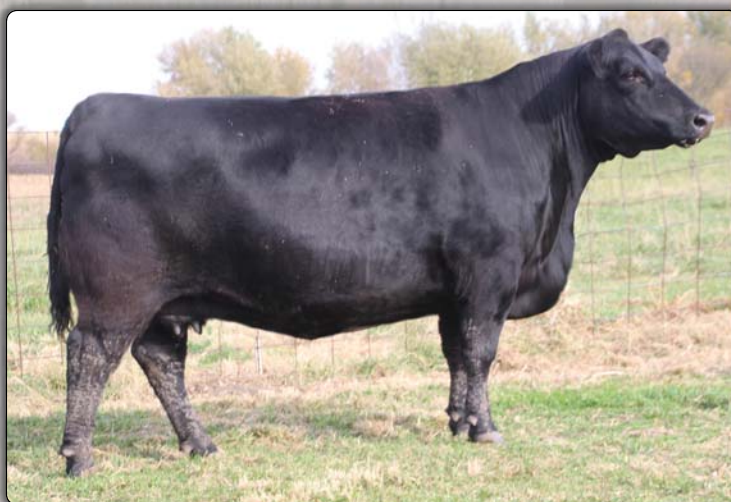
AA Mercer Barbara 1260 • Lot 16