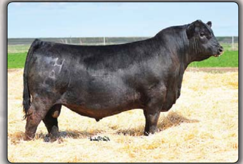
HA Cowboy Up 5405 Sire of Lot 35 choice embryos