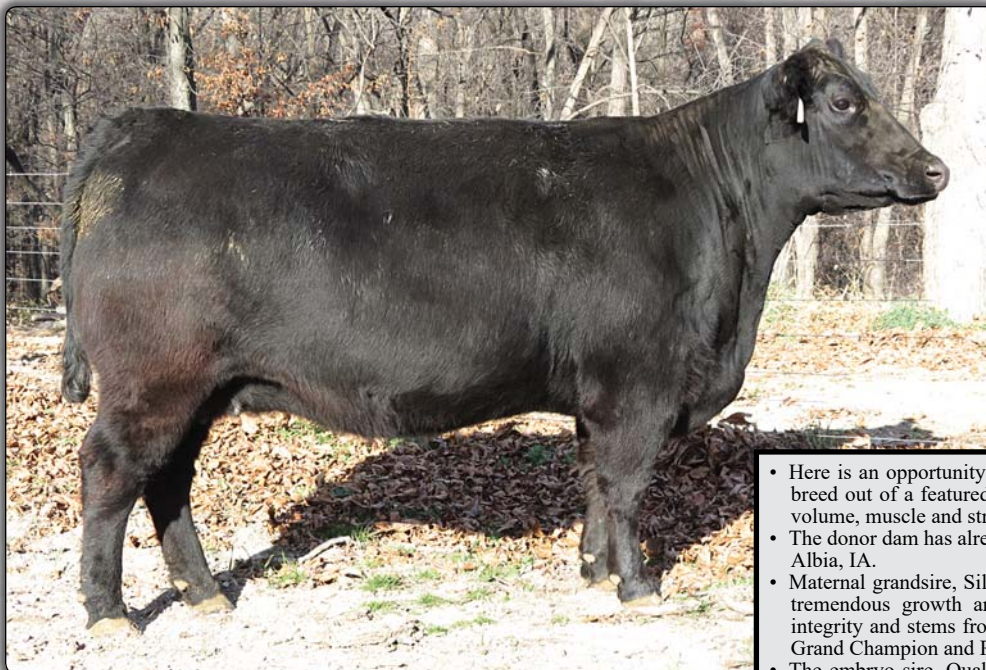
Tri-K Kara Keekee Z93 Donor dam of Lot 36 embryos