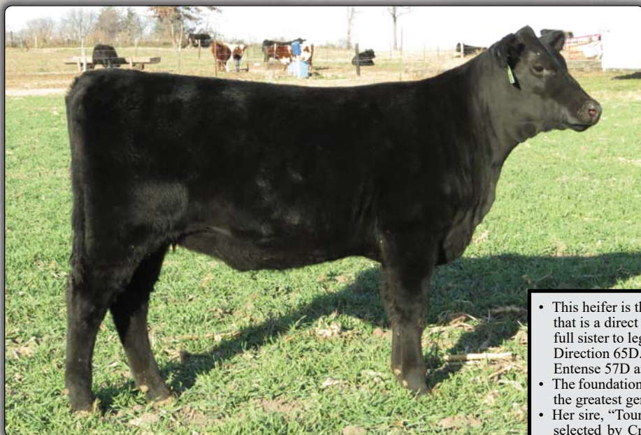
FCC Everelda Entense D325 • Lot 20