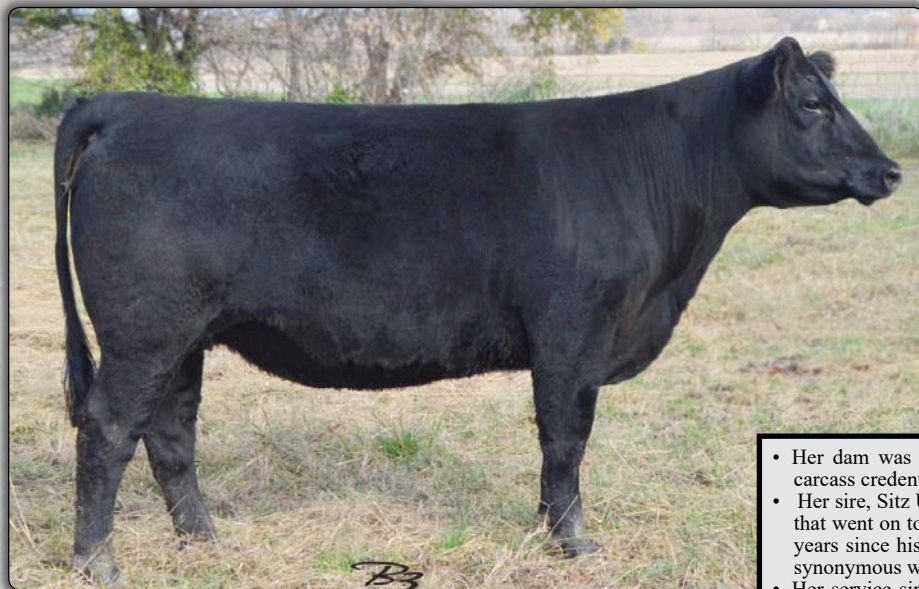
S/A Lass 243P 2165 • Lot 25