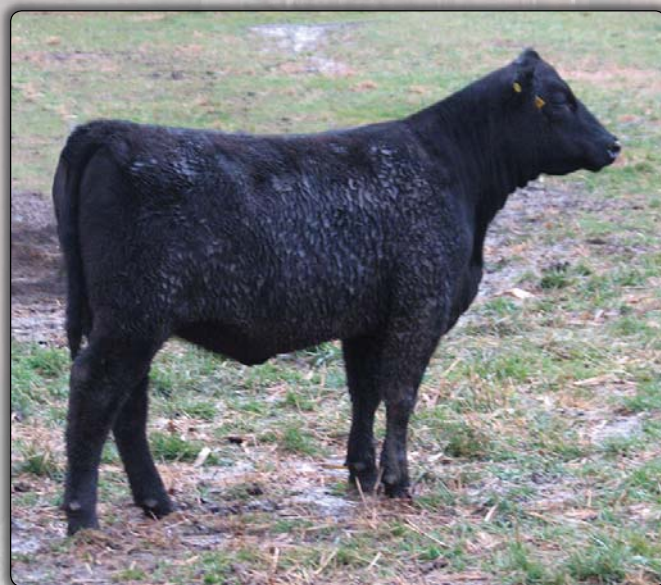
Hartz Blackbrdlass 6012 8492 • Lot 47