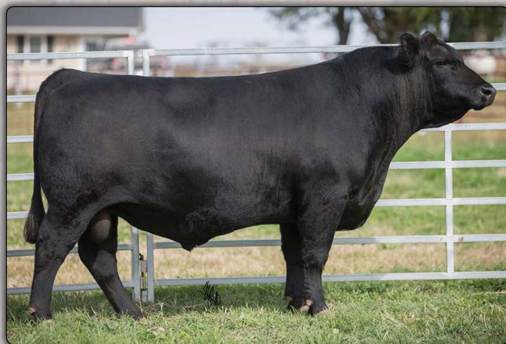
MRCC Synergy 301-9585 Service sire of Lot 45