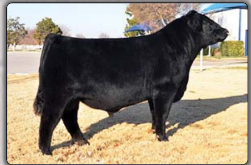
EXAR Blue Chip 1877B Sire of Lot 43