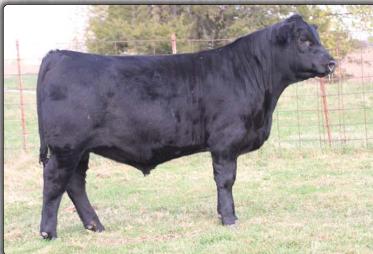
AA Denver Chief • Lot 6A