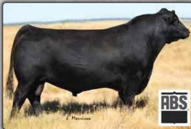
Soo Line Motive 9016 Sire of Lot 49