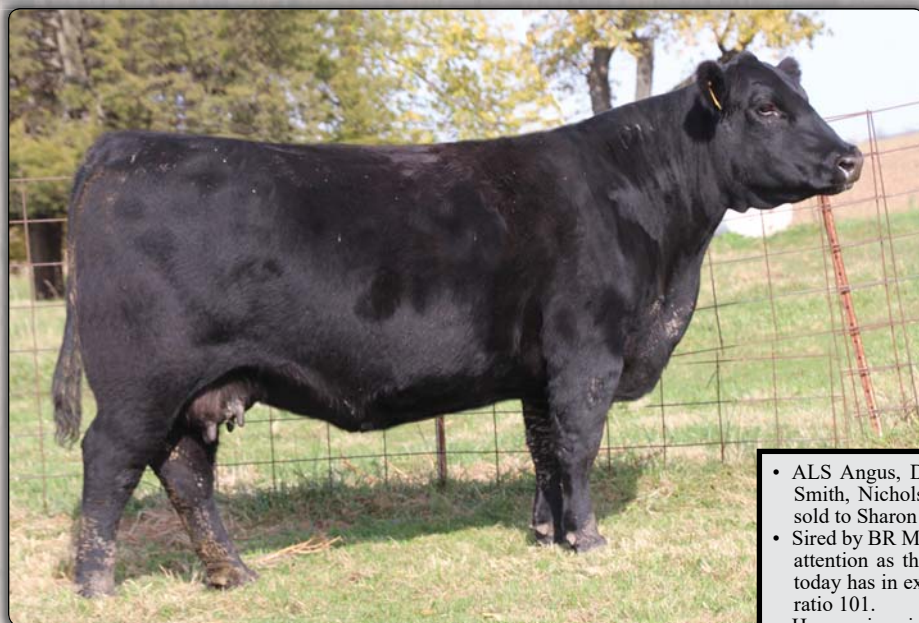
AA Mercer Blackwind Lady 8139 • Lot 11