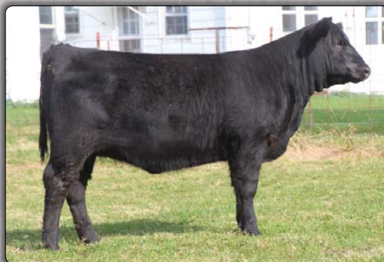
AA Mercer Royal Pride 476 • Lot 2A