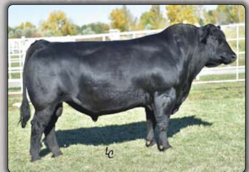
SAV Hot Iron 0941 Sire of Lot 31