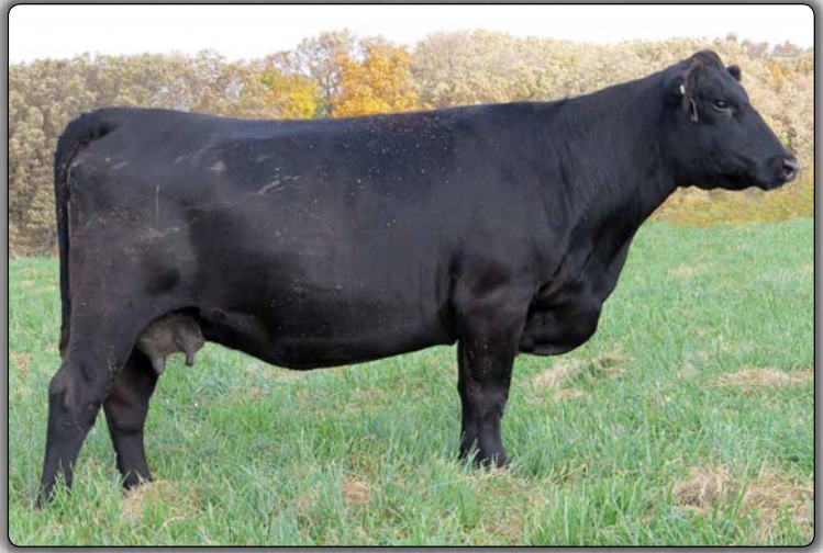
JEM-Summit Abigail 159A • Lot 29