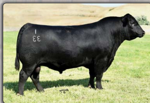
Connealy Black Granite Service sire of Lot 11