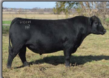
Hoover Advisor Service sire of Lots 24 and 25