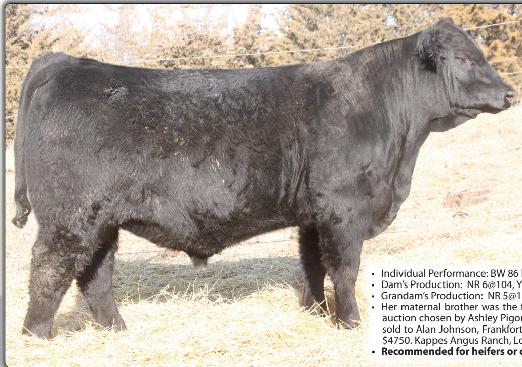
ME Foundation 538 • Lot 24