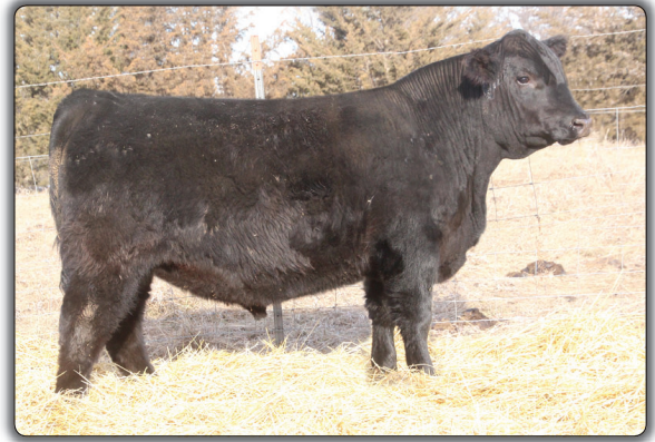
ME Cavalry 34 618 • Lot 44