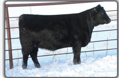
ME Marshalls Queen 536

Maternal sister to lot 87 selected by Mason-Knox Ranch, SD