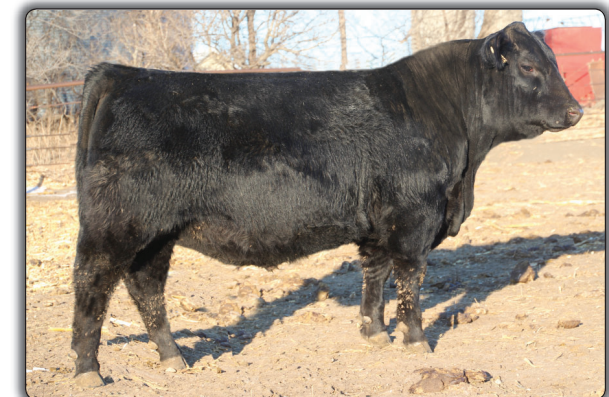
ME Thunder 144 ■ Reference sire H

Thunder 144 was a standout in his contemporary group posting a 205 day wt of 823 lbs to ratio 125 among 73 contemporaries. His sire, Connealy Thunder was the $160,000 top seller at the 2006 Connealy Angus Sale and is a sub-zero BW sire that ranks very high for docility, heifer pregnancy and calving ease.