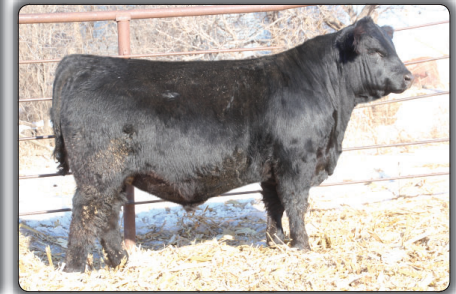
ME Double Vision 5 356 Maternal brother to lot 10 selected by Tom Paepke, SD