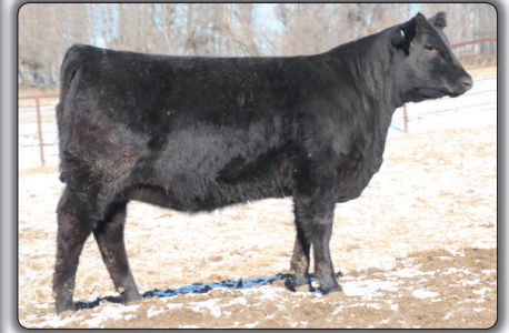
ME Marshalls Coquette 304 Maternal sister to lot 96 selected by Artz Angus, SD