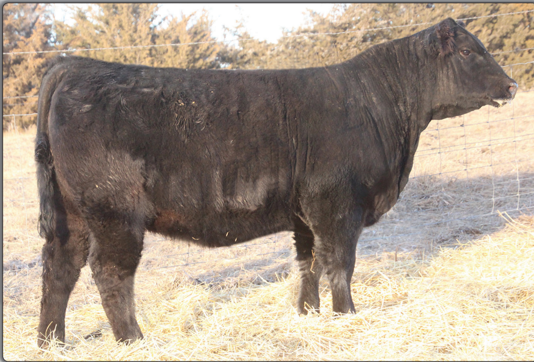
ME Marshalls Coquette 398 Lot 89