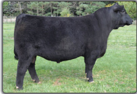
Musgrave Foundation ■ Reference Sire E

This Genex feature topped the 2012 Musgrave Angus Sale at $105,000 and is considered an outcross bull that blends two unique but popular AI sires. He is a powerfully constructed bull with thickness and eye appeal that has impressed the most discriminating cattlemen.