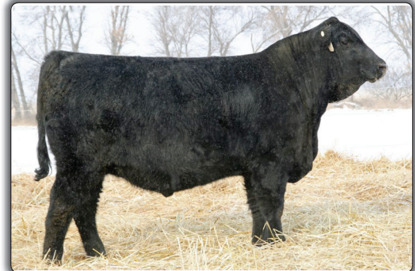
Hart Cavalry 3247 ■ Reference Sire G