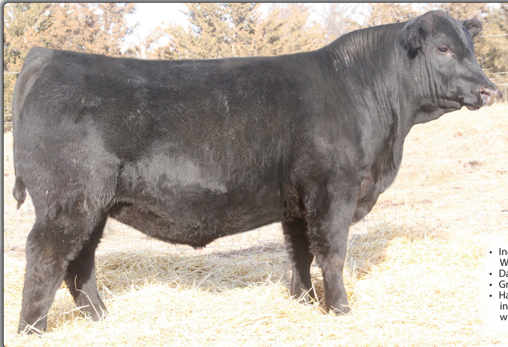
ME Double Vision 598 Lot 6