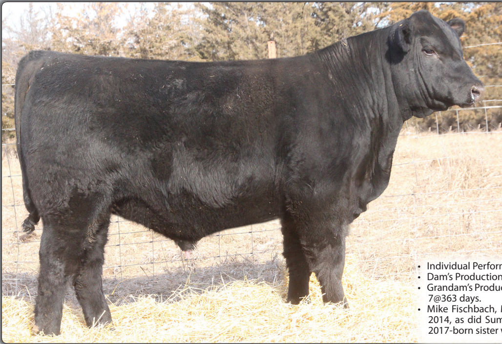
ME Double Vision 28 • Lot 5