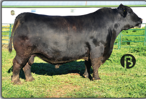
Jindra 3rd Dimension ■ Reference Sire A