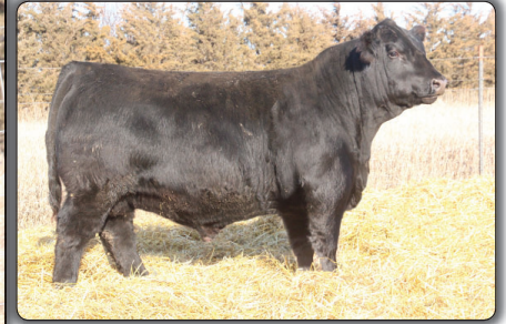
ME Double Vision 427

Maternal brother to lot 25 selected by Stan Hummel, SD