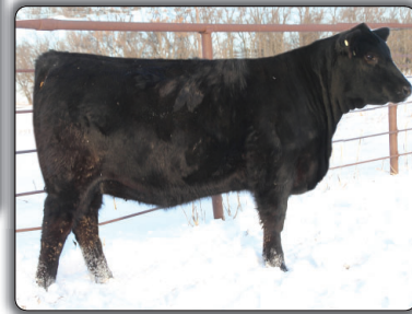
ME Marshalls Coquette 426

Maternal sister to lot 42 selected by Sumption Farms, SD