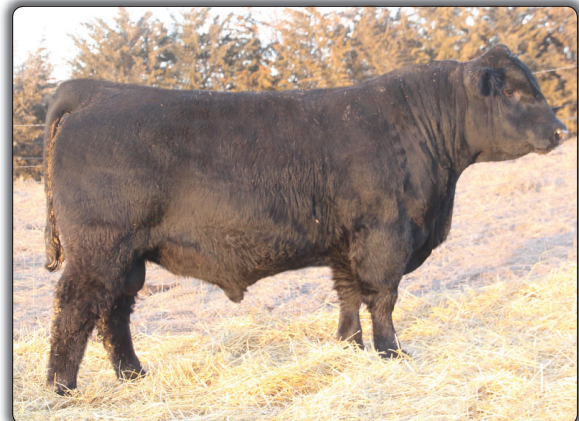
ME Cavalry 247 • Lot 101