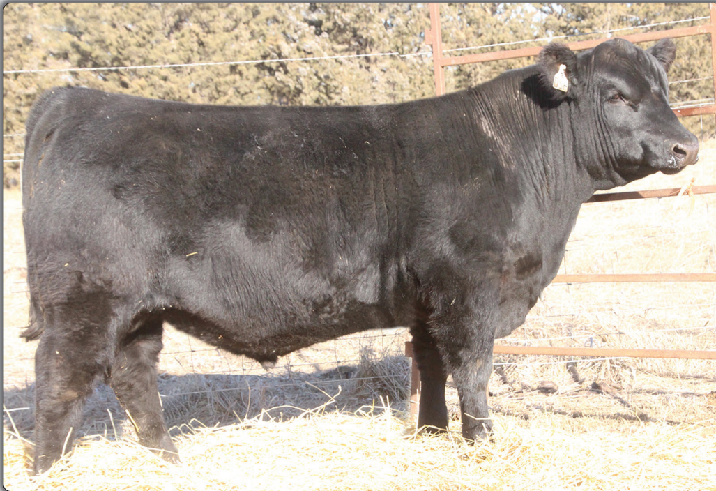
ME Bankroll 488 • Lot 15