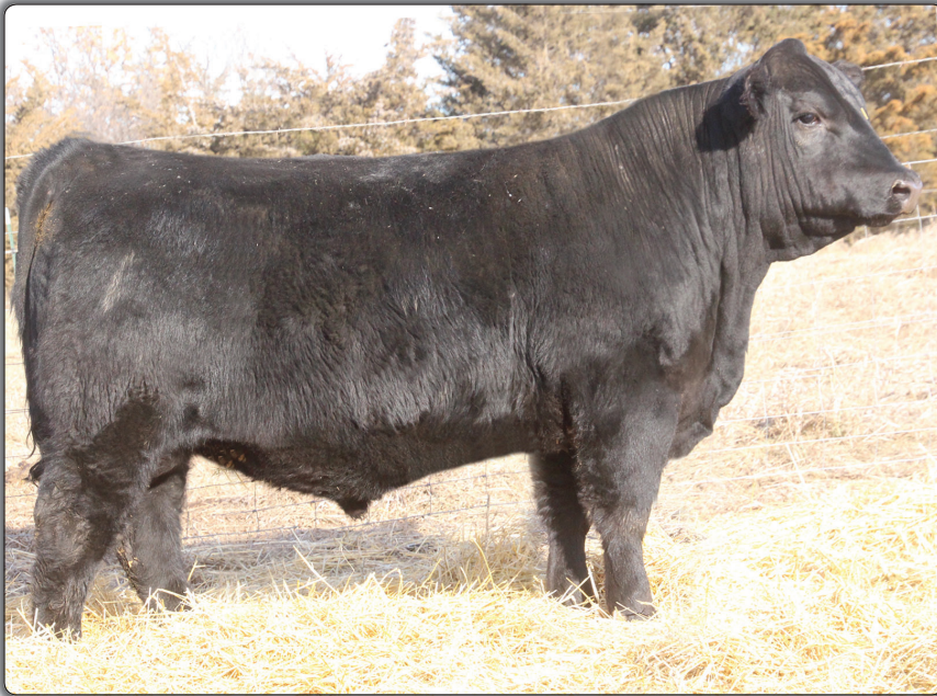
ME Thunder 108 • Lot 42