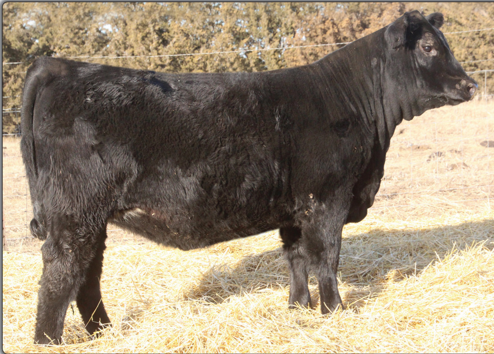
ME Black Queen 538 • Lot 85