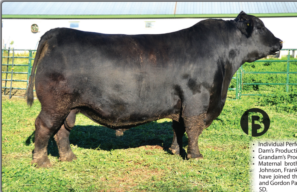
Jindra 3rd Dimension • Sire of Lots 1-4