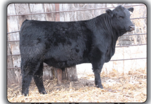
ME Good Answer 65

Maternal brother to lot 44 selected by Jeff Malsom, SD