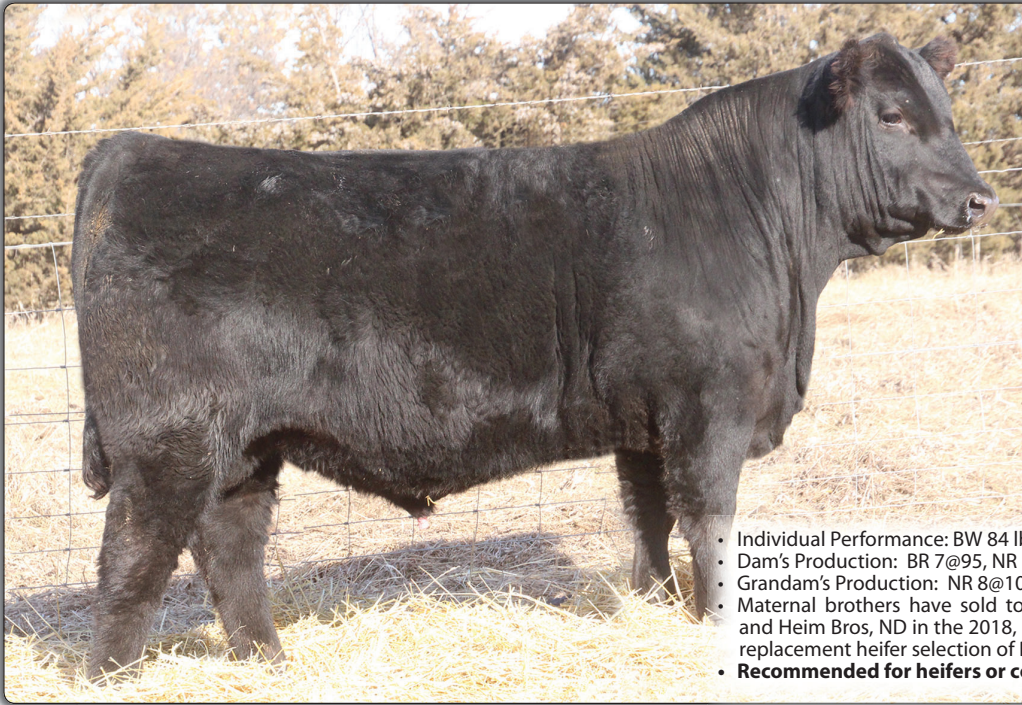
ME Top Cut 718 • Lot 25