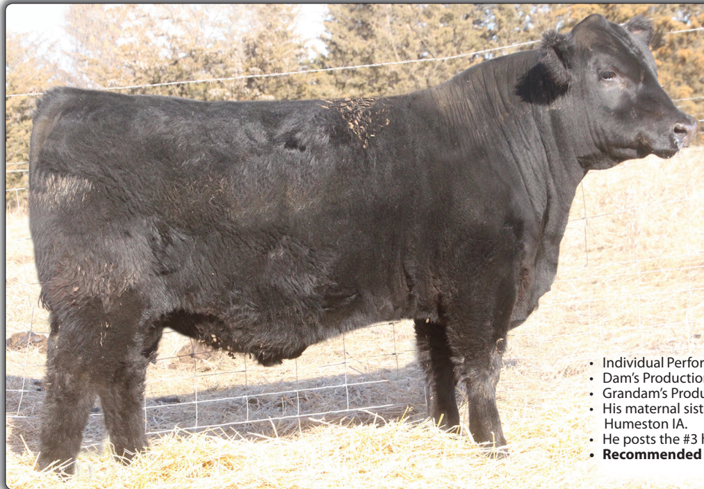
ME 3rd Dimension 458 • Lot 4