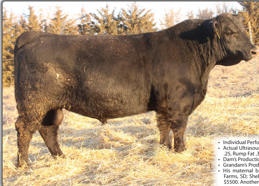
ME Double Vision 457 • Lot 96