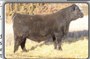
ME Open Range 527 Maternal brother to lot 84 selected by Dakota View Farms, SD