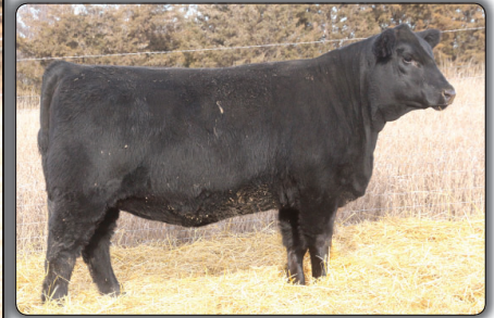
ME Queen Idelette 387