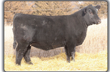
ME Marshalls Queen 377 Maternal sister to lot 83 selected by Vandy's Ag, Westport SD