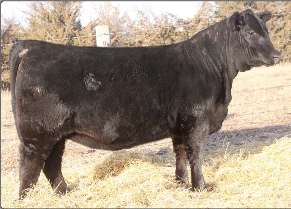
ME Black Queen 438 • Lot 81