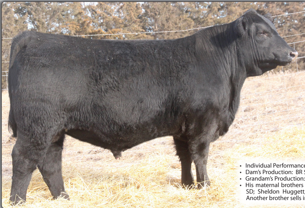
ME Foundation 508 • Lot 23