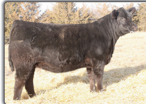
ME Black Queen 578 • Lot 73