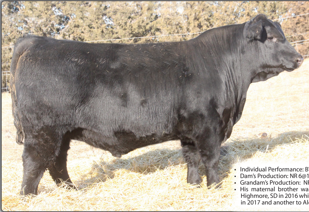
ME Bankroll 408 • Lot 13