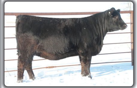
ME Marshalls Coquette 216 Maternal sister to lot 5 selected by Sump- tion Farms, Frederick SD