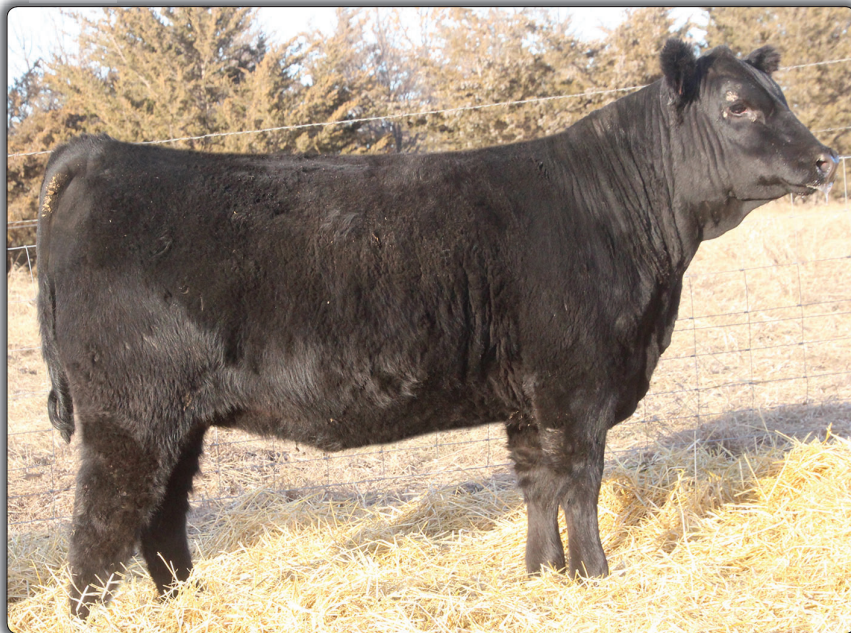
ME Marshalls Queen 128 • Lot 74