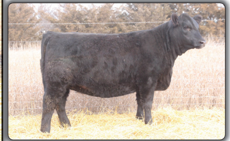
ME Marshalls Coquette 197 Maternal sister to lot 54 selected by Mason-Knox Ranch, SD