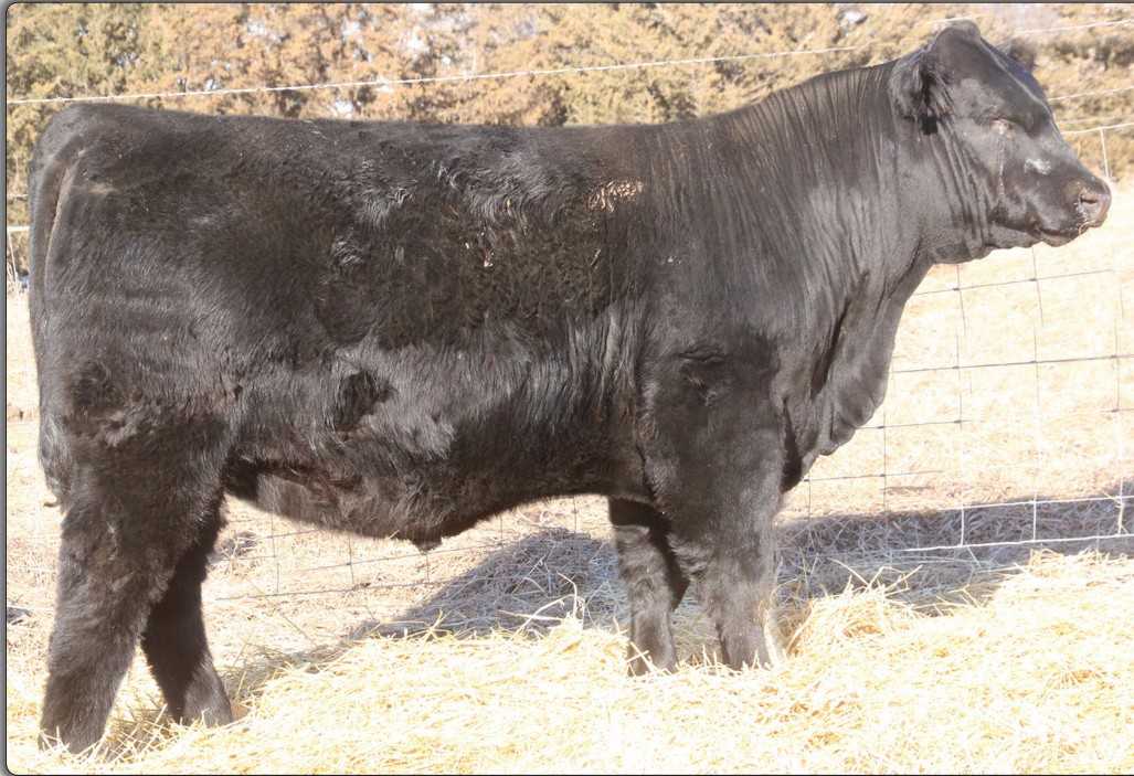
ME Double Vision 5 248 • Lot 9