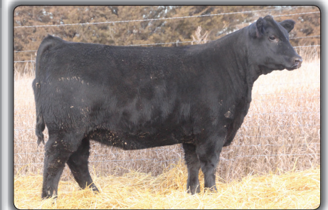
ME Black Queen 807 Maternal sister to lot 4 selected by LMMJ Farms, Humeston IA