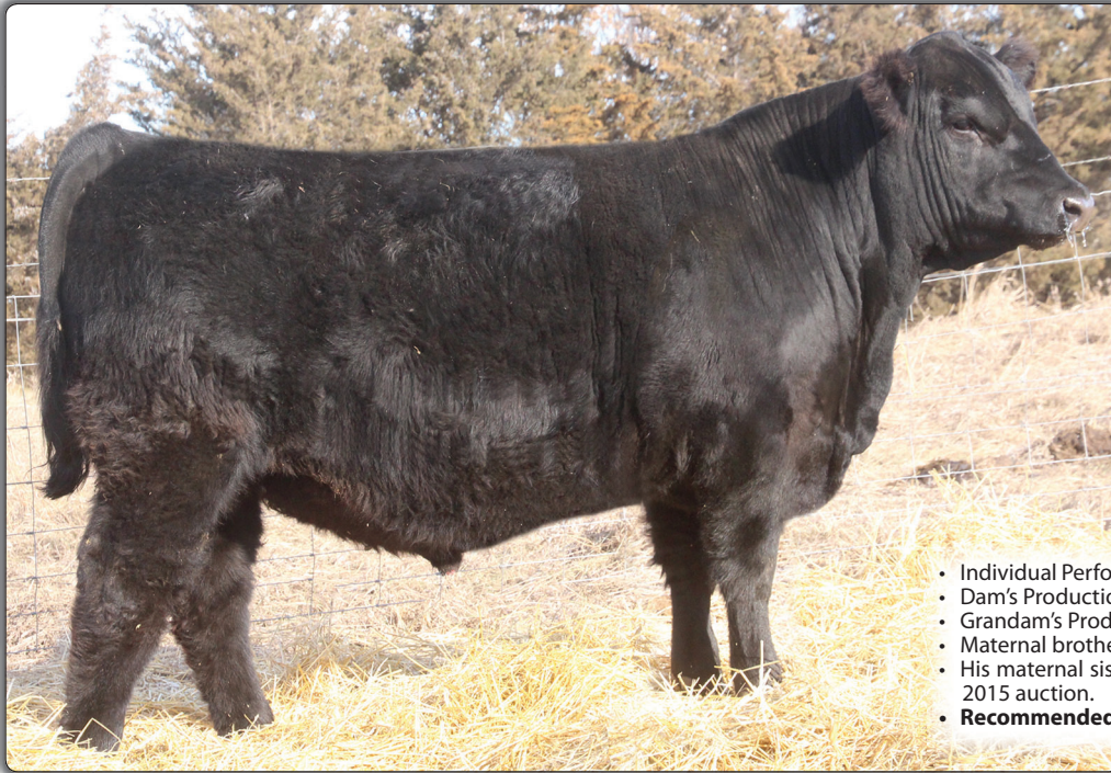
ME 3rd Dimension 698 • Lot 3