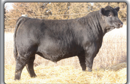
ME Silveiras Conversion 357 Maternal brother to lot 12 selected by Sumption Farms, SD