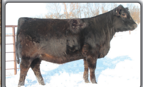
ME Marshalls Queen 346 Maternal sister to lot 38 selected by Homestead Acres, SD