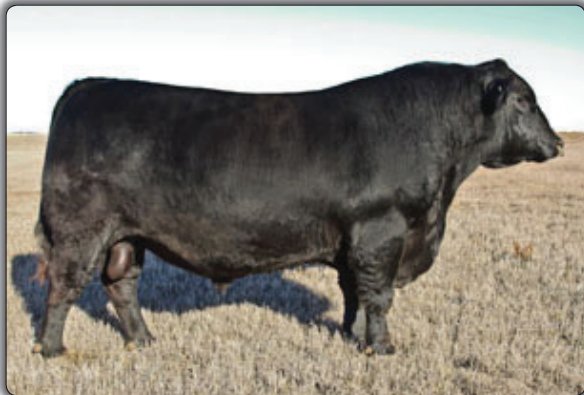
Jindra Double Vision ■ Reference Sire B