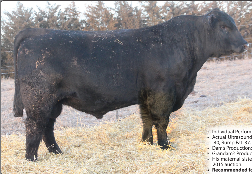
ME Double Vision 537 • Lot 95