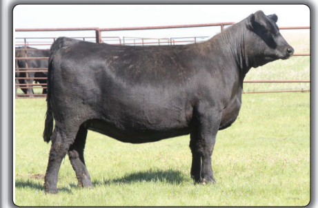
D 7008 Missy Chloe D661 Dam of Lot 69