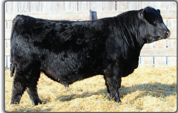
D Impression A3103 ■ Reference Sire F