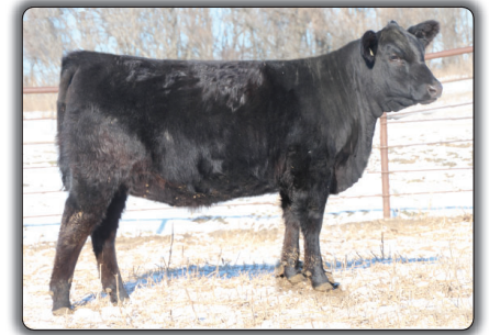
ME Black Queen 414

Maternal sister to lot 87 selected by Mason-Knox Ranch, SD