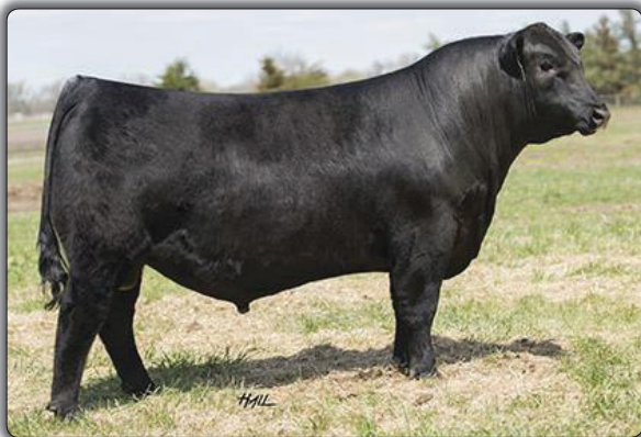
Barstow Bankroll B73 ■ Reference Sire C