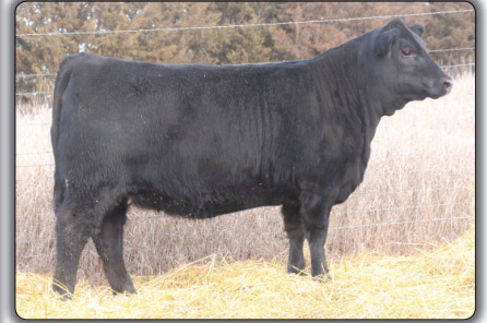
ME Queen of Crackerjack 487 Maternal sister to lot 1 selected by S&A Fredricks, SD