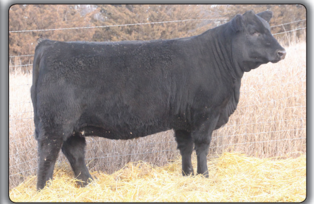
ME Queen of Crackerjack 757 Maternal sister to lot 15 selected by Sumption Farms, SD