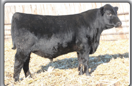
ME Sure Shot 526 Maternal brother to lot 24 selected by Ashley Pigors, SD