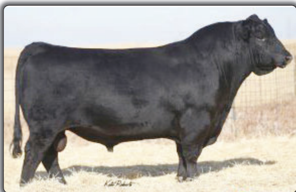
Bruns Top Cut 373 ■ Reference Sire D