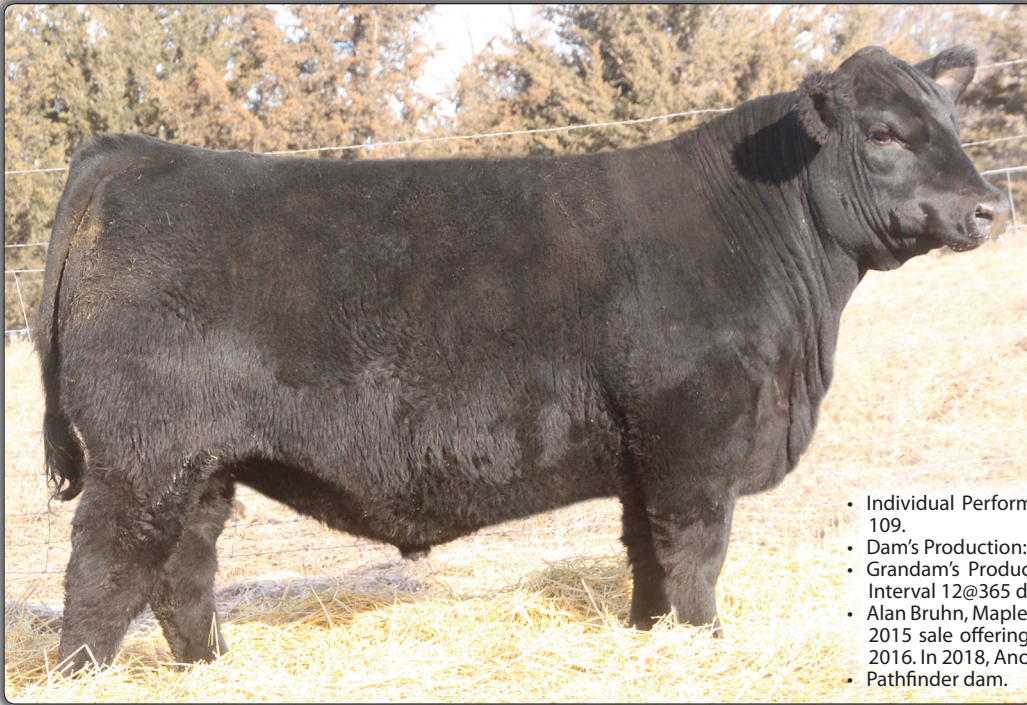
ME 3rd Dimension 728 • Lot 1