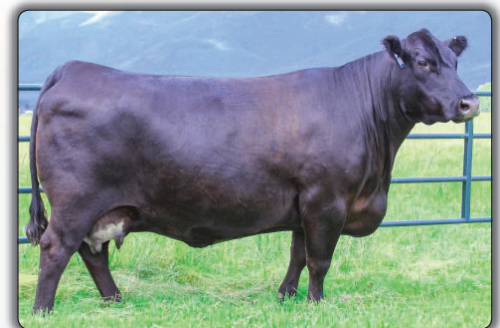
Rita 8H17 of Rita 3I10 Total Great grandam of lots 1 - 3