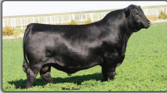
Prairie Pride Next Step 2036