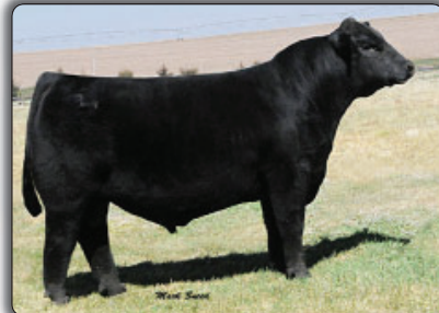
BARSTOW CASH Sire of Lots 35 - 37

Sitz Upward 307R # Sitz Everelda Entense 2665 + S AV Final Answer 0035 #* RCA Queen R42 Connealy Consensus #* Blue Lilly of Conanga 16 B/R Destination 727-928 # L H R Susie SI 1040 +