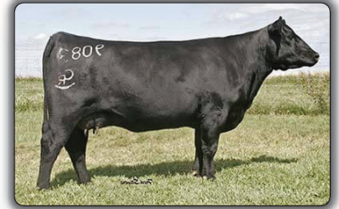
Chair Rock 5050 GAR 9083 Donor dam of Lots 45 and 46