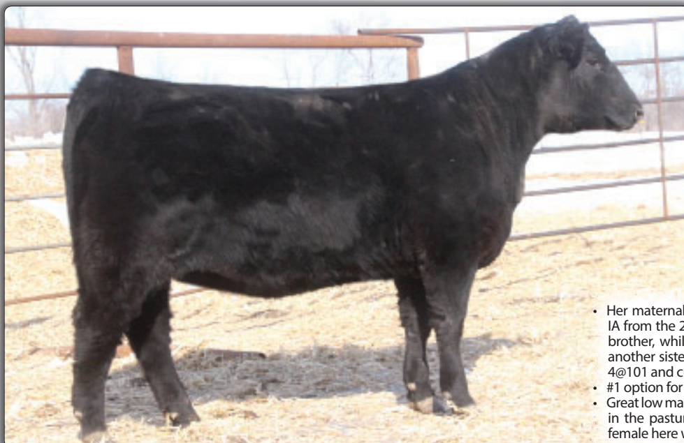
MFP Frannie 8098 • Lot 32