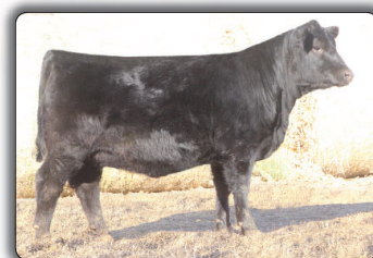
MFP Ever Entense 7502 Maternal sister to Lot 49