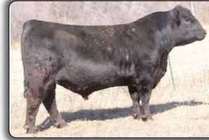
MFP Big Bang 2515