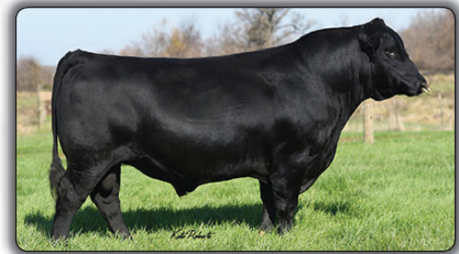
Quaker Hill Manning 4EX9 Sire of Lot 6