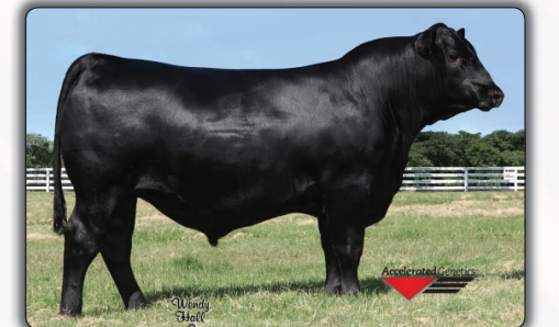
VAR Index 3282