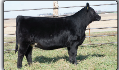
MFP Blackclass Pride 0562-646

Flush sister to the dam of Lot 6 Selected by Larry Breuel, KS