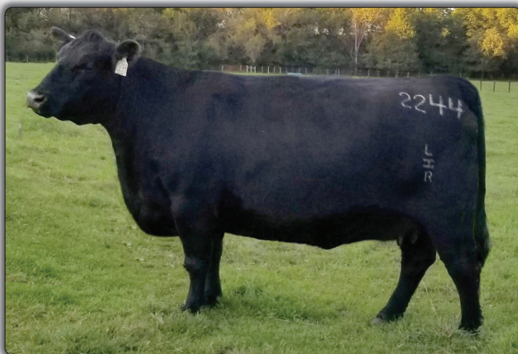
LHR Susie 6610-2244 Dam of Lots 18 - 20