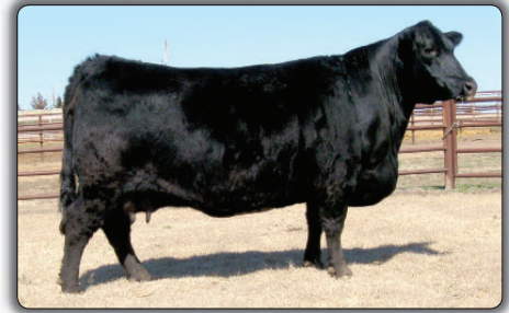
C&H Ever Entense 4070 Foundation third dam of Lot 22