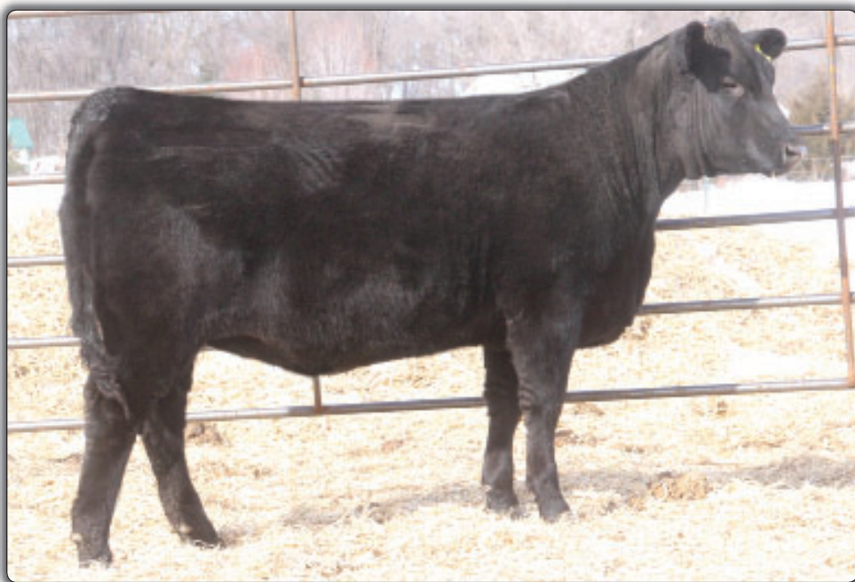
MFP Miss Pride 8412 • Lot 47