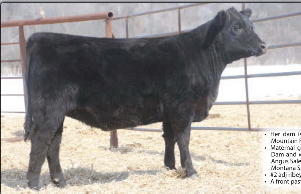
MFP Lady Ida 85X4 • Lot 34