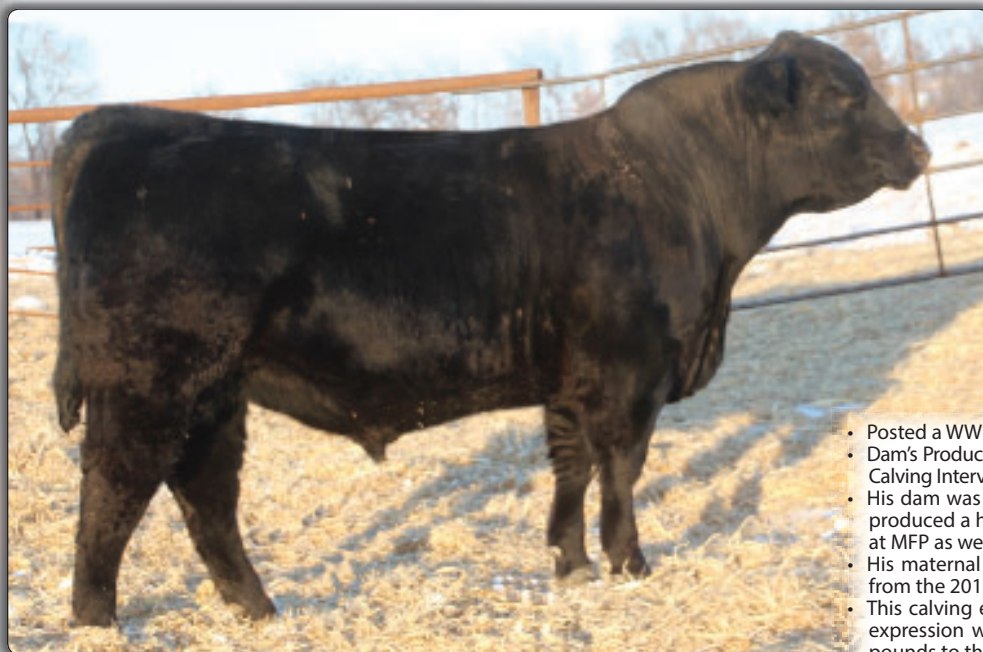
MFP Index 7101 • Lot 9