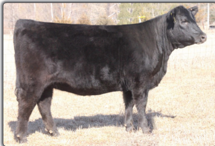
MFP Susie 7770

Maternal sister to Lot 28 Selected by Lazy H Ranch, Hays, KS