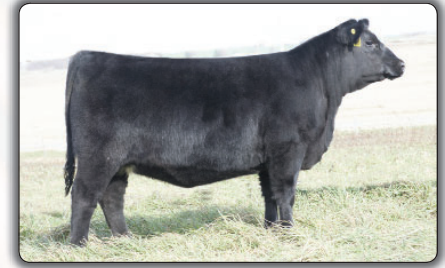
MFP Fran 6398