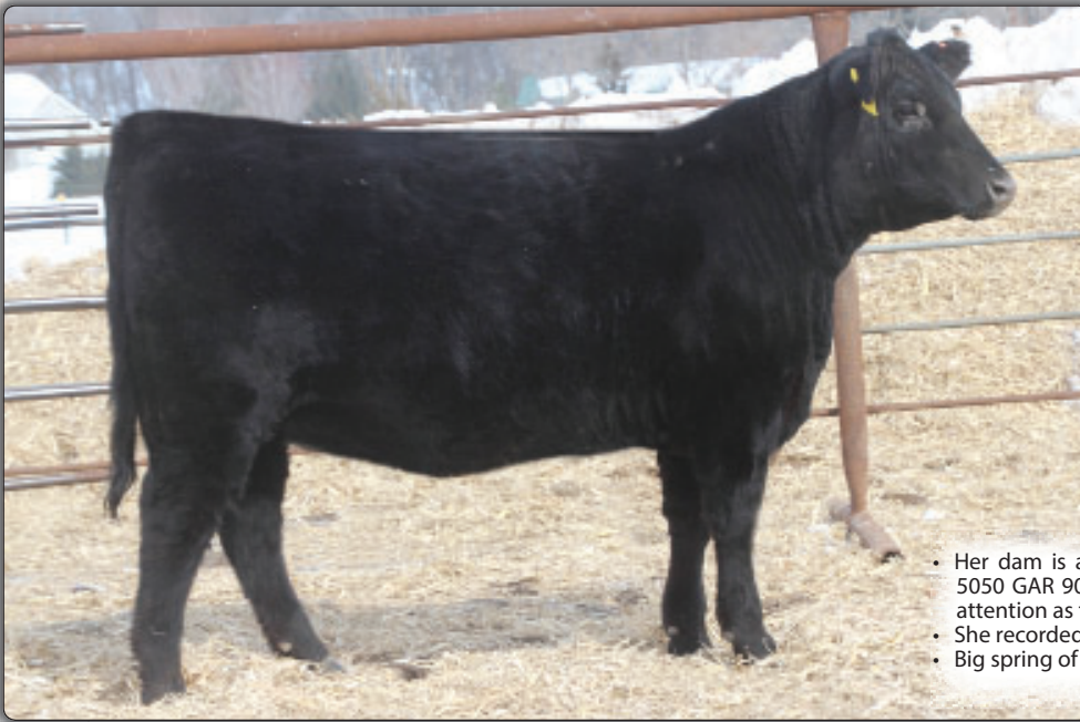
MFP Foundation Rita 8592 • Lot 33