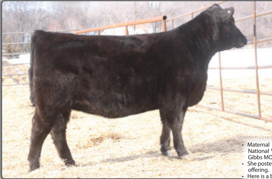
MFP Fran 8398 • Lot 31