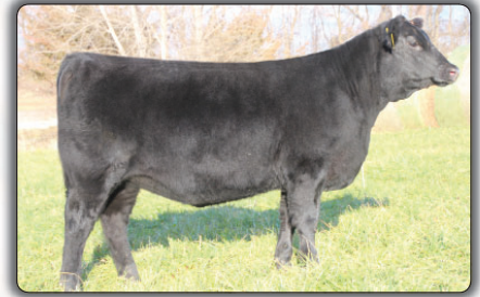
MFP Foundation Lady 546 Flush sister to Lot 45