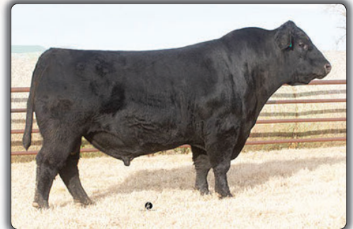
SCC Cash 6224-5128 Sire of Lots 16 and 51