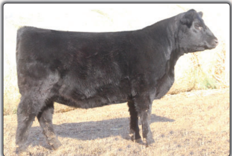
MFP Primrose Blackbird 7226 Full sister to the dam of Lot 23