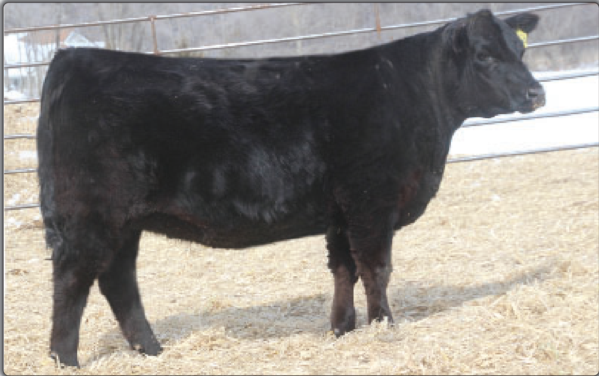
MFP SUSIE QUE 8250 • Lot 37