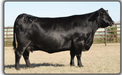
LHR Ever Entense 0214 Donor dam of Lot 21