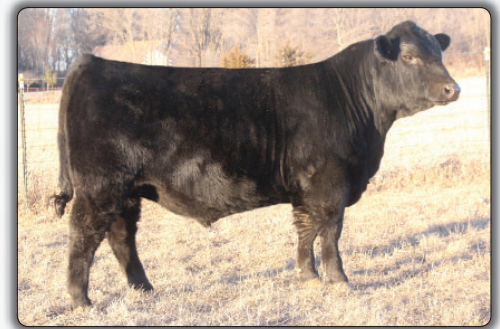
MFP MANNING 750 Maternal brother to the dam of Lots 1 - 3