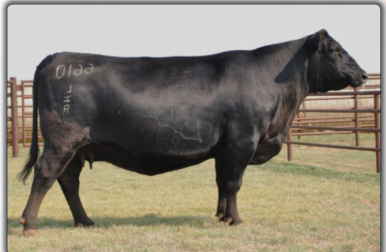
LHR Susie 6610 Grandam of Lots 35 - 37 and Bulls Lots 18-20