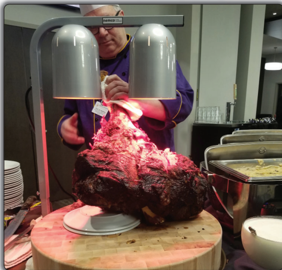
A MFP Steamship Round was the main protein featured at the UNI Local Food Group banquet