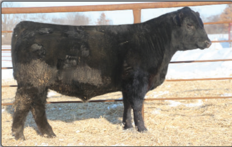
MFP Manning 8627 • Lot 6