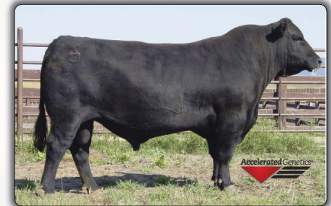
A A R 10X 7008 SA