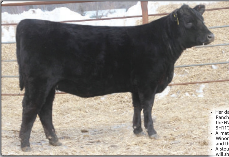
MFP Rita 8215 • Lot 41