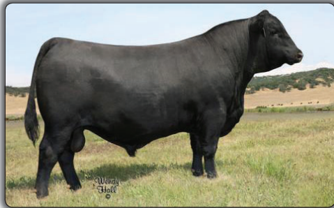
TEX Playbook 5437