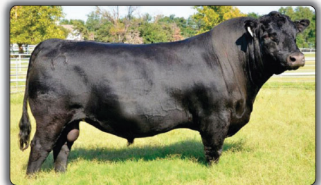
Sitz Top Game 561X Sire of Lot 7