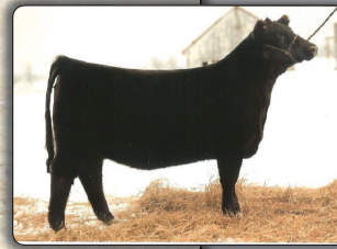
Norris Blackbird N 1007 Dam of Lots 43 & 44