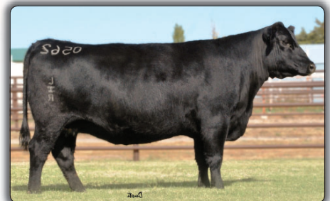
LHR Blackclass 1895-0562 Dam of Lot 7