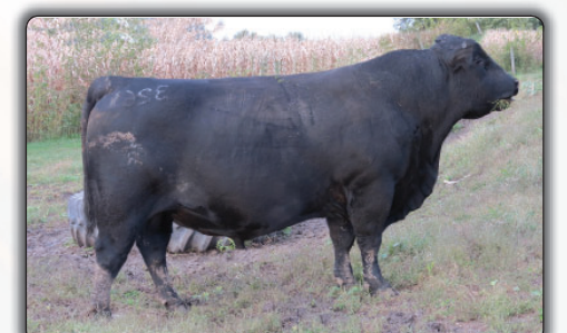
LHR Consensus 7229-3261