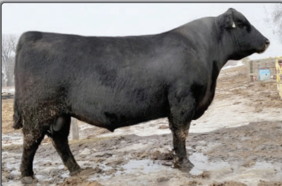
MFP Top Game 746 • Lot 7