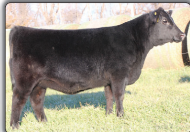
MFP Good Karma 5332 Maternal sister to the dam of Lot 48