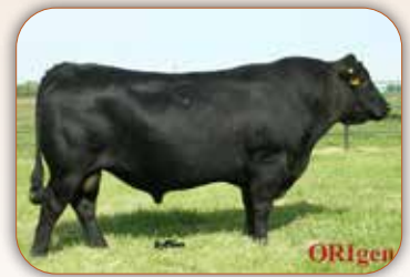
SydGen Cool 6614 Sire of Lot 119