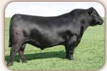
SAV Bismarck 5682 Grandsire of Lots 21-22