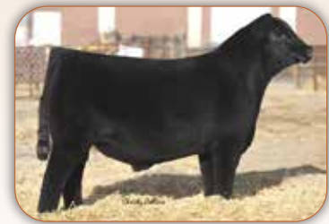
Silveiras Style 9303 Grandsire of Lot 26