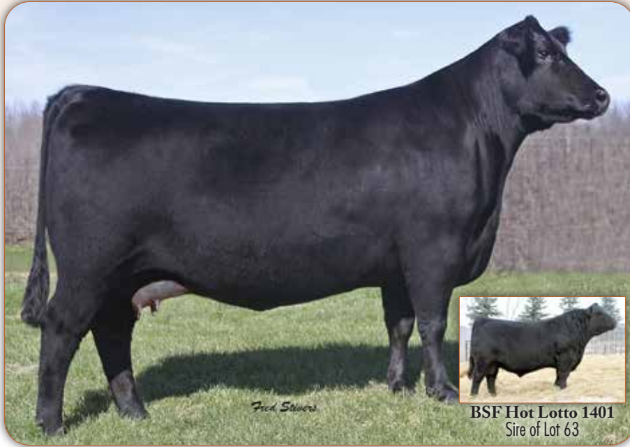
Champion Hill Georgina 7794 Donor Dam of Lot 63