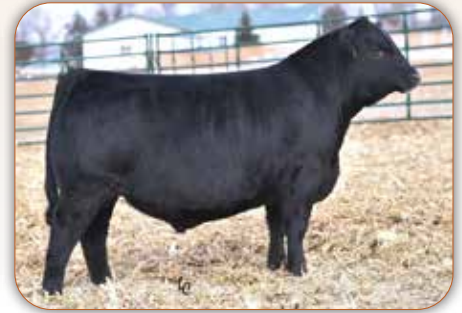
EGL Executive Order E019 Sire of Lot 146