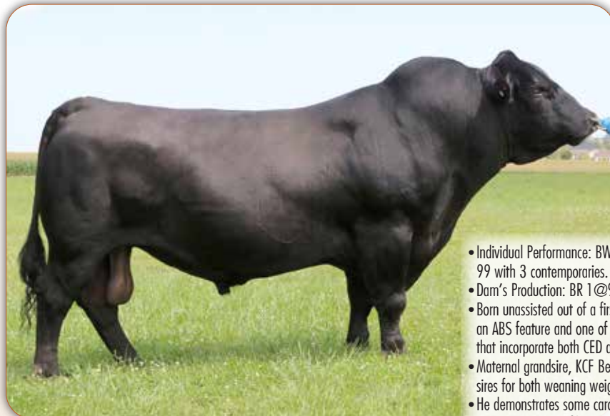
Quaker Hill Rampage 0A36