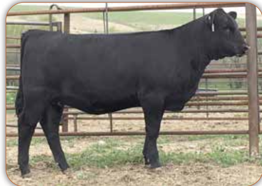
M Bar M Blackcap 057 Lot 76