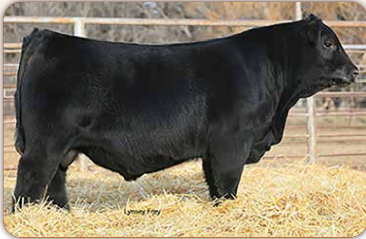
FAR Unanimous 143C Sire of Lots 16-18