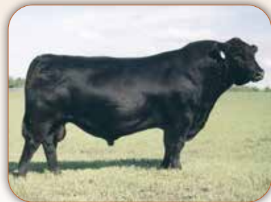
Boyd New Day 8005

Maternal grandsire of Lots 13, 14 and 15