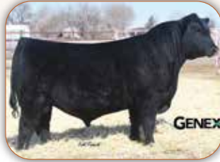
DB Iconic G95 Sire of Lot 60C