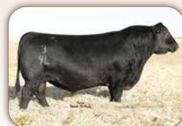
Connealy Cool 39L Grandsire of Lot 120