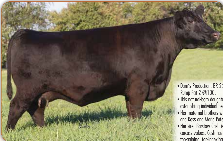
Stevenson Forever Lady 30 Dam of Lot 38 & Grandam of Lot 37