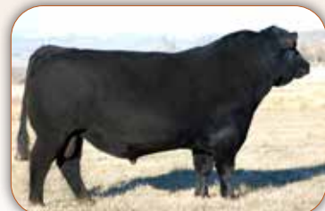
SydGen 928 Destination 5420 Grandsire of Lot 102