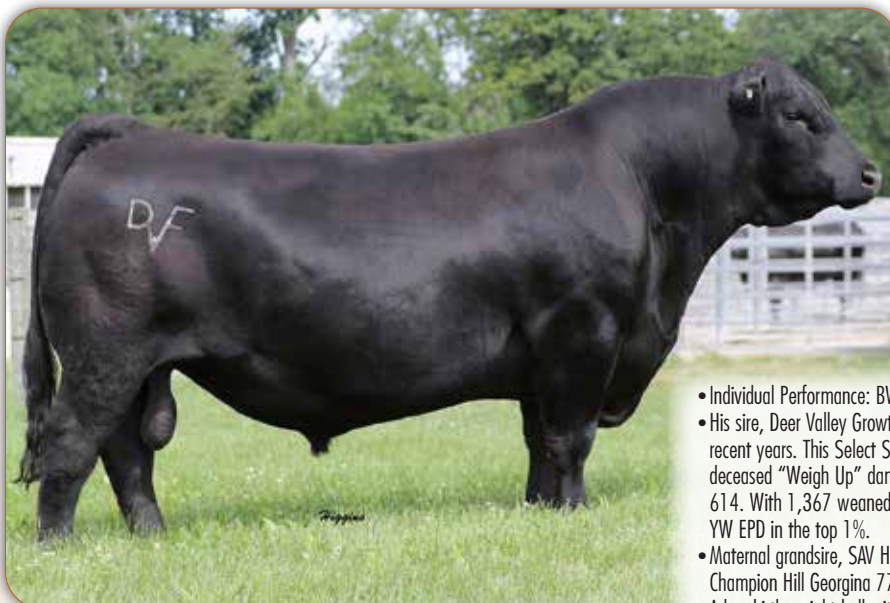
Deer Valley Growth Fund Sire of Lot 52