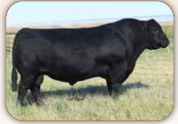
SydGen Enhance Sire of Lot 96A