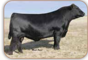
BC Classic 385-7 Great Grandsire of Lot 27