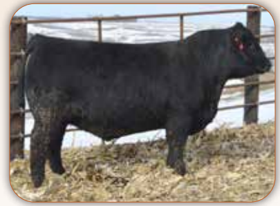
Crouch Payweight 731 Sire of Lot 43