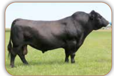
Quaker Hill Rampage OA36 Service sire of Lots 81 & 82