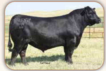
GAR Inertia Sire of Lot 5 & 6