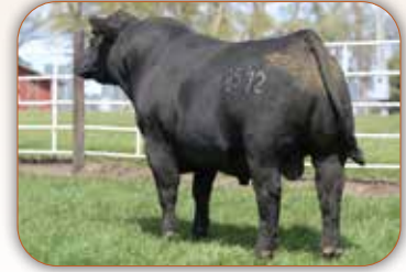
WB Pokerface 8572 Lot 1