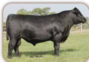
Deer Valley All In Grandsire of Lot 104A