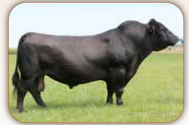
Quaker Hill Rampage 0A36 Sire of Lots 7 and 8