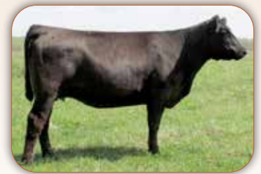
M Bar M Primrose 858 Maternal sister to Lot 85