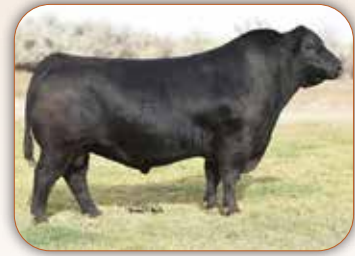
Musgrave 316 Exclusive Sire of Lot 64