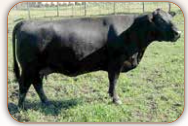
Nelson Beauty 102 Dam of Lot 35