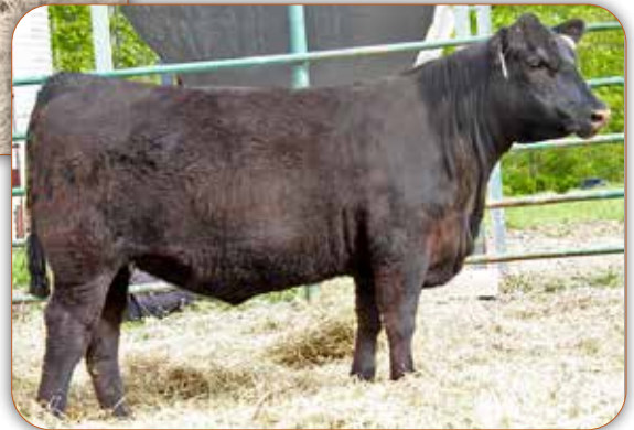
Sandy Creek Eonda G717 Daughter of Lot 91. Sells as Lot 129.