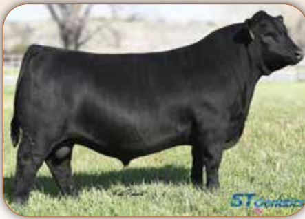
SAV Raindance 6848 Sire of Lot 62B