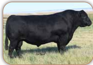
SydGen Enhance Sire of Lot 100A