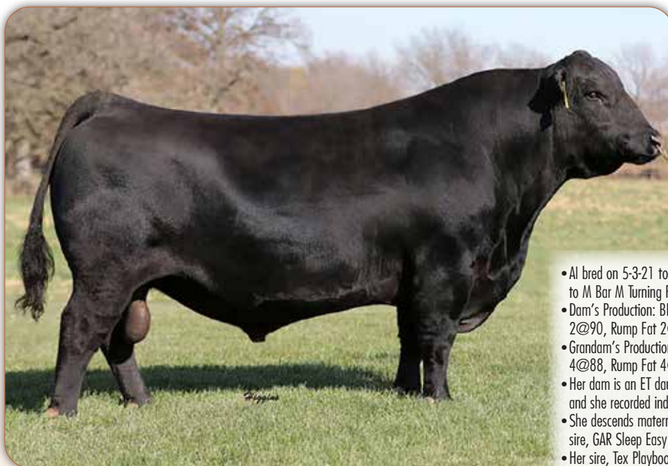
TEX Playbook 5437 Sire of Lot 80