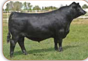
Sitz Investment 660Z Grandsire of Lot 17