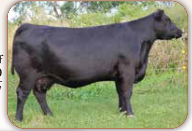
Lady Ida of Ellston G180 Grandam of Lot 17