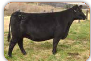
S/A Miss Emulous 7F17-177 Dam of Lot 46