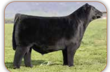
Colburn Primo 5153 Sire of Lots 20 & 25