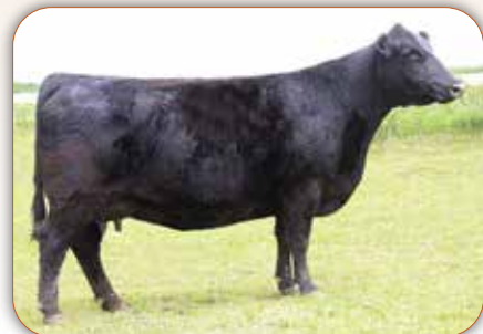
GW Blackcap 612 C Grandam of Lot 11