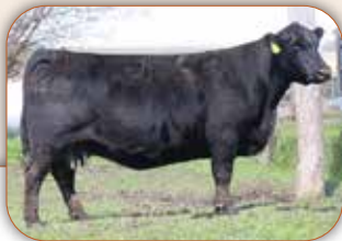
Basin Blackcap 1605 Great Grandam of Lot 11