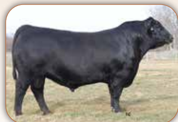
Yon Palmetto Sire of KCF Bennett Palmetto E689 the service sire of Lot 100 and many more in this dispersal.