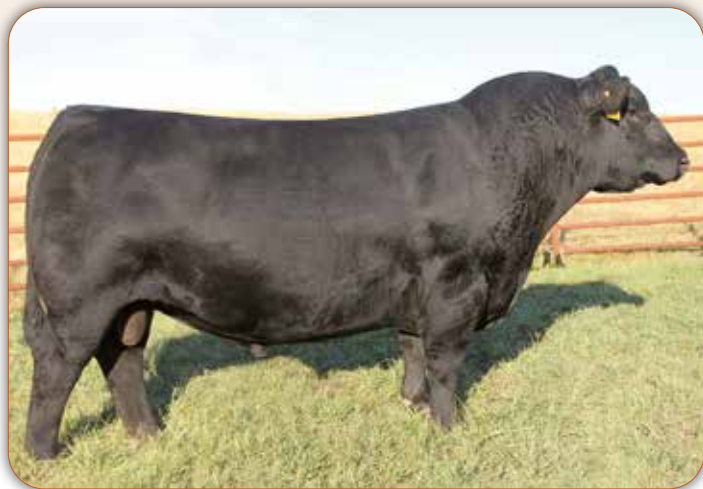
SAV International 2020 Sire of Lots 13-15