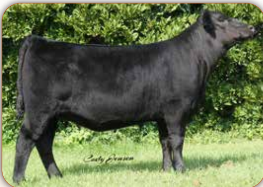
Jensen Barbara 605 Dam of Lot 64 & Grandam of Lot 65