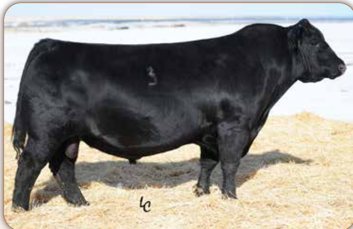
Hoover Dam Grandsire of Lot 18