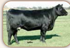
SydGen Forever Lady 0744