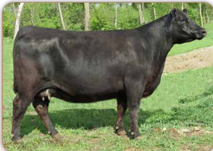
Tri-K Delia Kepstone B58 Grandam of Lot 55