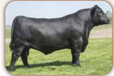
SS Niagara Z29 Sire of Lots 45 & 46