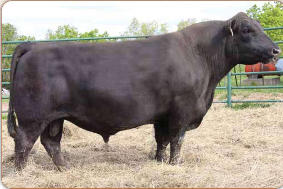
KCF Bennett Way Up Sire of Lots 101A, B, C