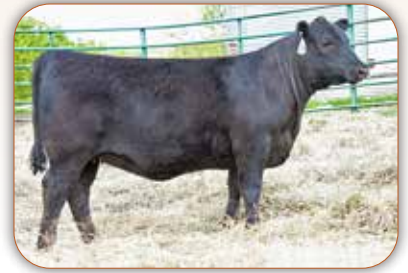
Sandy Creek Mo Barbara H824 Paternal Sister to Lot 129, and sells as Lot 120A.