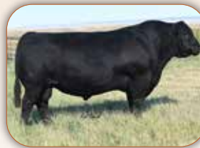
SydGen Enhance Sire of Lots 94A & 95A