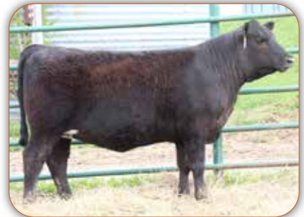
Sandy Creek Eonda H811 Daughter of Lot 91. Sells as Lot 134.