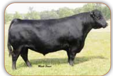
Basin Excitement Grandsire of Lot 48