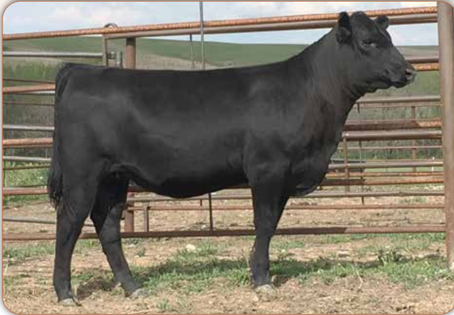
MES Burgess BG 006-850 - Lot 73A