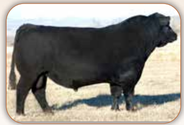
SydGen 928 Destination 5420 Grandsire of Lot 102, 103, 104