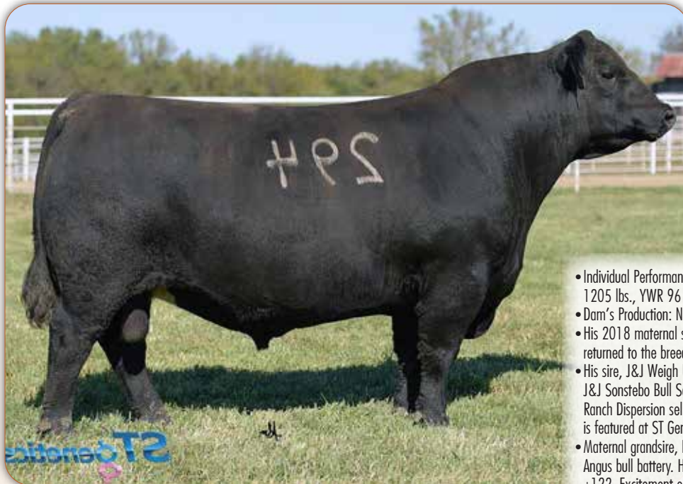
J&J Weigh Up 294 Sire of Lot 48