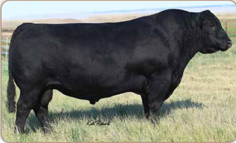
SydGen Enhance Sire of Lot 28