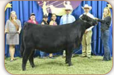
MES Burgess Beetle 650-122 2018 NJAS Sr. Champion and 5th Overall Bred & Owned Female