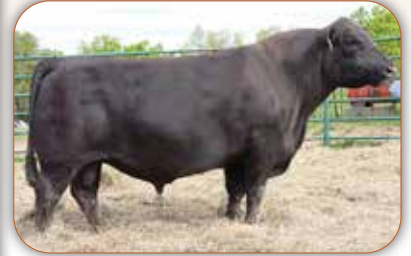
KCF Bennett Way Up Sire of Lots 134-137