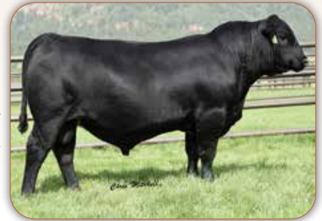
S S Enforcer E812