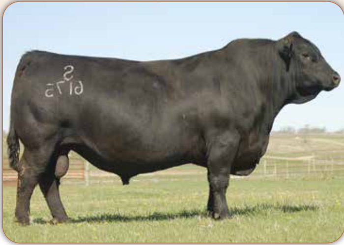
S Chisum 6175 Sire of Lot 89