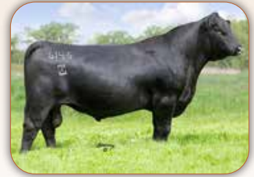
GAR Phoenix Sire of Lot 99A