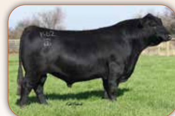
GAR Sure Fire Sire of Lot 124A