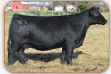
S/A Maiden 679-3100 Grandam of Lots 47 & 48