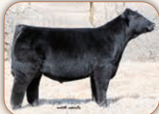
WWSC Slider Sire of Lot 73