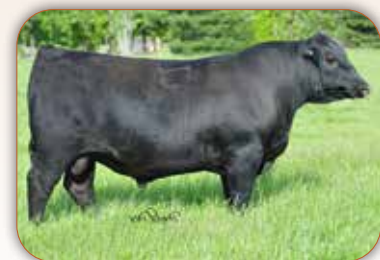
Connealy Unlimited 138X Sire of Lot 110

A memorable set of Angus females. They all sell in this dispersal.