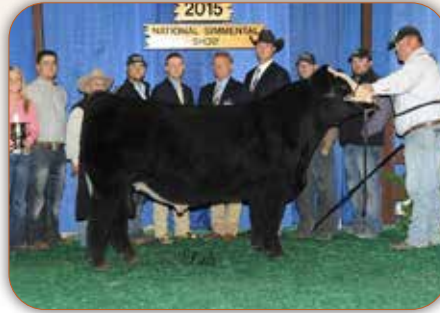
CAJS Blaze of Glory Sire of Lot 145