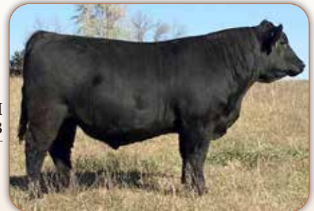
$5000 maternal brother to Lot 76, selected by Velvet Buckingham