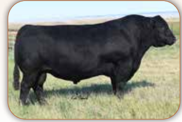
SydGen Enhance Sire of Lot 71