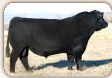
SydGen 928 Destination 5420 Grandsire of Lot 104