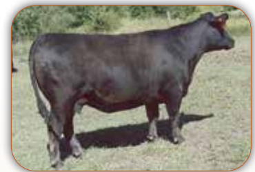
Nelson Forever Lady 316 Dam of Lot 36