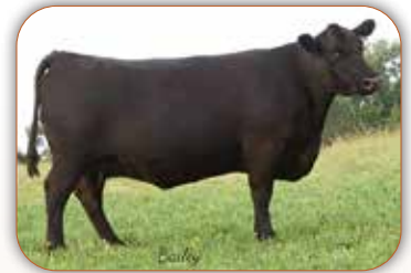
Circle G Forever Lady 2117 Grandam of Lot 38 & Great Grandam of Lot 37