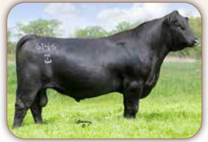
GAR Phoenix Sire of Lot 109