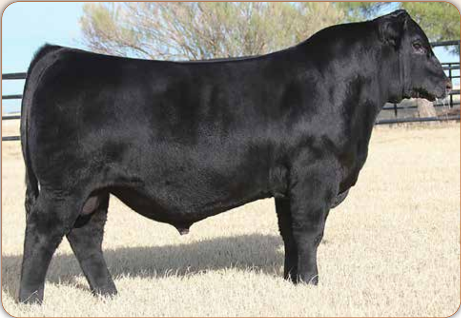
Wilks Regiment 9035 Sire of Lots 66 & 67