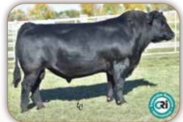
SAV Hot Iron 0941 Maternal Grand sire of Lot 52