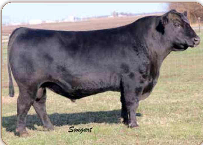
A&B Final Design 2135 Grandsire of Lot 34