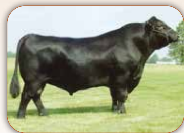
GAR Predestined Sire of Lot 116 & Grandsire of Lot 117

116 Mead Polly J137 [DDF] Born: 01-12-2010 16709670 Tattoo: J137 Cow