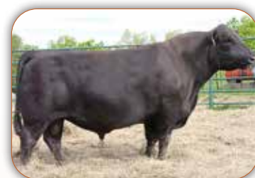
KCF Bennett Way Up Sire of Lot 120A & Service Sire of Lot 120