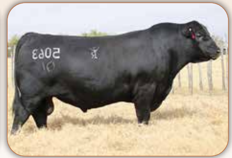
Bar R Jet Black 5063 Sire of Lot 62C