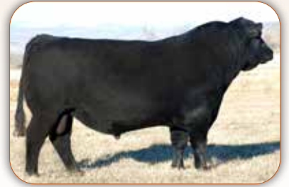
SydGen 928 Destination 5420 Grandsire of Lots 105 & 106