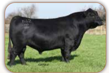
GAR Sure Fire Grandsire of Lot 112A