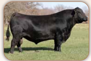
TEX Playbook 5437 Sire of Lots 83 & 84