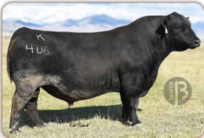
Koupals B & B Atlas 4061 Full brother to Lot 44