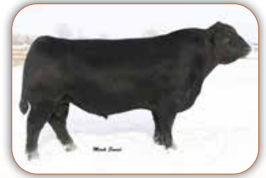
Sitz Upward 307R Service Sire of Lot 86