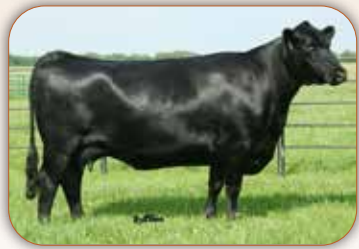
BAR Heroine 1250-454 Paternal Grandam to Lot 121