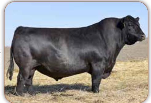
Basin Payweight 1682 Sire of Lot 61B