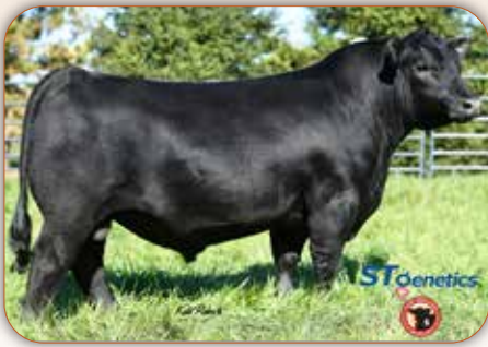
Myers Fair-N-Square M39 Sire of Lot 62A