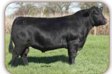
Baldridge Bronc Sire of Lot 10