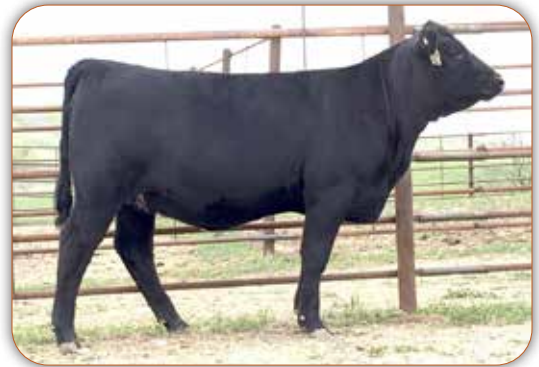
M Bar M Blackcap 052 Lot 75