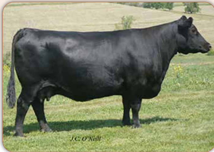
ONEills Royal Lady 28 Full sister to the great grandam of Lot 53