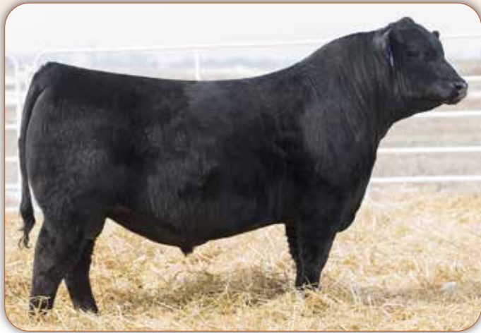
MOGCK Entice Sire of Lot 42