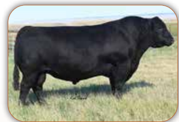
SydGen Enhance Sire of Lot 97A