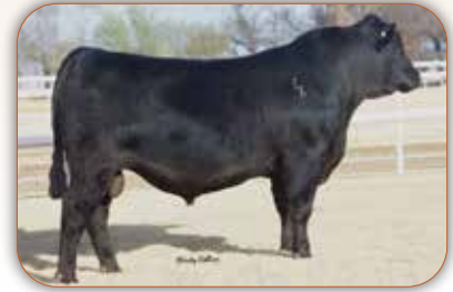
EXAR 263C Full brother to the grandam of Lot 31