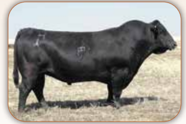
HA Image Maker 0415 Sire of Lot 114