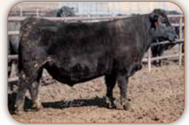
Maternal brother to Lot 38