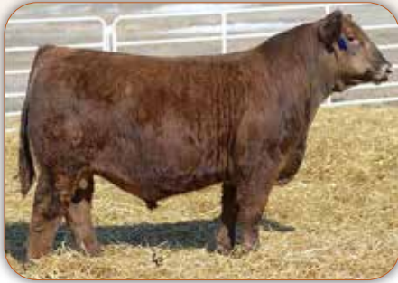
KBHR Sniper E036 Sire of Lot 144