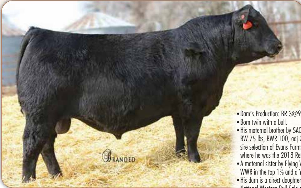
Flying V Transformer Grandsire of Lots 35-36