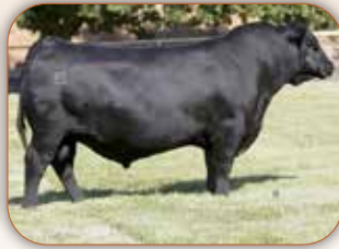
EZAR Gold Rush 6001 Sire of Lot 60B