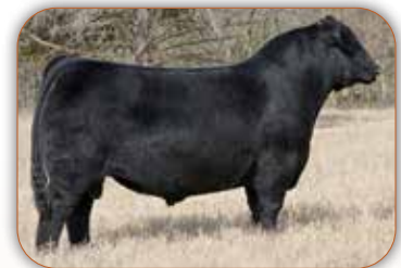
Greene Pokerface 1304 Sire of Lot 1 & 2