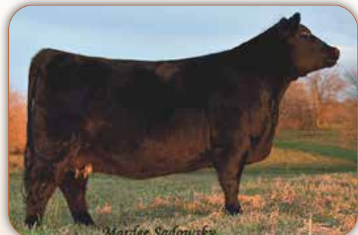
Mes Burgess Beetle 650-122 Dam of Lot 73