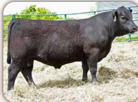
Sandy Creek Way Up H827

Paternal sister to Lot 129, sells as Lot 134.