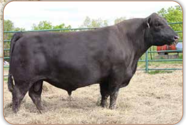
KCF Bennett Way Up Sire of Lot 129, sells as Lot 91.