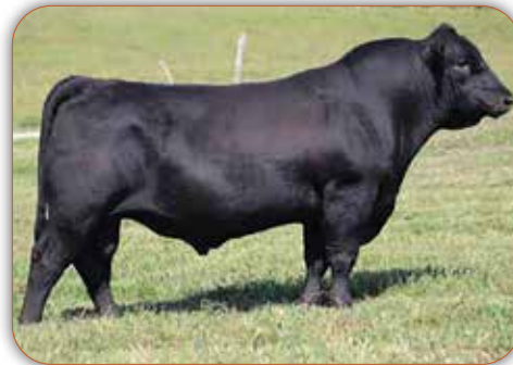
Byergo Black Magic 3348 Sire of Lot 61A