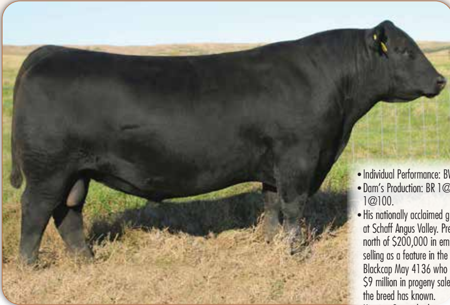
SAV Quarterback 7933 Sire of Lot 51