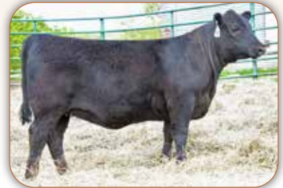
Sandy Creek MO Barbara H824 Daughter of Lot 91. Sells as Lot 120A.