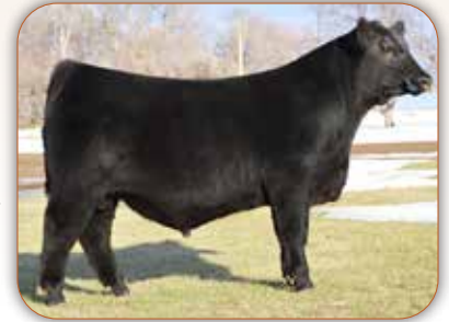
Styles Sure Thing T89 Sire of Lot 33