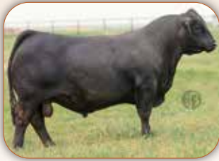
Poss Maverick Sire of Lot 60A