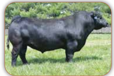
LD Capitalist 316 Sire of Lot 78 & Service Sire of Lot 80