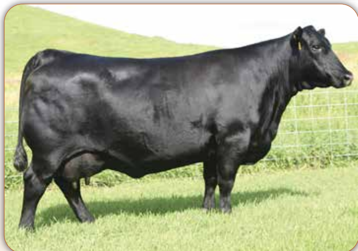
SAV Elba 1094 Grandam of Lot 12