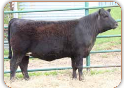
Sandy Creek Eonda H811

Paternal sister to Lot 129, sells as Lot 134.