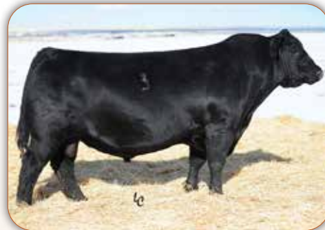
Hoover No Doubt Sire of Lot 61C