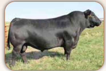
SAV Resource 1441 Sire of Lot 81