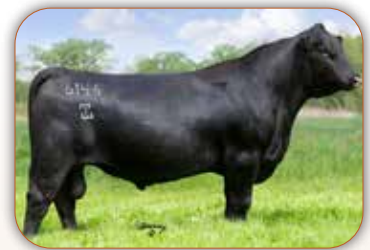
GAR Phoenix Sire of Lot 119A