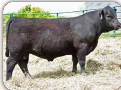
Sandy Creek Way Up H827 Son of Lot 91. Sells as Lot 123A.