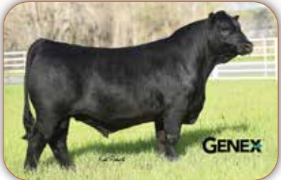
EXAR Superior Maternal brother to the donor dam of Lot 66