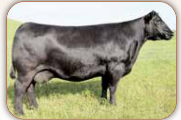
SAV Blackcap May 4136 Great Grandam of Lot 51