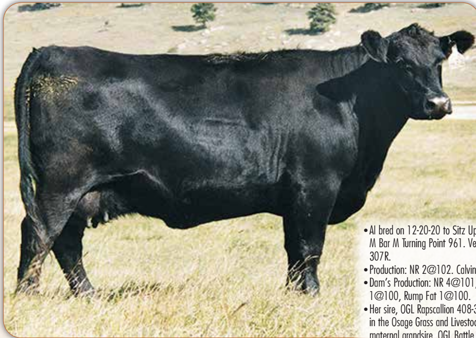
N Bar Primrose 2424 $100,000 third dam of Lot 85