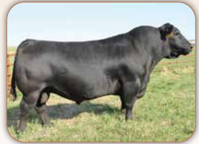
SAV Resource 1441 Service Sire of Lots 88 and 89