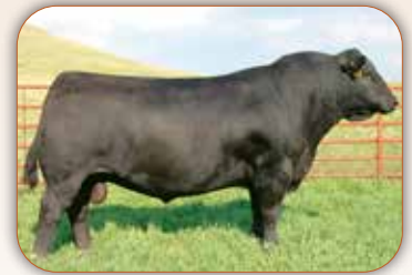
SAV Angus Valley 1867 Service Sire of Lot 77