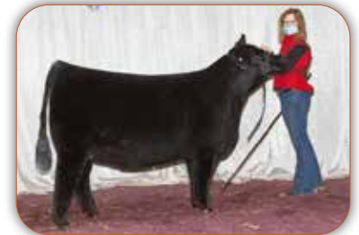
MES Burgess Beetle 910-650 Maternal Sister to Lot 73