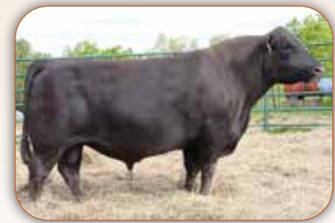
KCF Bennett Way Up Service sire of Lot 97