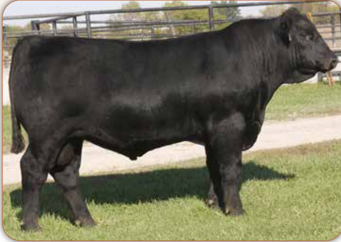
Byergo/Double GG Blackstone Sire of Lot 32