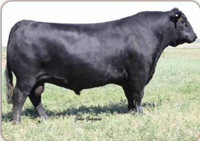
Connealy Consensus 7229 Sire of Lot 90