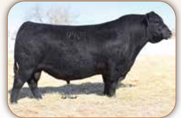
Basin Rainmaker 4404 Sire of Lots 19 & 24