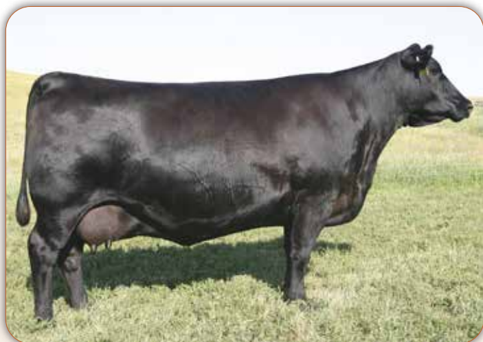
SAV Primrose 4281 Dam of Lots 13-15