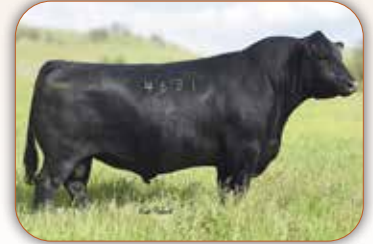
3F Epic 4631 Sire of Lot 9