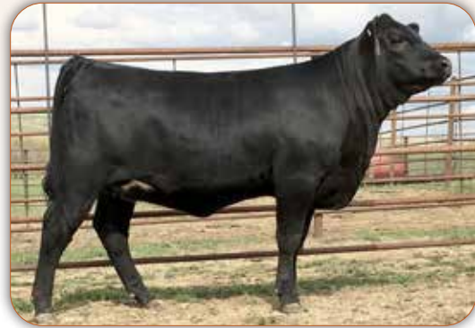
M Bar M Blackcap 054 Lot 74