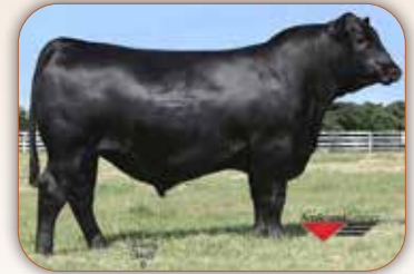
VAR Index 328 Service Sire of Lot 79