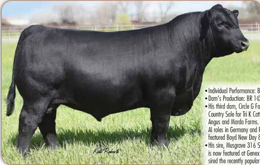
Musgrave 316 Stunner Sire of Lot 37