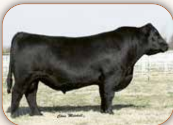
Plattemere Weigh Up K360