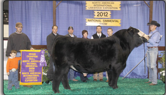
MR HOC Broker Sire of Lot 119A Embryos