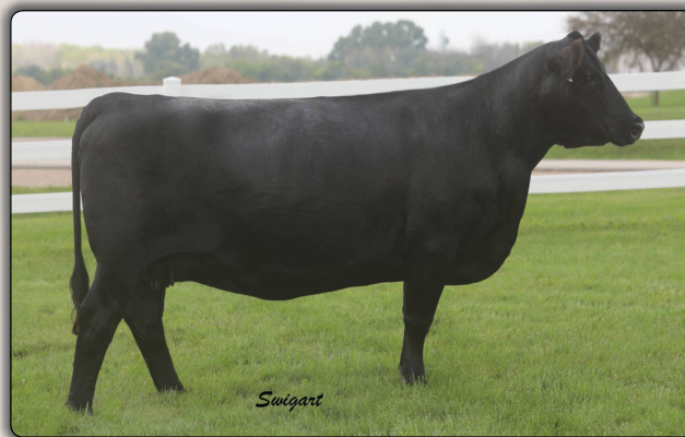
S/A Lass 191-1193 Lot 99