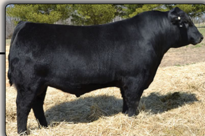
Musgrave Aviator Sire of Lot 23