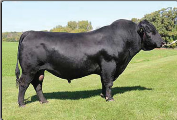
Quaker Hill Rampage 0A36 Sire of Lot 477