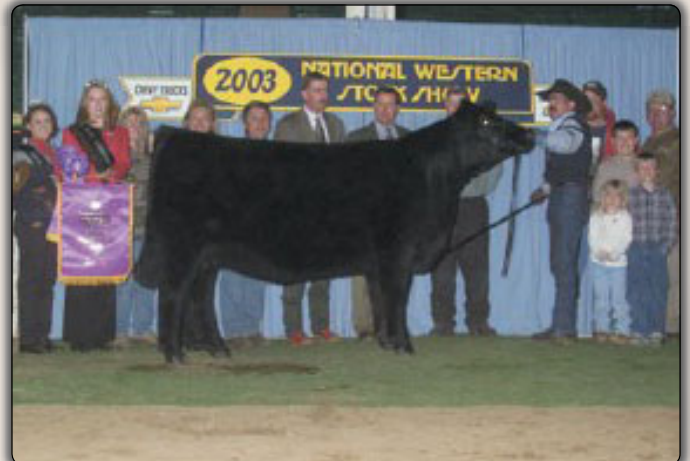
Greens Princess 1012 NWFFS Grand Champion and maternal grandam of Lot 58