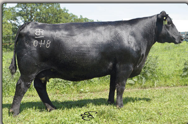
RB Lady Focus 303-840 Grandam of Lot 21