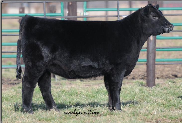
Driessen Blackcap 511 $5000 maternal sister to Lot 28