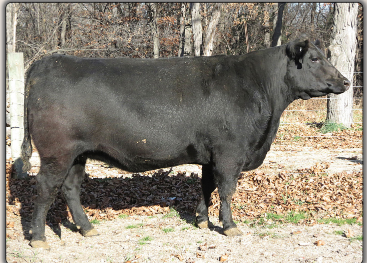
Tri-K Karisma Klair A54