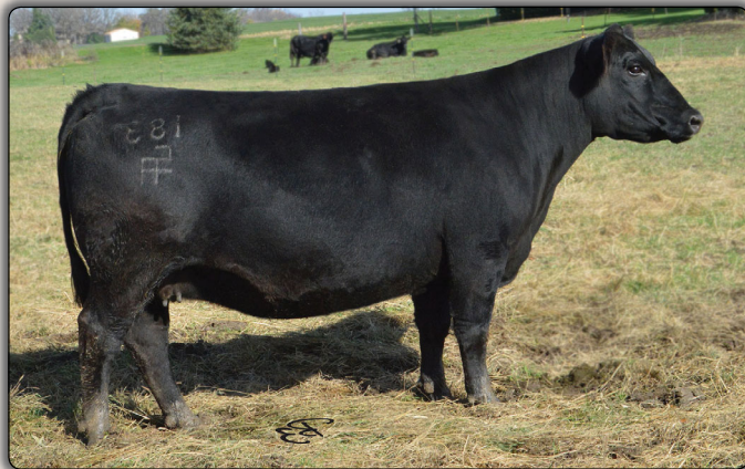
S/A Forever Lady 2231-183 Grandam of Lot 95