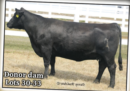
Donor dam Lots 30-33