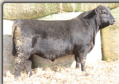
DAR Priority 605 $4000 maternal brother to Lot 28