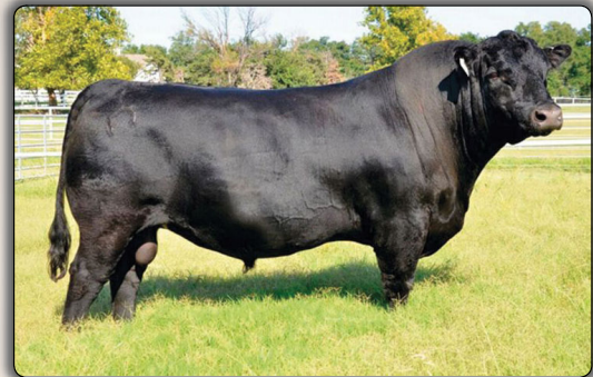
Sitz Top Game 561X Sire to Lot 47