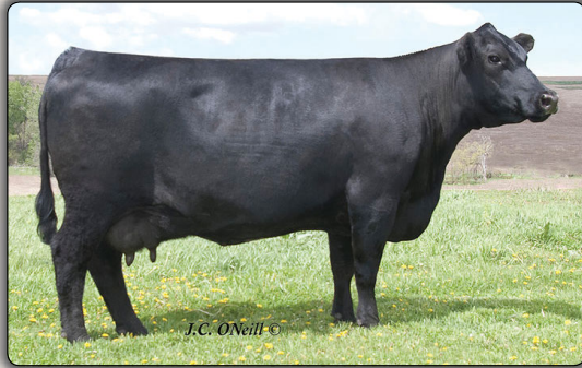
ONEills Royal Lady 38 Paternal grandam of Lot 77