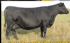
SAV BLACKCAP MAY 1782 Dam of SAV Elongate 7901