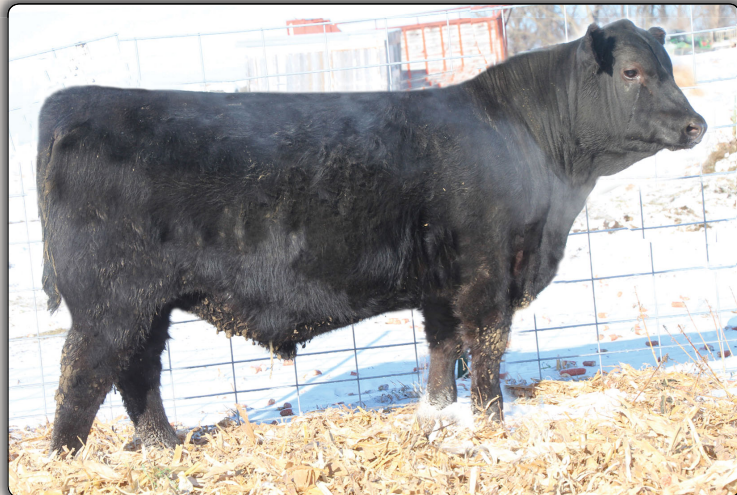
DAR Bullseye 446 $4750 maternal brother to Lot 27