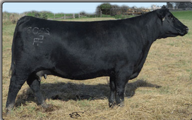
S/A Gammer 3230-2203 Donor dam of Lot 0127