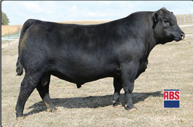
Gaffney Competitor 361 $50,000 full brother to the dam of Lot 00