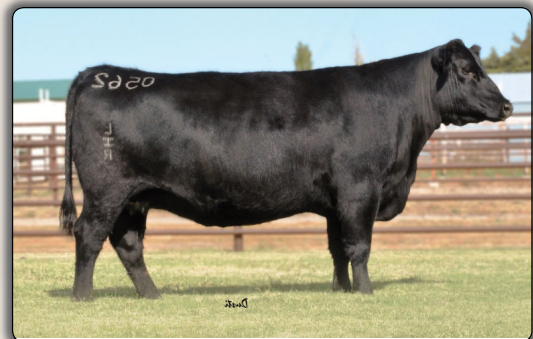
LHR Blackclass 1895-0562 Donor dam of Lot 47

Maternal brother to Lot 47 at Simons Cattle Co, IA