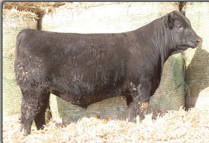
DAR Ten Speed 708