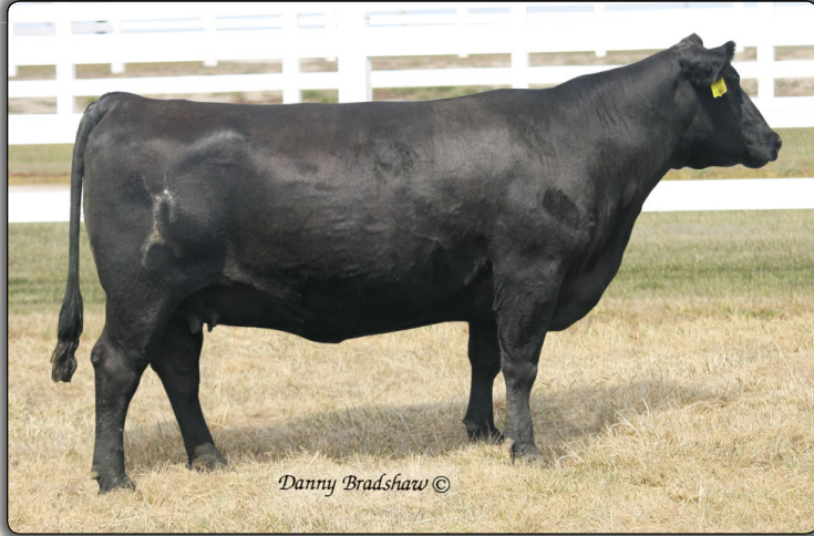
Danny Bradshaw ©