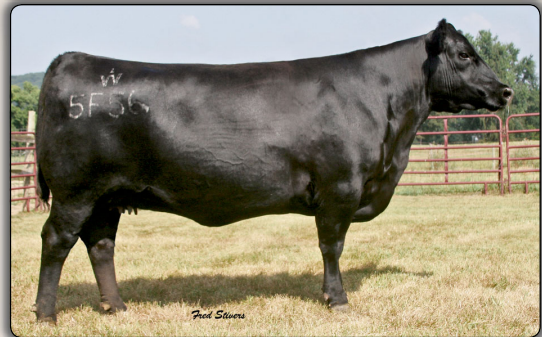
Rita 5F56 of 1I98 FD Paternal grandam of Lots 79 & 80