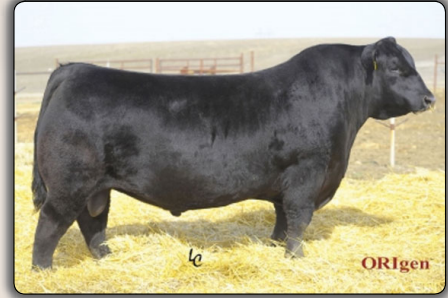
RB Tour of Duty 177 Sire of Lot 34