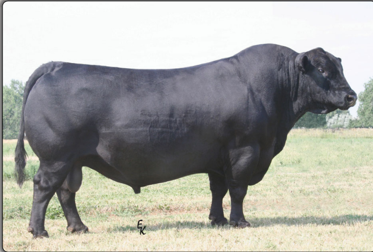
SAV Final Answer 0035 Grandsire of Lots 100, 101, 103 & 105