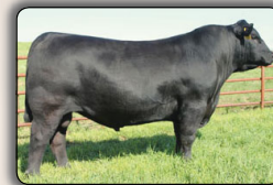
SAV Ten Speed 3022 Sire of Lot 79 A