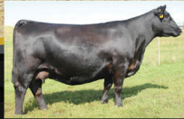
SAV EMBLYNETTE 1072 Dam of SAV Allegiance 6277