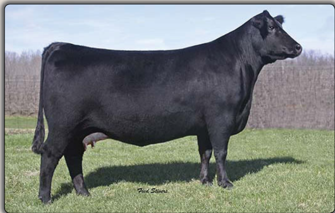
Champion Hill 7794 Lot 120A Donor

Choice of Flush to Bull of Buyers Choice - Must be completed before Dec 31, 2019 Guarantee of 6 freezable quality embryos - no cap Buyer pays all flush and freeze or transfer expenses - no board fees applied.