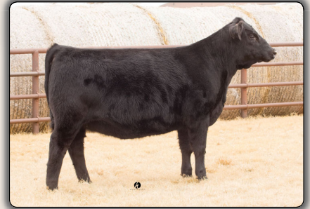
LHR Blackclass 0562-7101 Maternal sister to Lot 47