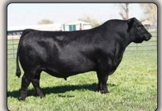
Boyd Gun Powder 2070 Sire of Lot 20