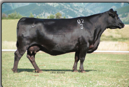
Sitz Everelda Entense 023 Maternal grandam of JJ Scheckel Waylon B61