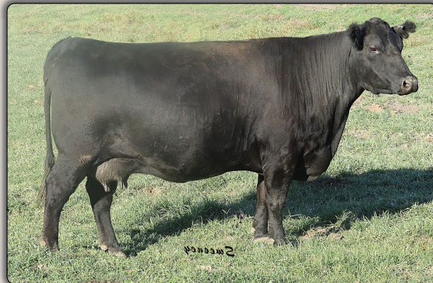
GAR Objective 3559 Dam of Lot 109