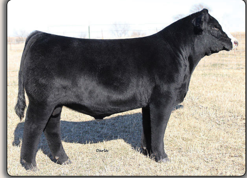
MR TR Hammer 308A ET