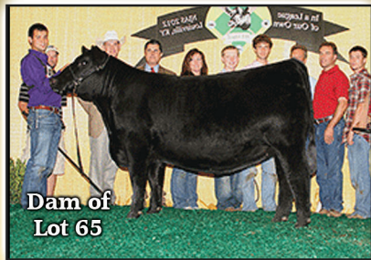
Dam of Lot 65