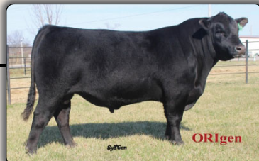
SydGen Enhance Service sire of Lot 68