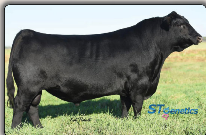
MGR Treasure Sire of Lot 21