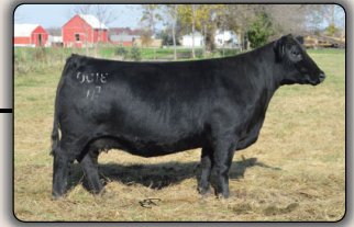
S/A Maiden 697-3100 Grandam of Lot 94