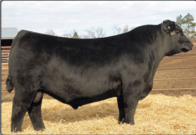
SAV Sensation 5615 Sire of Lots 57 & 59