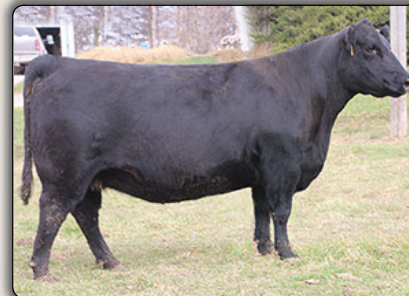
GW Kirsten 008