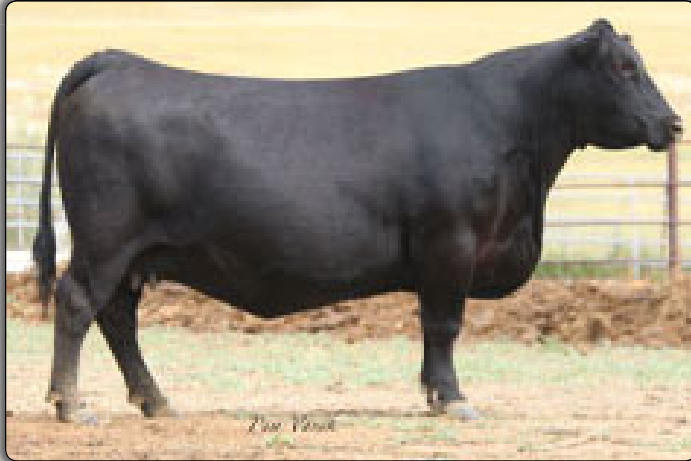
Mill Coulee Barbara K 905 Pathfinder grandam of Lot 66