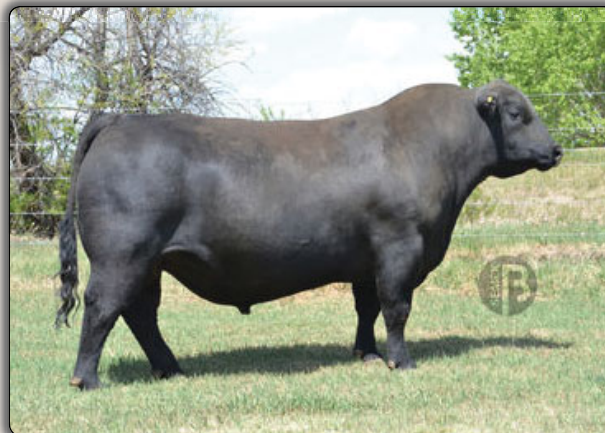
Bushs Easy Decision 98 Sire of Lot 22