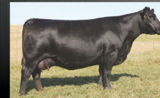
SAV BLACKCAP MAY 5530 Dam of SAV Igniter 7940