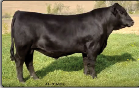
ONeills Expedition 651 Sire of Lots 82, 84, & 85