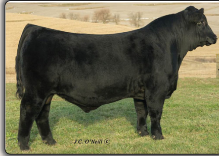
ONeills Black Bardolier Sire of Lot 83A & 84A