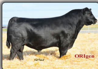
Mill Coulee Pay Raise Full brother in blood to the dam of Lot 66