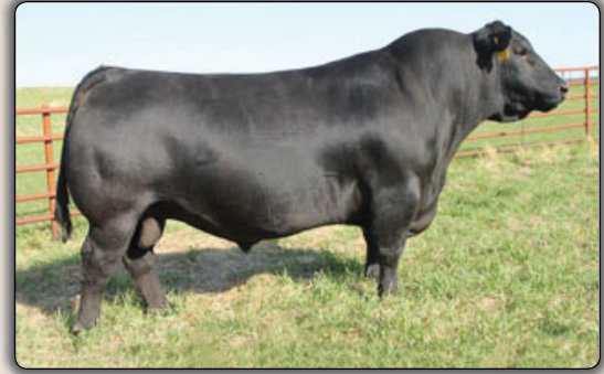
SAV Resource 1441 Sire of Lots 87A, 88A, & 89A