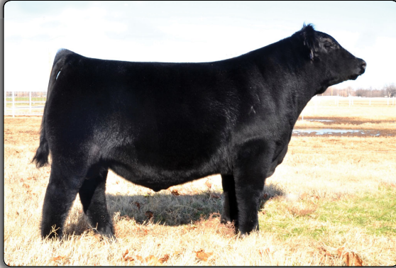
EXAR Classen 1422B Sire of Lot 60