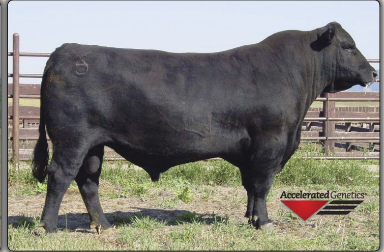
AAR Ten X 7008 SA Sire of Lot D165