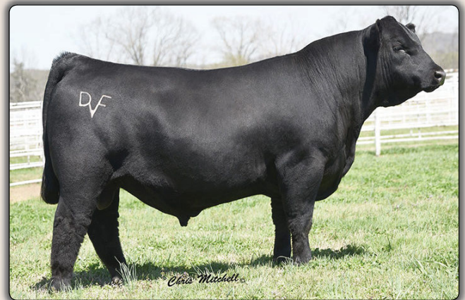
Deer Valley Growth Fund Service sire of Lot 111