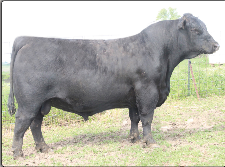
NAF Ten X 509 $4500 maternal brother to Lot 52