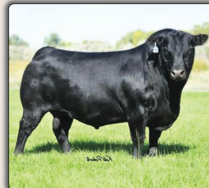
LD Capitalist 316 Service sire of Lot 102