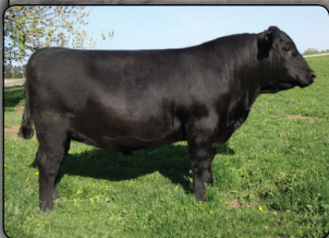
JM Ranch Harmony 475 $5,000 maternal brother to Lot 41