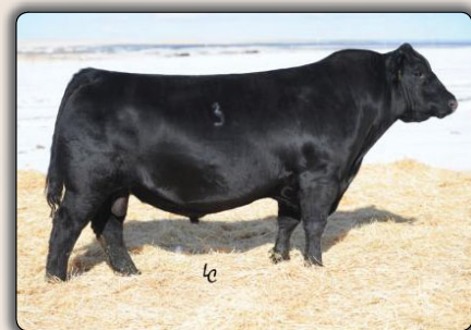
Hoover Dam Sire of Lot 17