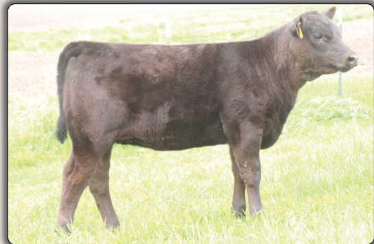
BTC Kirsten 918