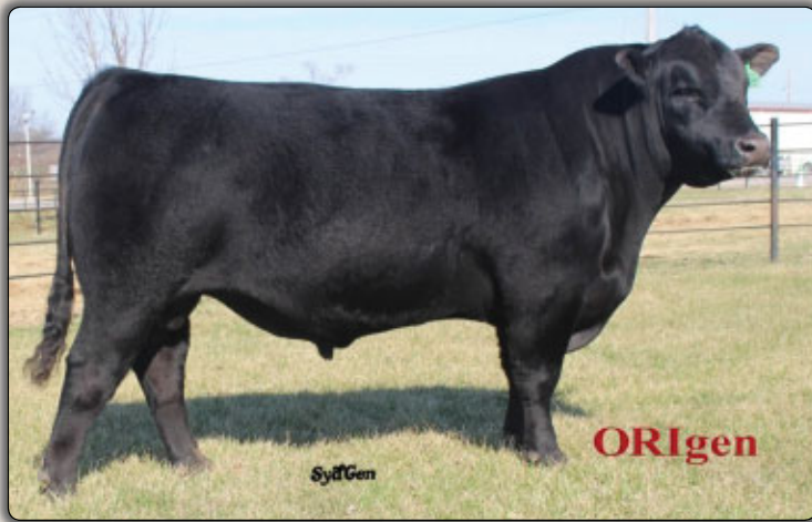
SydGen Enhance Sire of Lot 117 Embryos