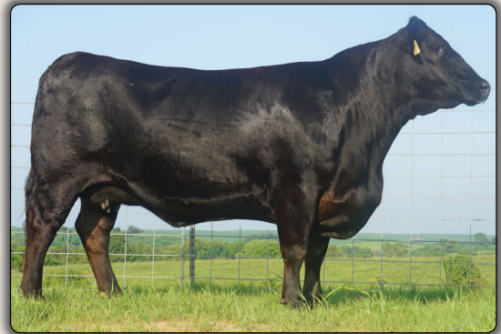
SAV Emblynette 5454 Dam of Lot 75