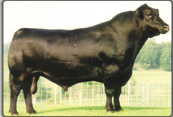
Leachman Saughatchee 3000C Sire of Lot 62 and 63