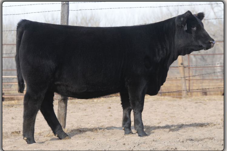
Baldco Everelda Entense 474 $15,000 full sister to JJ Scheckel Waylon B61