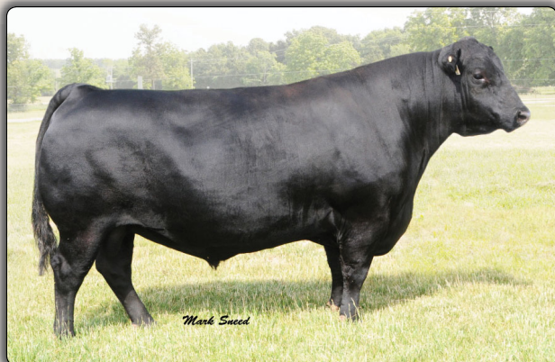
Basin Excitement Grandsire of Lot 107

1156 Oak St. PO Box 156 Atalissa, IA 52720 Lots 109-110