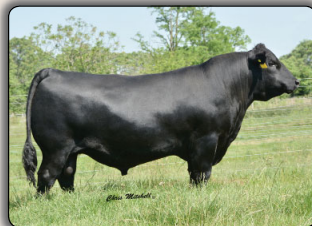
KCF Bennett Citation Sire of Lots 18 & 19