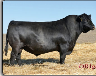
Basin Payweight 1682