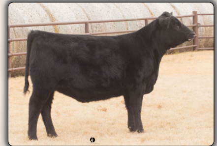
LHR Blackclass 0562-7104 Maternal sister to Lot 47