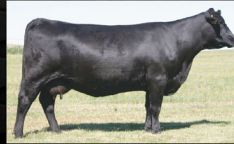
SAV MAY 2397 Dam of SAV Atmosphere 6600