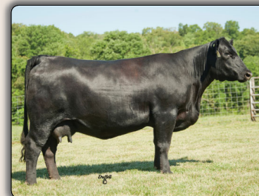
Whitestone Enamel C242

Sire: Whitestone Blade 6253 BW: 77 lbs. CED BW WW YW MILK +1 +3.1 +58 +101 +26