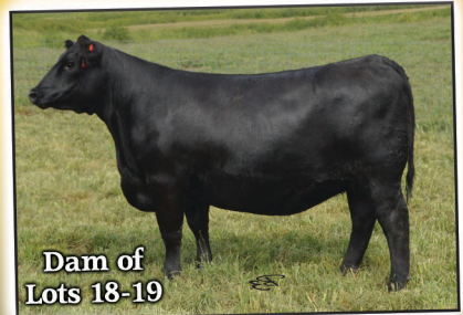
Dam of Lots 18-19