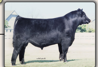
EXAR Lutton 1831 Full brother to the dam of Lot 62