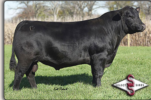
Baldrige Bronc Sire of Lots 52 & 53