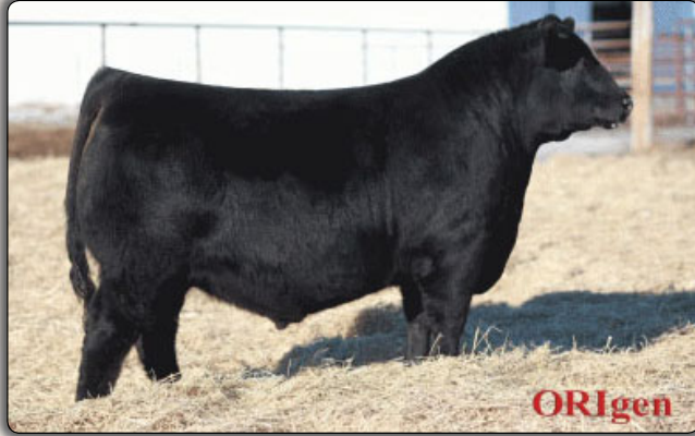
Brooking Bank Note 4040