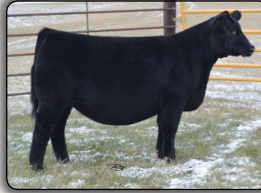
S/A Maiden 3100-3307 $10,000 maternal sister to the dam of Lot 94