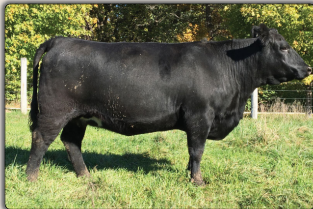
Da Es Ro Everelda 13219 Lot 120C Donor