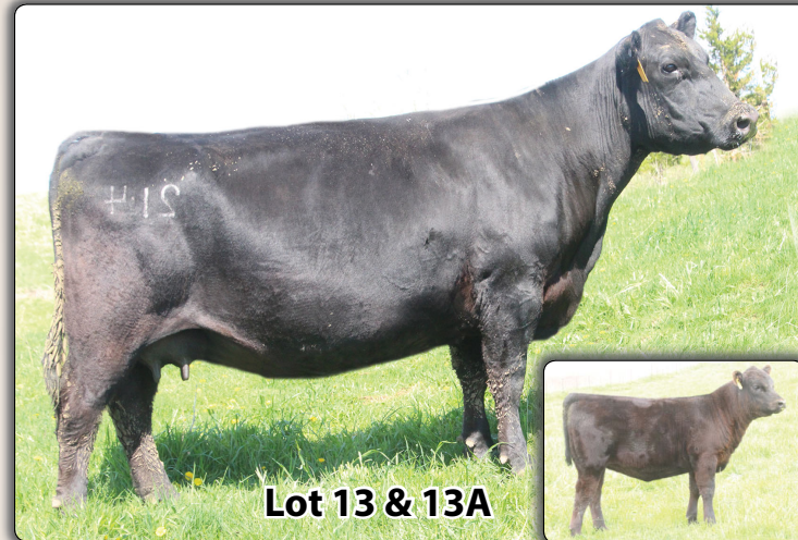
Lot 13 & 13A