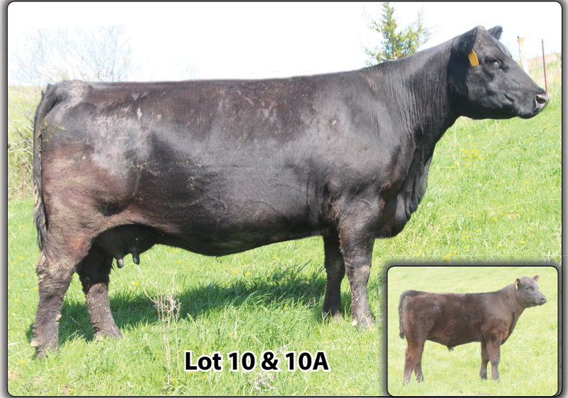
Lot 10 & 10A