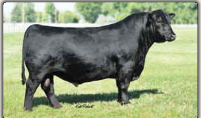
Bruns Blaster Sire of Lot 111A