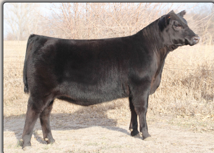
CAF Barbaramere 2931

Grandam of Lot 25 Pictured as a yearling at the 2012 NWFSS