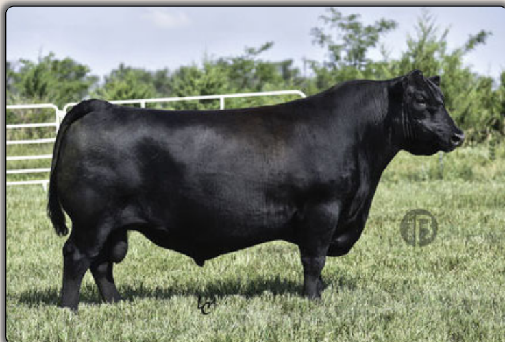
Mohnen South Dakota 402 $120,000 sire of Lot 27