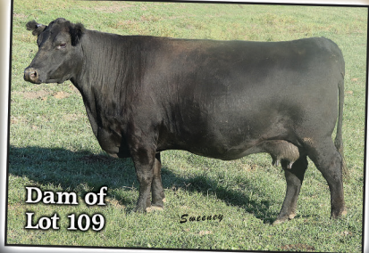
Dam of Lot 109