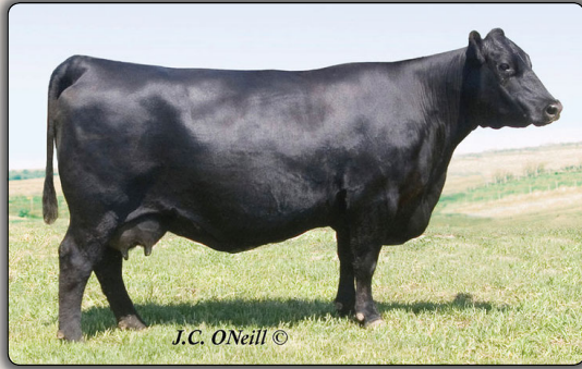
ONeills Royal Lady 40 Paternal grandam of Lot 81