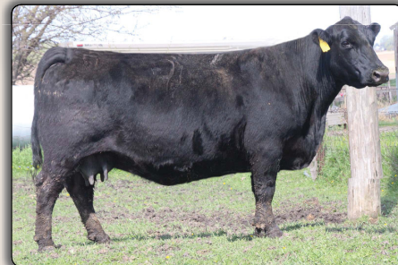
Basin Blackcap 1605 Dam of Lot 16