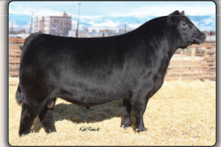
Musgrave Sky High 1535 Sire of Lot 14A