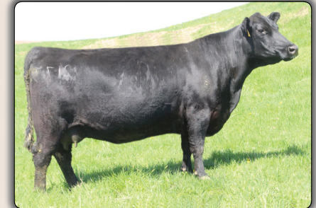
BTC Cindy 217 Dam of Lot 15, grandam of Lot 15A