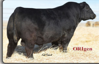
ICC Pay Raise 4886 Service sire of Lot 67