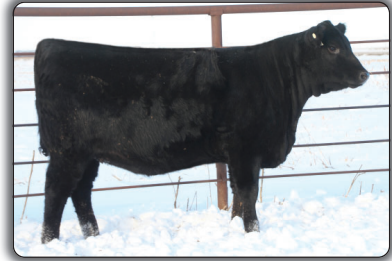
ME Black Queen 326 Maternal sister to lot 27 selected by Macey McNeil LaVoy, SD