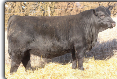
ME Bankroll 107 Maternal brother to lot 39 selected by Loren Helmer, SD