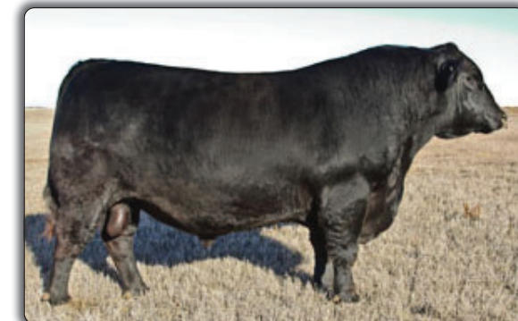
Jindra Double Vision Sire of Reference Sire E