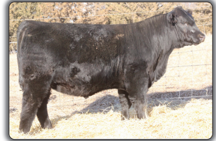
ME Double Vision 5 248 Maternal brother to lot 62