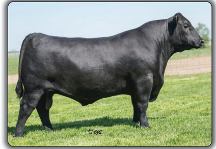
SS Niagara Z29 Reference Sire B