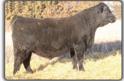
ME Open Range 527 Maternal brother to lot 104 selected by Dakota View Farms, SD