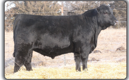
ME Top Cut 78 Maternal brother to lot 70 selected by Heim Bros, ND