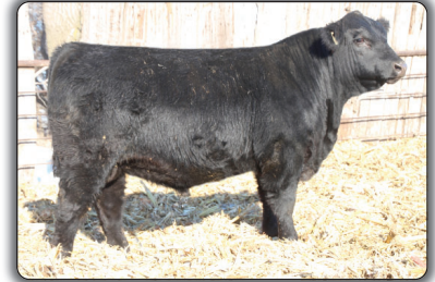
ME Double Vision 626 top-selling maternal brother to lot 31 selected by Stan Hunnel, SD