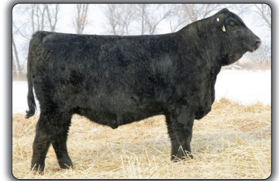
Hart Cavalry 3247 Reference Sire D