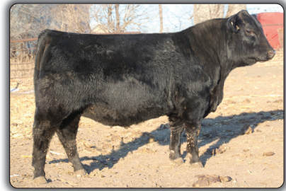
ME Thunder 144 sire of lot 45