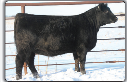
ME Black Queen 446 Maternal sister to lot 93 selected by Travis Neifer, SD