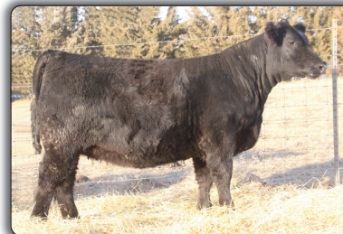
ME Stockmans Queen 298 $3100 top-selling maternal sister to lot 35 selected by Jung Cattle Co, SD