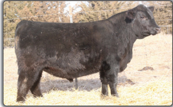
Son of Reference Sire C