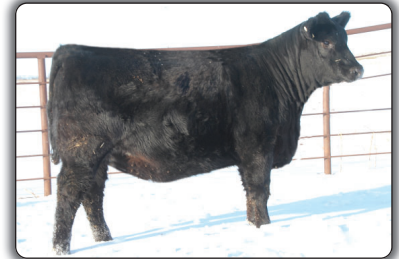
ME Queen Idelette 506 Maternal sister to lot 32 selected by Ringgenberg Angus, SD