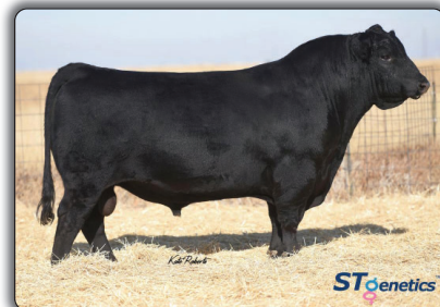
Bruns Top Cut 373 sire of lots 46 & 47