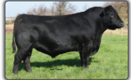
MAF Tanker 23 Reference Sire A