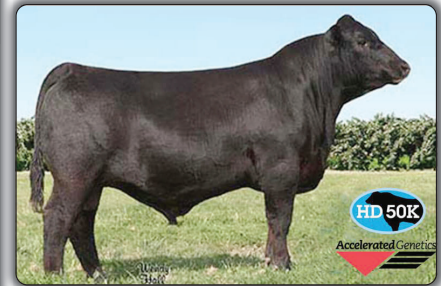
Silveiras Conversion 3048 Maternal grandsire of lot 60