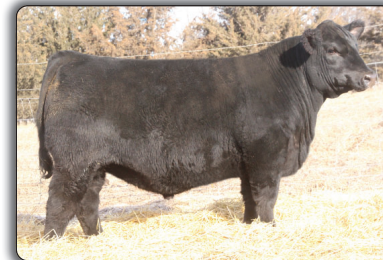
ME 3rd Dimension 728 $19,000 top-selling maternal brother to lot 42 selected JK Angus and Dikoff Angus Ranch, SD