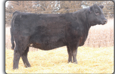
ME Marshalls Queen 417 Maternal sister to lot 24 selected by Sumption Farms, Frederick SD