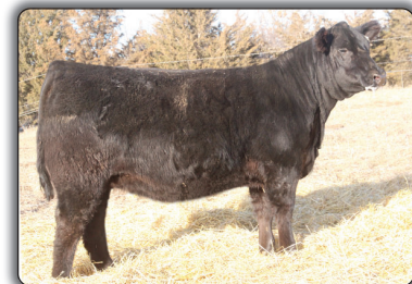
ME Black Queen 578 Maternal sister to lot 36 selected by Andy Daly, SD