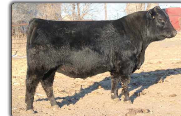
ME Thunder 144 Reference Sire F

Jauer 353 Traveler 589 27 # Pleasanta of Conanga 736 Bon View Bando 598 # Partina of Conanga 6237 S A V Final Answer 0035 # Hart Zara 7052 # W C C Special Design L309 #+ ME Black Queen 55