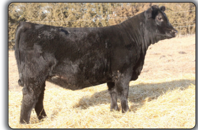
ME Black Queen 538 Maternal sister to lot 13 selected by Andy Dally, SD