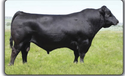
MOGCK Sure Shot sire of lot 43