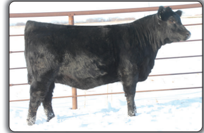
ME Queen OF Crackerjack 126 Maternal sister to lot 23 selected by Ringgenberg Angus, SD