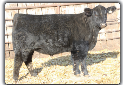
ME Foundation 374 $4250 maternal brother to lot 57 selected by Dick McNeil, SD