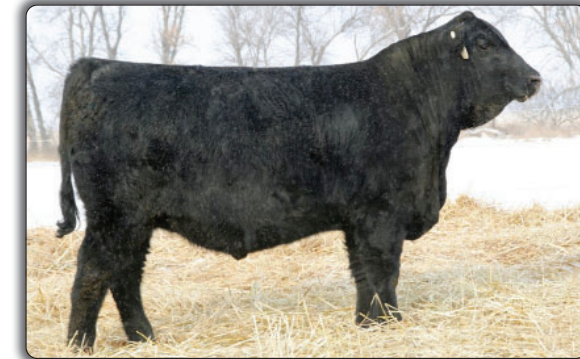
Hart Cavalry 3247 Reference Sire D

KMK Alliance 6595 187 # Blinda of Conanga 004 G A R Predestined #* Breeela of Conanga 3991 Vermilion Dateline 7078 # Big Rok Polly 020 + S A V 5175 Bando 1003 + Westwind Sandra J L H 009