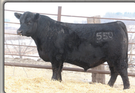
Big Rok Charlie 550 Reference Sire F and $6000 maternal brother to Lot 786 Selected by Al Olson, MN