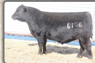
Big Rok High Noon 6106

Maternal brother to Lot 7106 Selected by Mark Bratland, MN