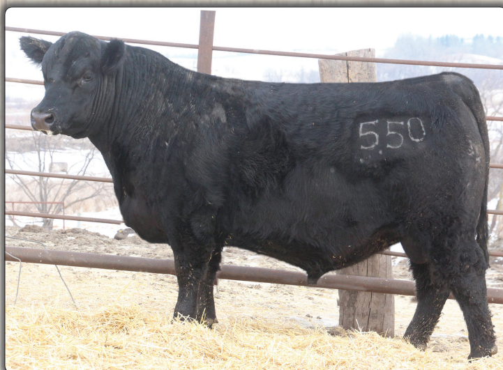
Big Rok Charlie 550 Sire of Lot 7138