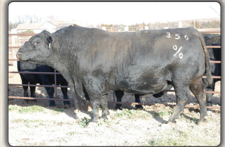
Coleman Rainmaker 356 Sire of Lot 744