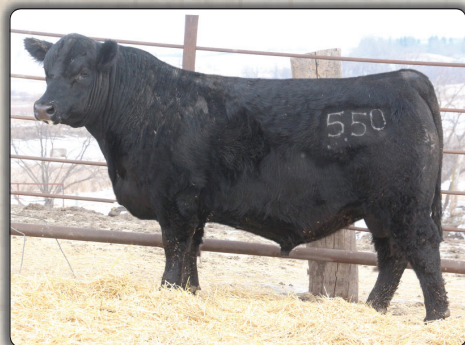
Big Rok Charlie 550 Reference Sire F