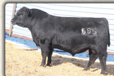
Big Rok XL 685

Maternal brother to Lot 7106 Selected by Mark Bratland, MN