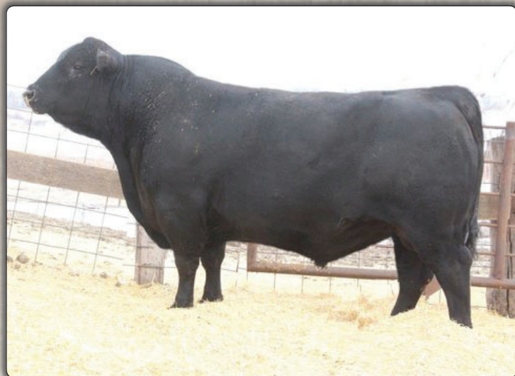
Msar High Noon 9463 Sire of Lots 776 & 793