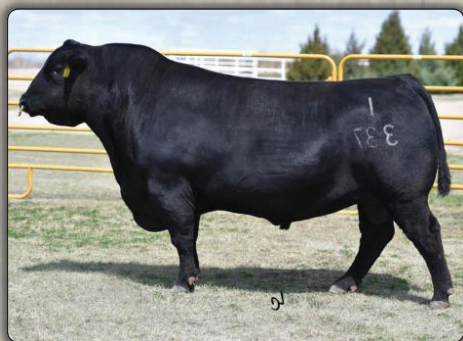
Connealy Guinness Reference Sire E