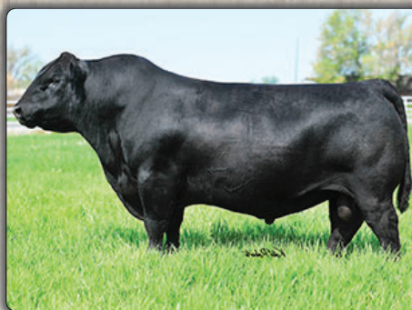
MAR Innovation 251 Reference Sire G