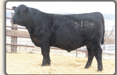
Big Rok Next Step 5104 $4000 maternal brother to Lot 7105 Selected by Mark Lewis, MN