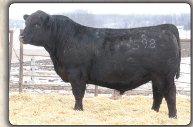
Big Rok Next Step 598 $5000 maternal brother to Lot 7125 Selected by Jeff & Brenda Malloy, MN