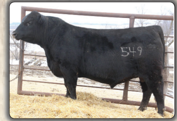
Big Rok Extra 549 $5500 maternal brother to Lot 7100 Selected by Mark Lewis, MN