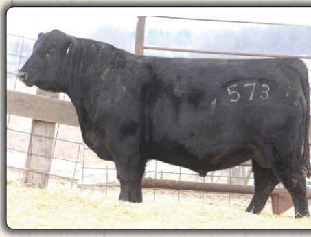
Big Rok Solid 573 Reference Sire H