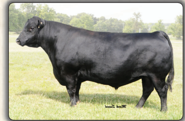
Basin Excitement Maternal grandsire of Lots 7129 & 7132